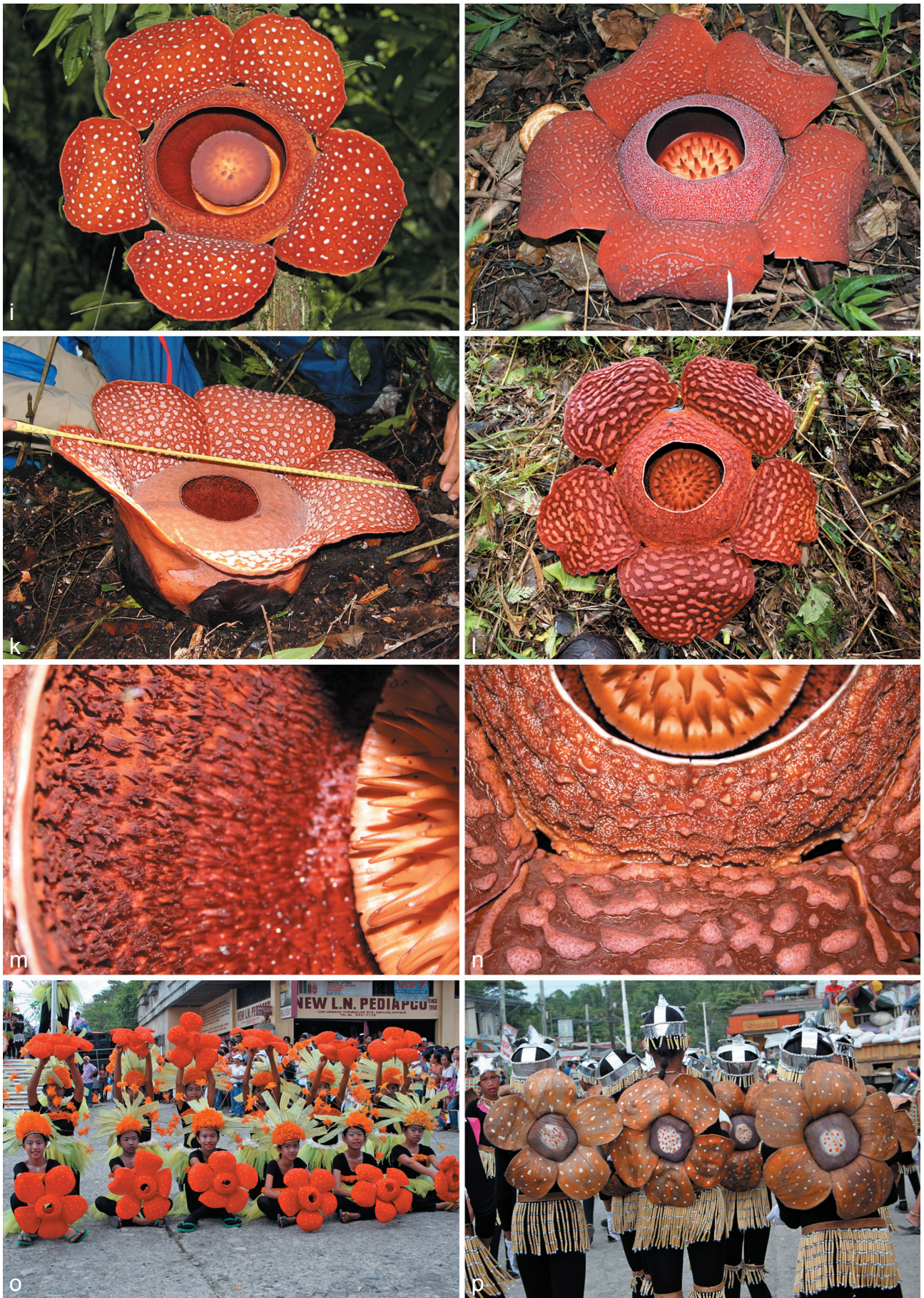
Plate 3 (cont.)