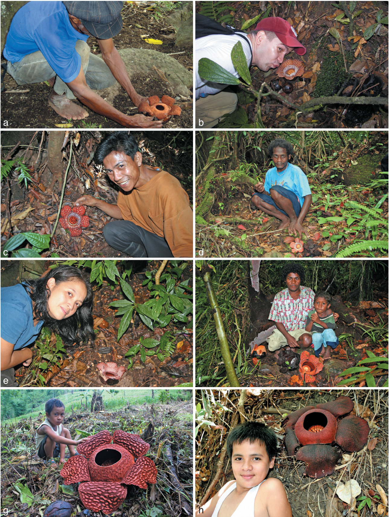
Plate 2 Philippine Rafflesia flowers in situ, showing their relative sizes. a. R. baletei, Mt Isarog; b. R. lobata, Mt Agua Coloña; c. R. manillana, Mt Labo; d. R. manillana, Kanapawan; e. R. philippensis, Mt Banahaw; f. R. leonardi, Kanapawan; g. R. schadenbergiana, Baungon; h. R. speciosa, Valderrama.