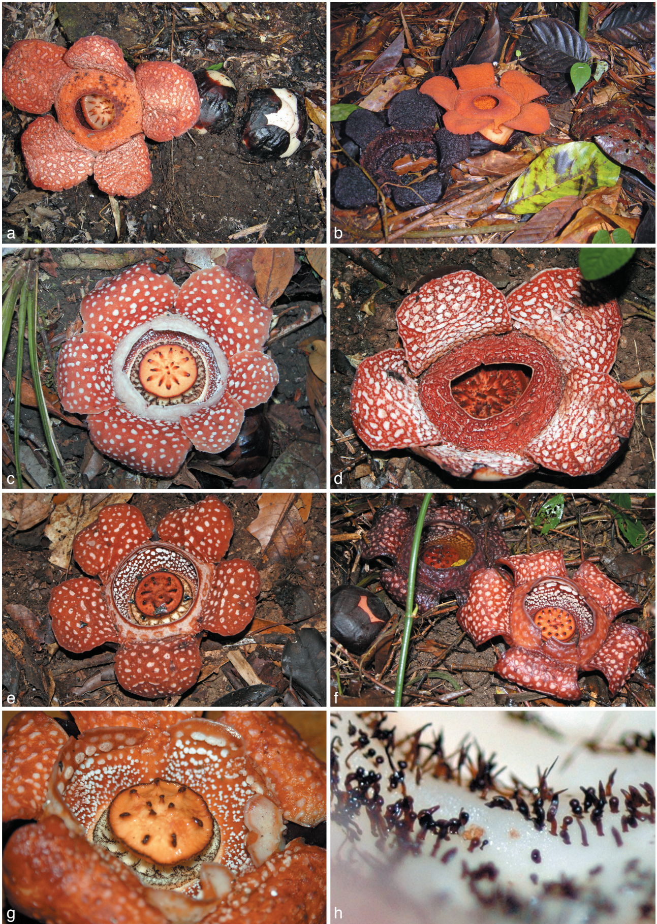
Plate 3 a–l. Philippine Rafflesia species. a. R. baletei, Mt Isarog; b. Rafflesia sp., Sierra Madre Mountains; c. R. lobata, Mt Agua Coloña; d. R. philippensis, Mt Banahaw; e. R. manillana, Mt Labo; f. R. manillana, Mt Natib; g, h. R. manillana, Kanapawan; i. R. leonardi, Kanapawan; j. R. speciosa, Valderrama; k. R. mira, Mt Candalaga; l–n. R. schadenbergiana, Baungon; o, p. Rafflesia as symbol for nature conservation, Buruyuganay Festival, Panay, Antique Prov., Sibalom.