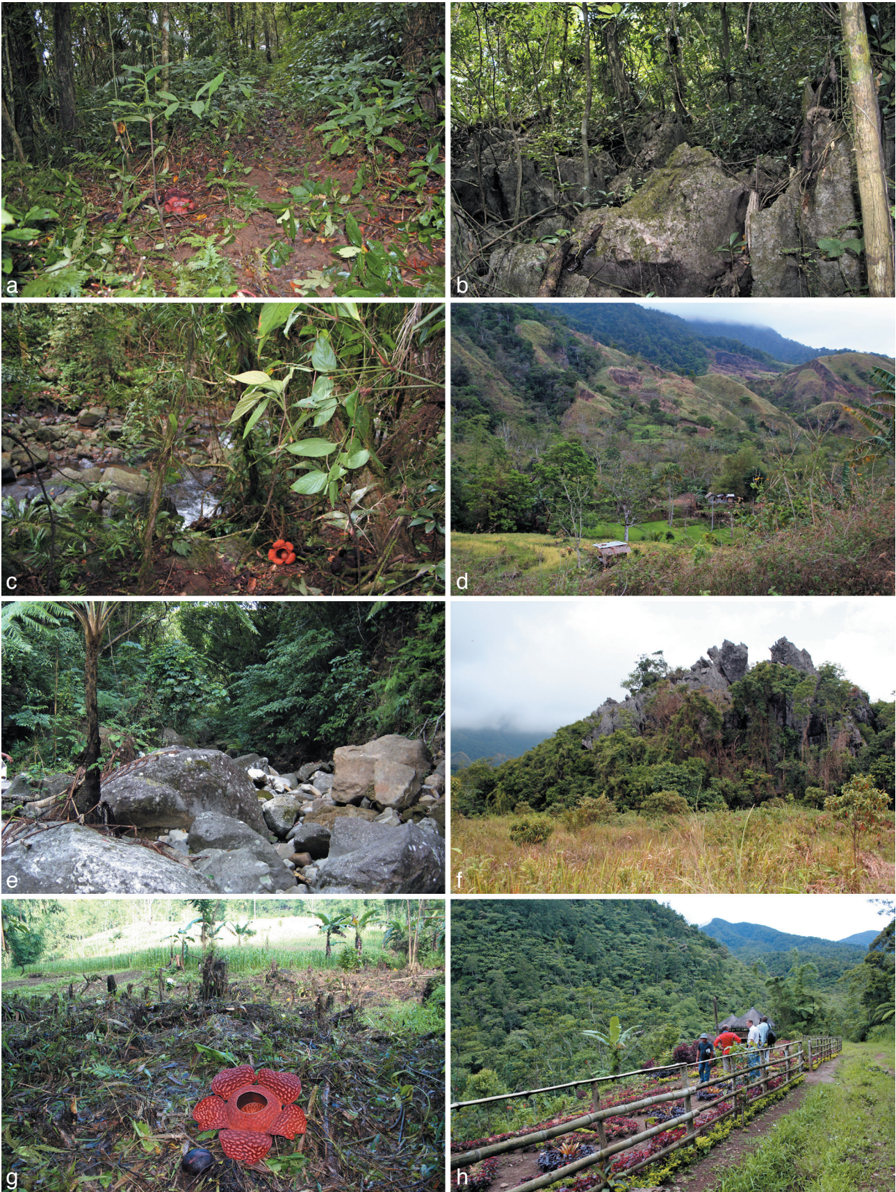
Plate 4 a–g. Habitat of Philippine Rafflesia species. a. R. manillana along a hiking trail, Mt Natib; b. karst limestone forest home to R. manillana, Bolos Point; c. R. leonardi on a stream bank, Kanapawan; d. forest patches containing R. speciosa amongst grass fields, San Remegio; e. rocky habitat of R. baletai, Mt Isarog; f. limestone outcrop near R. lobata site, San Remegio; g. forest patch bordered by slash-and-burn area home to R. schadenbergiana, Baungon; h. Ecotourism facilities for R. schadenbergiana, Baungon.