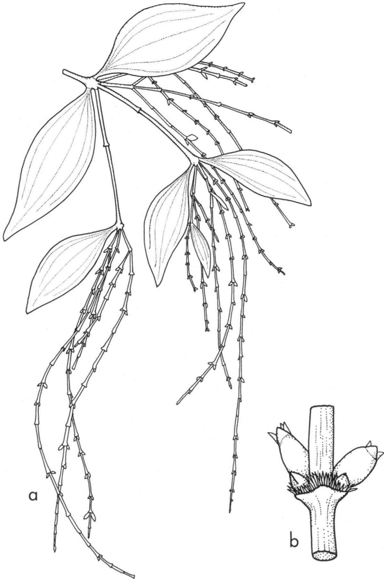
Fig. 1. Ginalloa flagellaris (Womersley & Whitmore NGF19070). a. Portion of plant, \times 0.5 ; b. inflorescence node with two triads, \times 4 .

Plant slender to moderately robust, pendulous, to 0.6 m long, glabrous. Stems with rudimentary leaves on all branches; internodes terete, 20–60 mm long, 1–3 mm in diameter, striate or longitudinally wrinkled. Leaves mostly rudimentary or sometimes rudimentary and normally developed in successive pairs; normally developed leaves