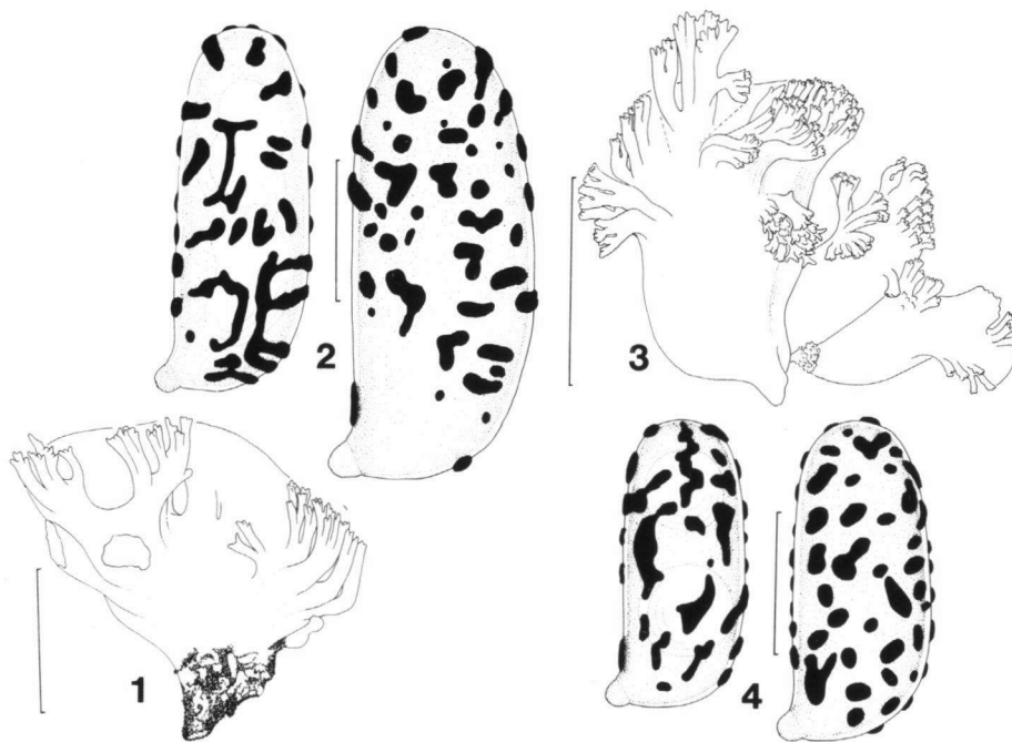
Figs. 1, 2. Ramaria brunneicontusa . — 1. Fruitbody, TENN 36811. — 2. Spores, TENN 36848. Figs. 3, 4. Ramaria flavicingula . — 3. Fruitbody, TENN 36832. — 4. Spores, TENN 36889. Standard bars = 4 cm for fruitbodies, 5 \mu m for spores.

in water; TYR = l-tyrosine in water; IKI = Melzer's reagent; PD = p-phenylenediamine. Recipes for these reagents may be found in Marr & Stuntz (1973) and Marr (1968). Colors in quotation marks are from Ridgway (1912), those with alpha-numeric citations are from Séguy (1936).