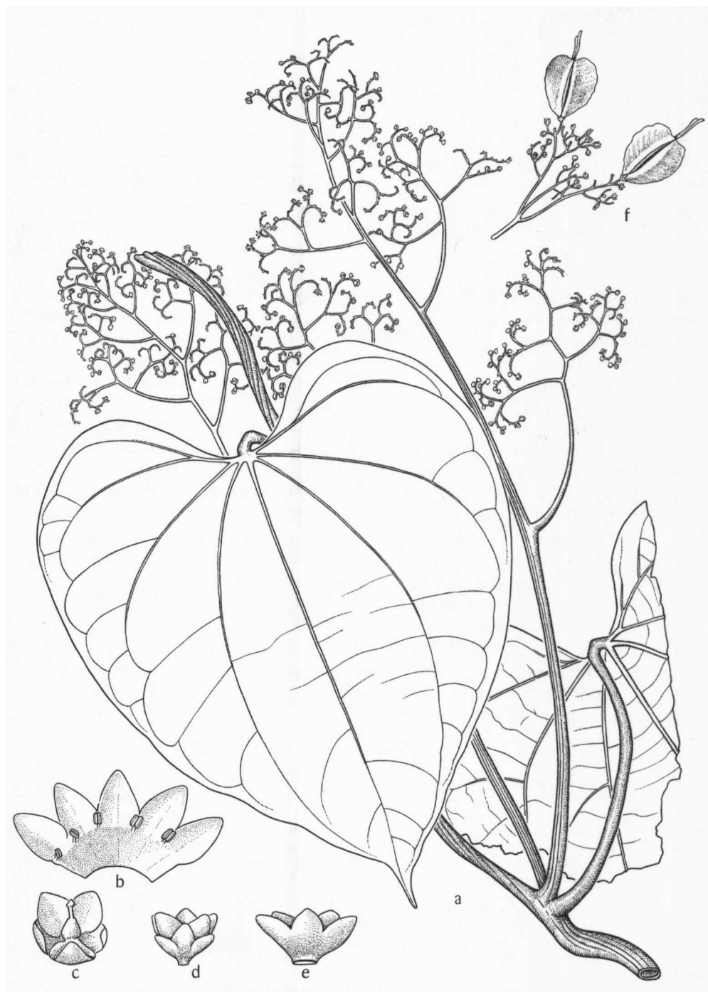
Fig. 1. Cardiopteris moluccana BL. a. Habit, with ♂ inflorescence, \times \frac{1}{2} , b. ♂ flower, corolla and stamens, \times 15 , c. ♀ flower, corolla and ovary, \times 15 , d. flower, lateral view with calyx and corolla, \times 7 , e. flower calyx, \times 10 , f. infructescence, \times \frac{1}{2} (a-f BLUME).