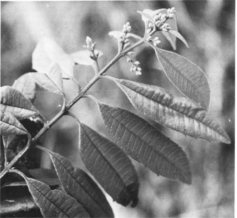
Fig. 3. Trimenia papuana RIDL. In Papua New Guinea (PHILIPSON 3692).