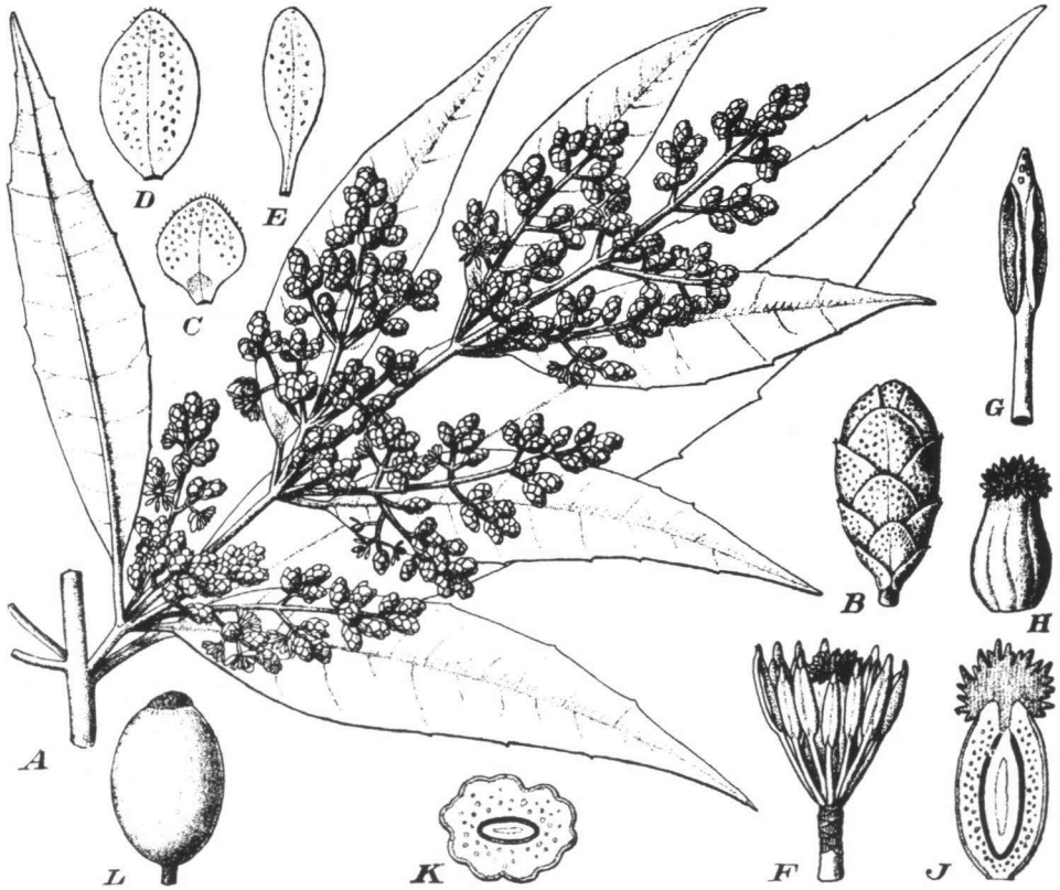
Fig. 1. Trimenia papuana RIDL. A. Habit, nat. size, B. bud, \times 6 , C–E. outer, middle and inner tepals, \times 8 , F. flower, after removal of tepals, \times 7 , G. stamen, from inside, \times 10 , H. ovary, \times 7 , J. ditto in LS, \times 10 , K. ditto in CS, \times 12 , L. fruit, \times 3 (after GILG & SCHLECHTER, 1919).

Wales), Solomons (Bougainville) and Malesia : New Guinea (incl. New Britain & New Ireland), Moluccas (Ceram, Batjan) and Central Celebes. In all 5 spp. Fig. 2.