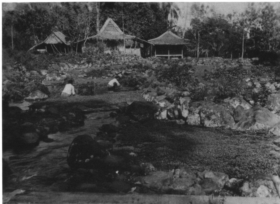
Fig. 4. Harvest of Rorippa nasturtium-aquaticum (L.) HAYEK (Photogr. W.F. WINCKEL, 1918).

(1912) 288; MERR. En. Philip. 2 (1923) 208; HEYNE, Nutt. Pl. Ned. Ind. (1927) 680; OCHSE & BAKH. Ind. Groenten (1931) 176, f. 108; BURK. Dict. (1935) 1534; QUIS. Medic. Pl. Philip. (1951) 335; BACKER & BAKH. f. Fl. Java 1 (1963) 191; GILLI, Ann. Naturhist. Mus. Wien 83 (1980) 430; LENCH & OSBORNE, Fresh-water Pl. Papua New Guinea (1985) 105. — Rorippa officinalis (R.Br.) P.ROYEN, Mt. Fl. New Guinea 3 (1982) 2029. — Fig. 4.