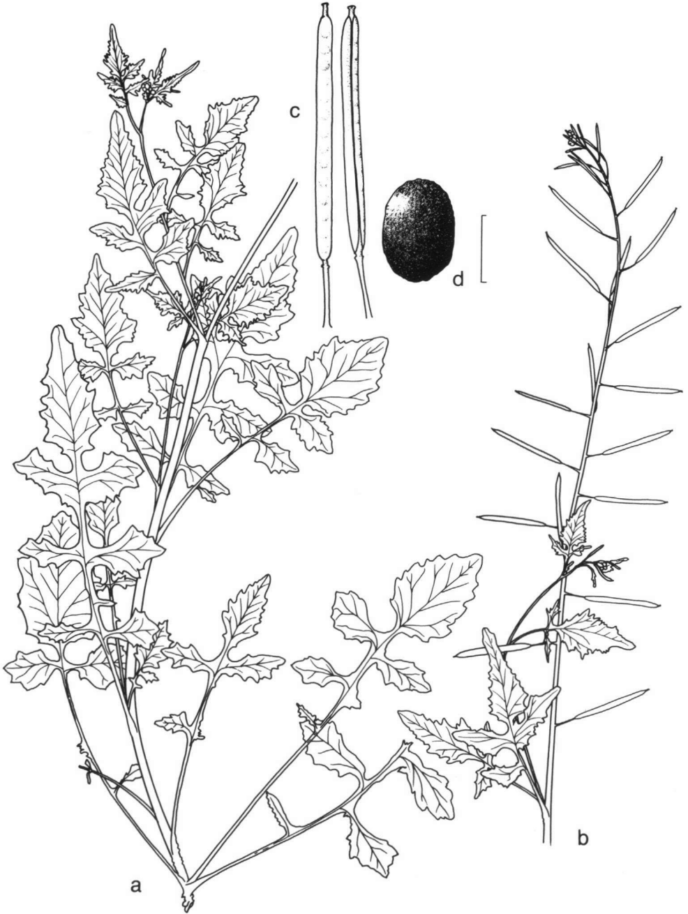
Fig. 5. Rorippa peekelii (O.E.SCHULZ) P.ROYEN. a. Habit, \times 0.7 ; b. fruiting raceme, \times 0.7 ; c. siliqua, \times 2 ; d. seed, scale bar 1 mm ( a BRASS 30519, b SAYERS NGF 21316, c, d WOMERSLEY NGF 14272). Del. K.G. FORSS.