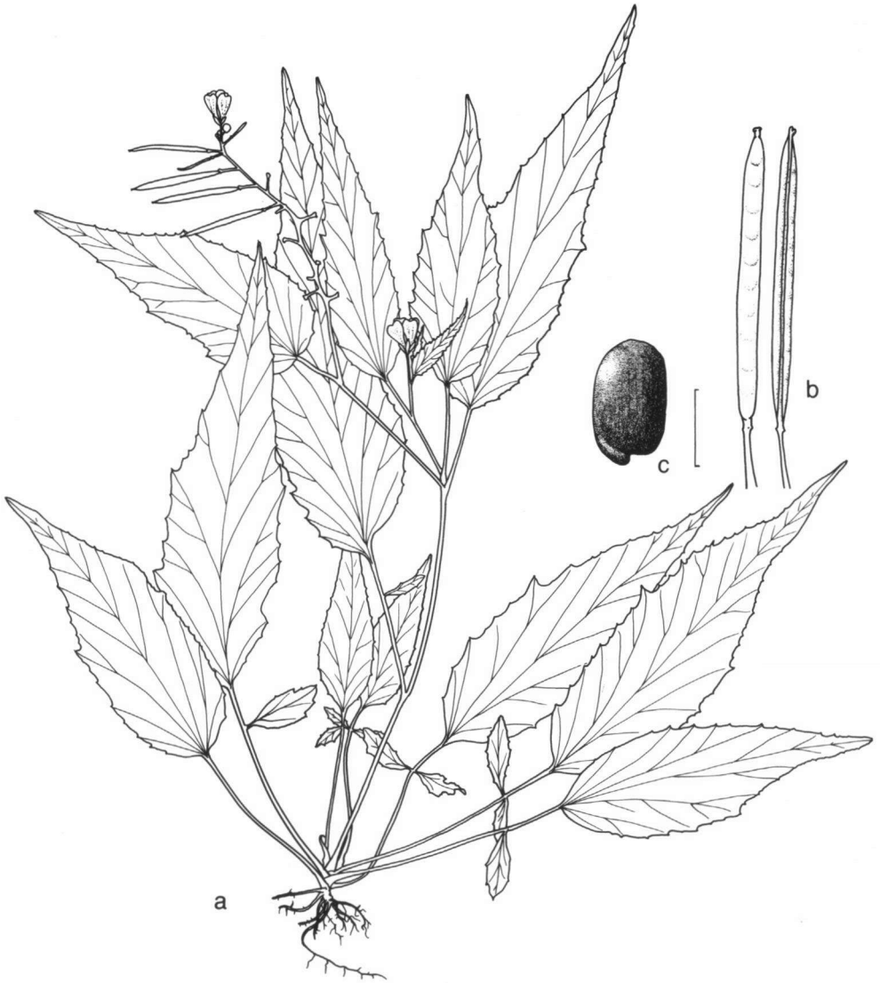
Fig. 3. Cardamine papuana (LAUT.) O.E.SCHULZ. a. Habit, \times 0.6 ; b. siliqua, \times 2 ; c. seed, scale bar 1 mm (SCHODDE 5540). Del. K.G. FORSS.

Bijdr. (1825) 51; ZOLL. & MOR. Syst. Verz. (1845/46) 35; MIQ. Fl. Ind. Bat. 1, 2 (1858) 93. — C. javanica (BLUME) MIQ. Ill. Arch. Ind. (1871) pl. X; BOERL. Handl. Fl. Ned. Ind. 1, 1 (1890) 58; BACKER, Schoolfl. Java (1911) 56. — C. africana L. ssp. borbonica (PERS.) SCHULZ, Bot. Jahrb. 32 (1903) 414; DOCTERS VAN LEEUWEN, Verh. Kon. Akad. Wet. Amsterdam,