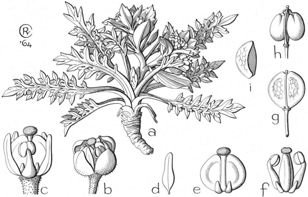
Fig. 2. Lepidium laeteviride (P. ROYEN) HEWSON. a. Habit, \times 4 ; b. flower, \times 12 ; c. ditto, calyx removed; d. petals; e. ovary; f. ovary, lateral view; all \times 16 ; g. fruit; h. seeds; i. fruit valve; all \times 4 (P. ROYEN 20026).

with 4 shield-like nectaries, one on either side of each stamen. Ovary elliptic with very short style. Siliculae broadly to cordate in outline, 2.5–5 by 2–4 mm, with narrow wing in upper third, not or indistinctly narrowly and shallowly emarginate; style 0.5–1 mm long, stigma exserted from the sinus. Seeds wingless, dark brown, 1–2 by 0.5–1.3 mm.