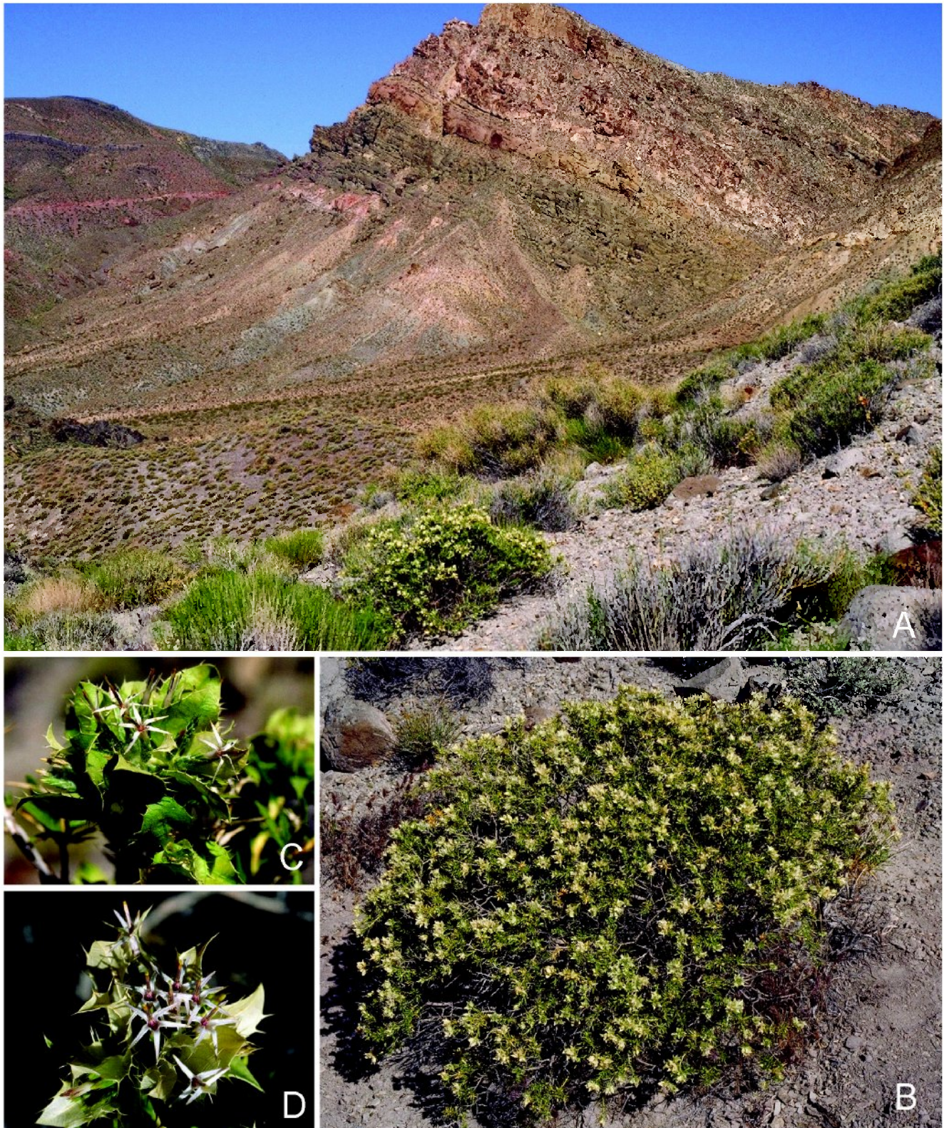
Fig. 16.1. Hecastocleis shockleyi A. Gray. A Red Pass, high point on the road to Titus Canyon, Death Valley, California, USA, Hecastocleis in the foreground; B habit; C close up of florets, involucre tightly appressed to single-flowered heads and bracts (greenish); D close up of several single-flowered heads, corollas deeply lobed, pink turning white, bracts whitish. [Photographs, V.A. Funk of Funk et al. 12487–12488.]