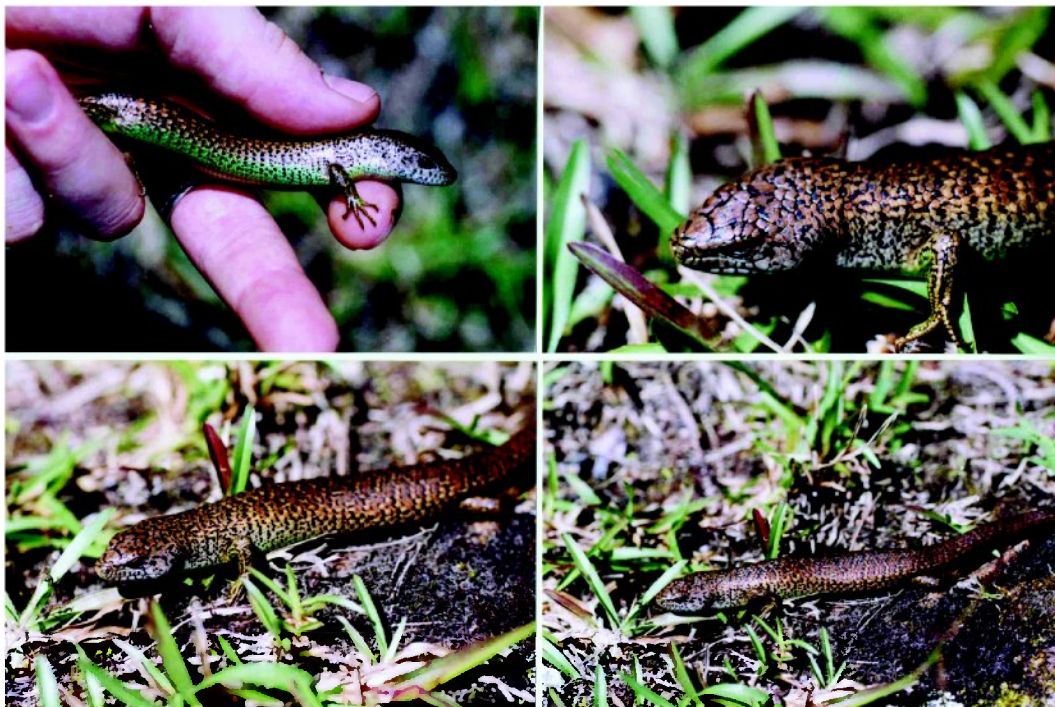
Fig. 3. Celestus orobius from Costa Rica: Provincia de San José: Parque Nacional de Chirripó Grande, 1 800 m.