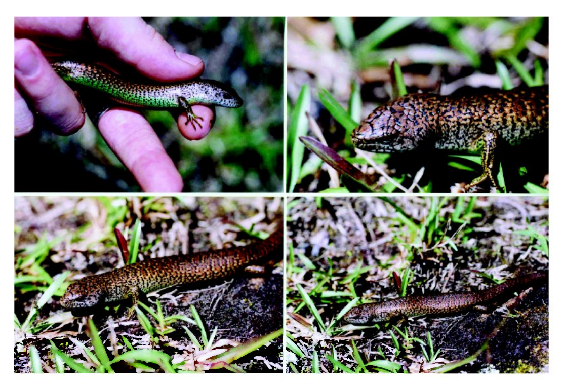
Fig. 3. Celestus orobius from Costa Rica: Provincia de San José: Parque Nacional de Chirripó Grande, 1 800 m.