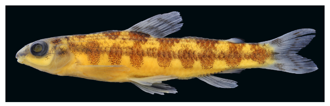
Fig. 2. Nannocharax dageti, CUMV 91303, 34.4 mm SL; Zambia: Northern Province: Samfa rapids at pontoon on Chambeshi River.

1972.8.4.18-32, 11 of 15, 21.8-39.1 mm SL (10 measured, 27.1-39.1 mm SL); Zambia; G. Bell-Cross. - CUMV 91303, 5, 30.1-34.4 mm SL, Zambia: Northern Province: Chambeshi River drainage, Samfa Rapids at pontoon on Chambeshi River; 10°51'07.5" S 31°10'02.2" E; R. Bills, Chilala & J. P. Friel, 11 Oct 2005. - MRAC P-96083.1136-96083.1139, 4, 26.8-29.9 mm SL; Zambia: Chambeshi River system, Lukupa River, approximately 28 km on road from Kasam to Luwimgu; 10°10'49.9"S 30°57'45.4"E; L. de Vos, 20 Oct 1995. - MRAC P-142078-142081, 4, 35.5-44.2 mm SL; Zambia: Solwezi River, Kafue River system; 12°12'S 26°24'E; G. Bell-Cross, 8 Mar 1963. MRAC P-144818-144821, 4, 32.2-41.9 mm SL; Democratic Republic of the Congo: Katanga: Kimilolo River, environs of Lubumbashi (formerly Élisabethville); M. Lips, Sep 1962. – MRAC P-144872-144873, 2, 26.6-27.9 mm SL; Democratic Republic of the Congo: Katanga: environs of Lubumbashi (formerly Élisabethville); M. Lips, 1963. – ZSM 41949, 3, 26.0-29.2 mm SL; Democratic Republic of Congo: Lualaba Province: Kasai River below and above Saipako Falls, 975 m asl, approximately 15 km by air NNW of Dilolo at