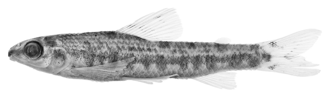
Fig. 1. Nannocharax dageti, MRAC P-88846, holotype, 34.8 mm SL; Democratic Republic of the Congo: Kando.