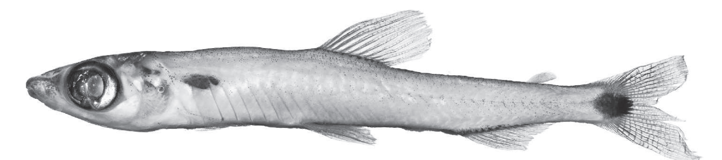
Fig. 1. Nannocharax hastatus, new species, CUMV 89072, 31.6 mm SL, holotype, Africa, Republic of the Congo, Cuvette-Ouest, Likouala River drainage, small canal around island in Lékoli River, Odzala National Park.

Holotype. —CUMV 89072, 31.6 mm SL, Republic of the Congo, Cuvette-Ouest, Likouala River drainage, small canal around island in Lékoli River, Odzala National Park, 0°37'12"N, 14°55'5.9"E, J. P. Friel, S. Lavoué, J. P. Sullivan, 15 August 2002.