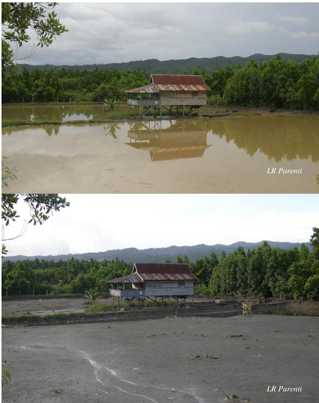
Figure 5. Artificial pond or tambak near Kendari, above, at high tide, 15 June 2010, 1500-1630 (LRP 10-09), below, at low tide, 20 June 2010, 1645-1730 (LRP 10-22).

Remarks: This species most closely resembles Oryzias javanicus , a ricefish distributed broadly throughout the Indo-Australian Archipelago. It and the rest of the Javanicus Species complex are currently under review by our research team.