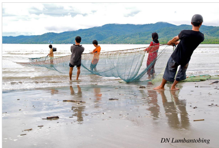
Figure 3. Batu Gong Beach, northwest of Kendari, Kabupaten Konawe, 16 Jun 2010 (LRP 10-10)