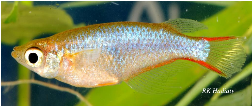
Figure 6. Oryzias wolasi , LRP 10-05, 14 June 2010