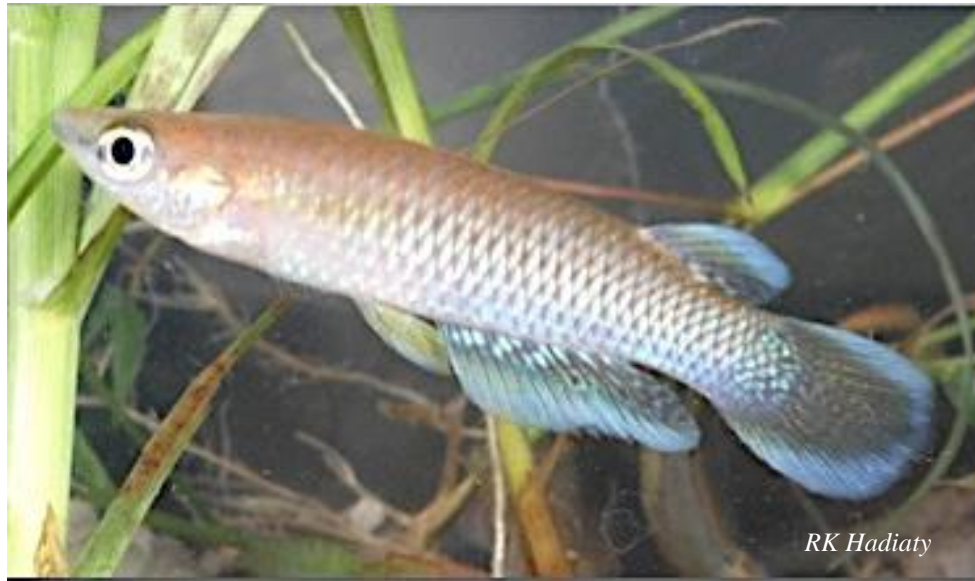
Figure 4. Aplocheilichthys panchax , LRP 10-06, 14 June 2010, a possibly introduced species in Sulawesi Tenggara

Oryzias woworae Parenti & Hadiaty, 2010 (Figure 1a), Endemic