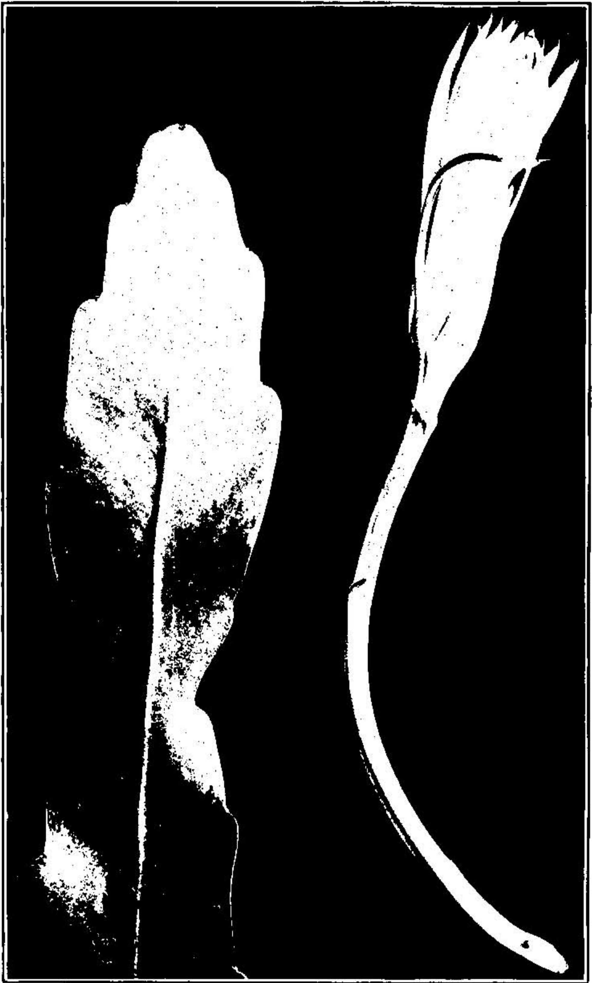
EPIPHYLLUM GUATEMALENSE BRITT. & ROSE.