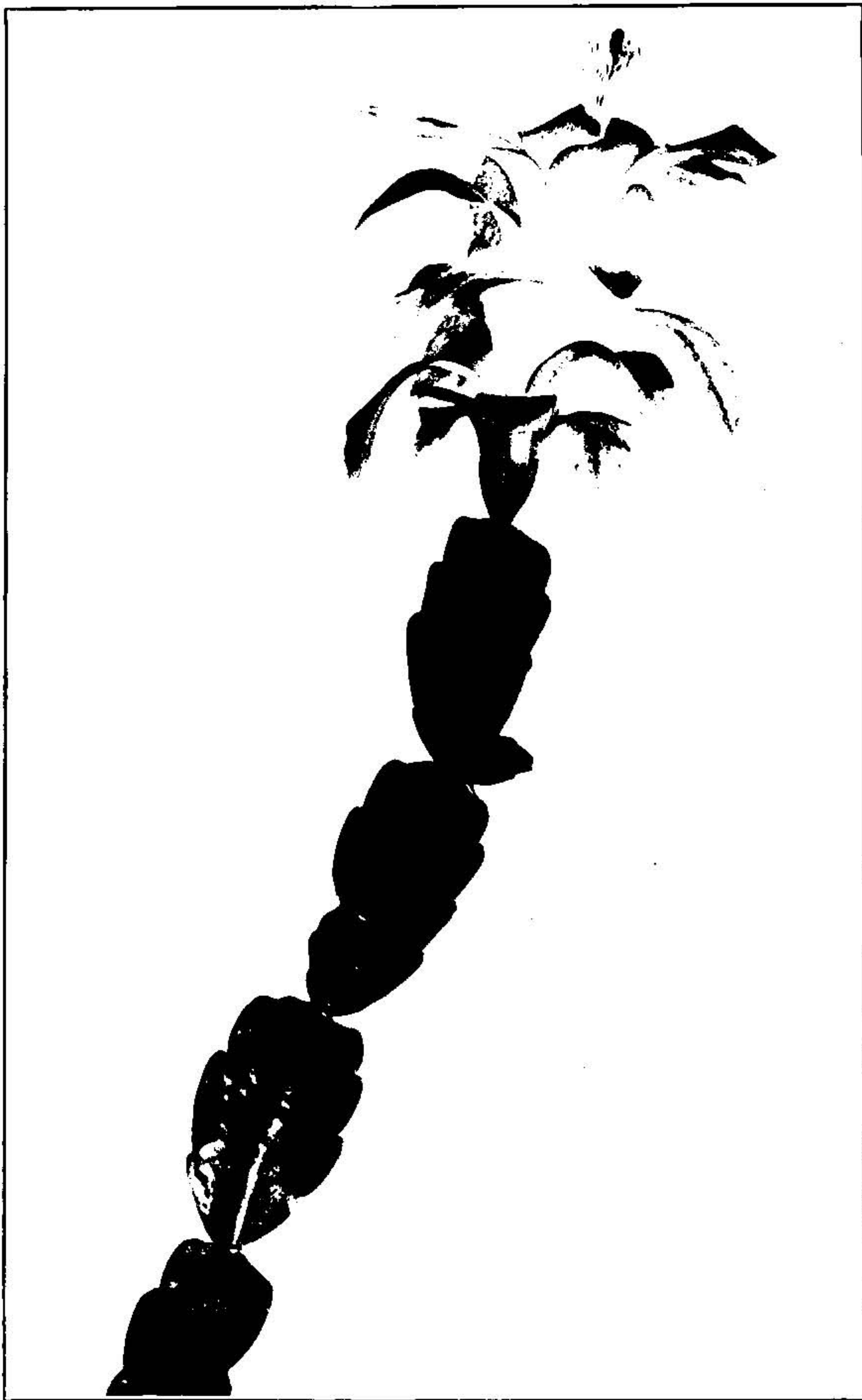
SCHLUMBERGERA RUSSELLIANA (HOOK.) BRITT. & ROSE.