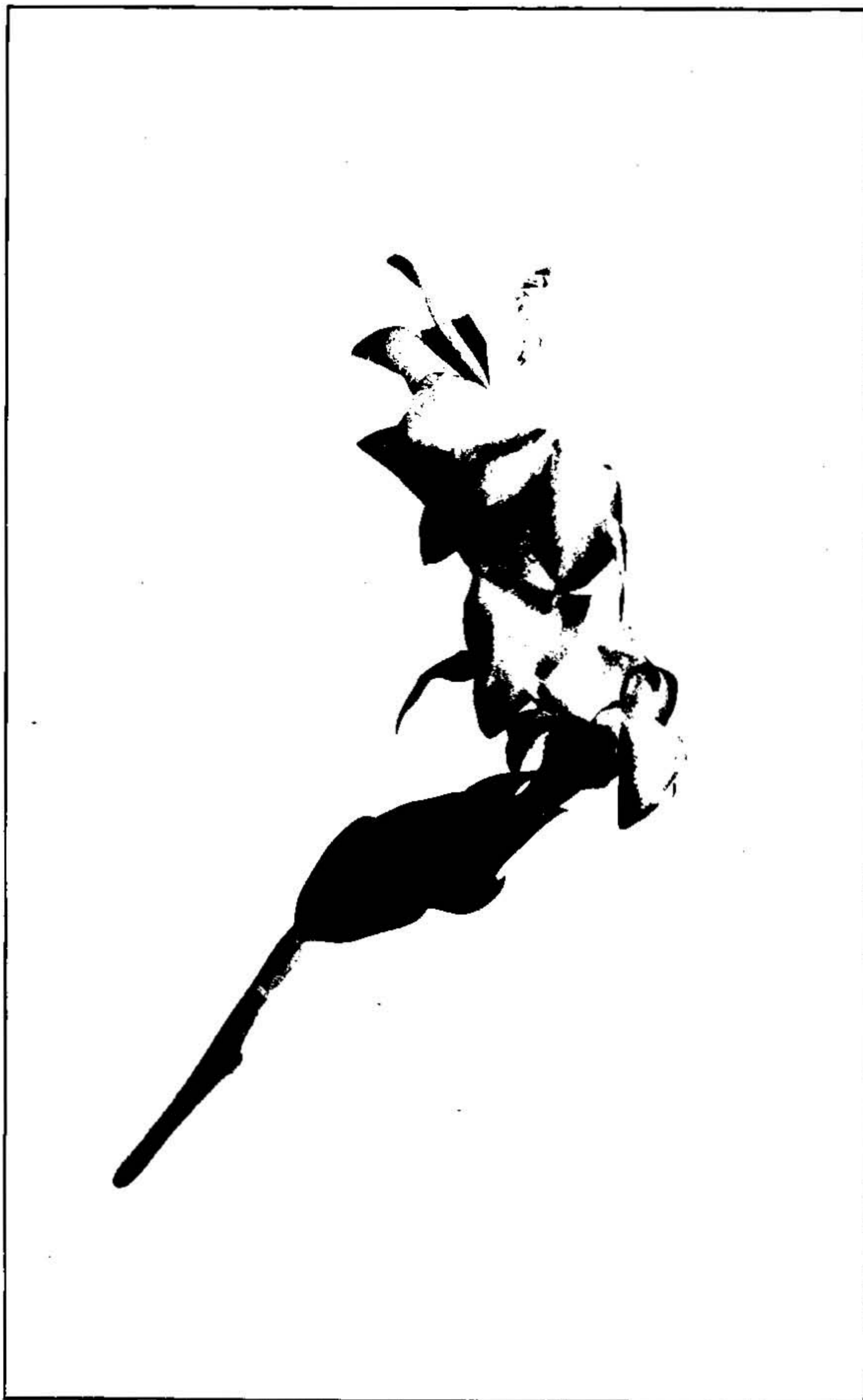
ZYGOCACTUS TRUNCATUS (HAW.) SCHUM.