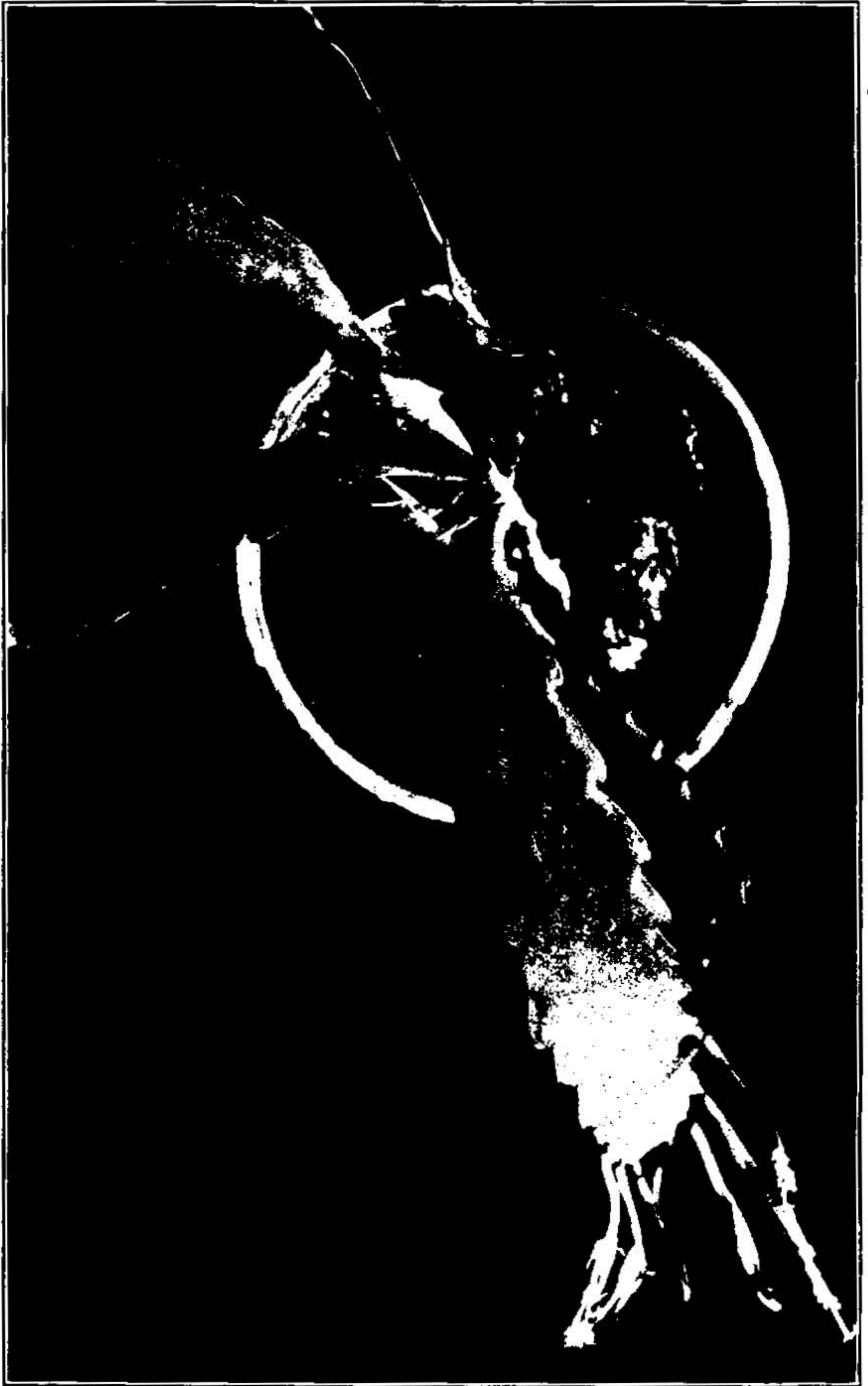
DISOCACTUS EICHLAMII WEING. BRITT. & ROSE.