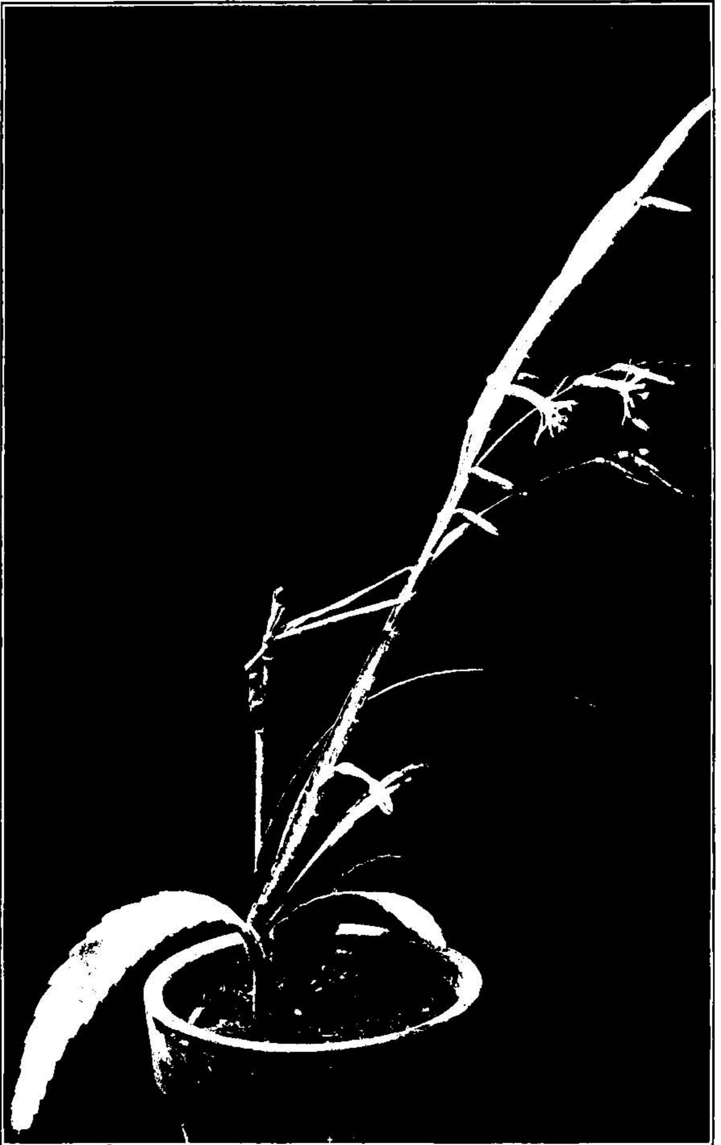
WITTIA COSTARICENSIS BRITT. & ROSE.