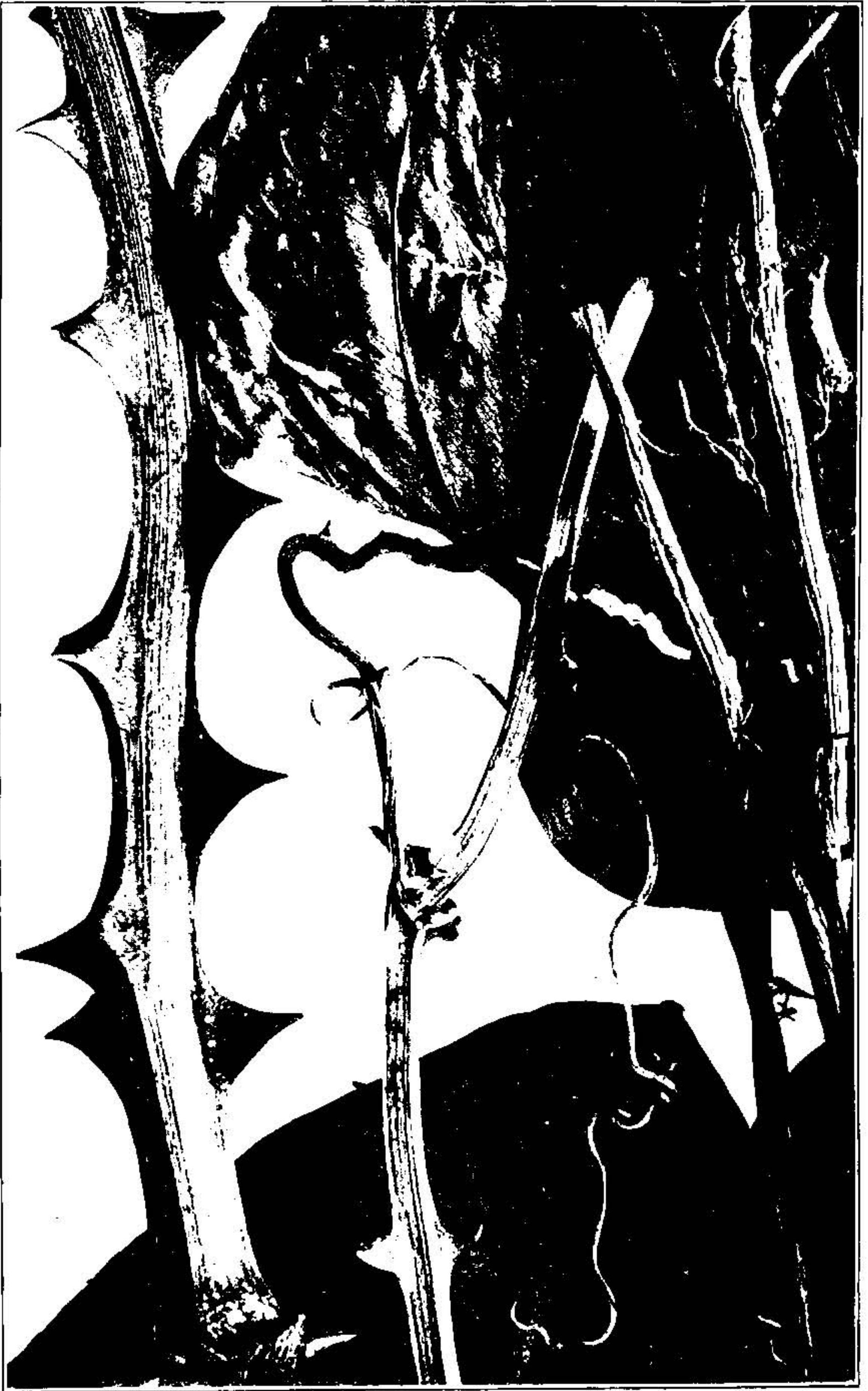
SMILAX ORNATA LEMAIRE.