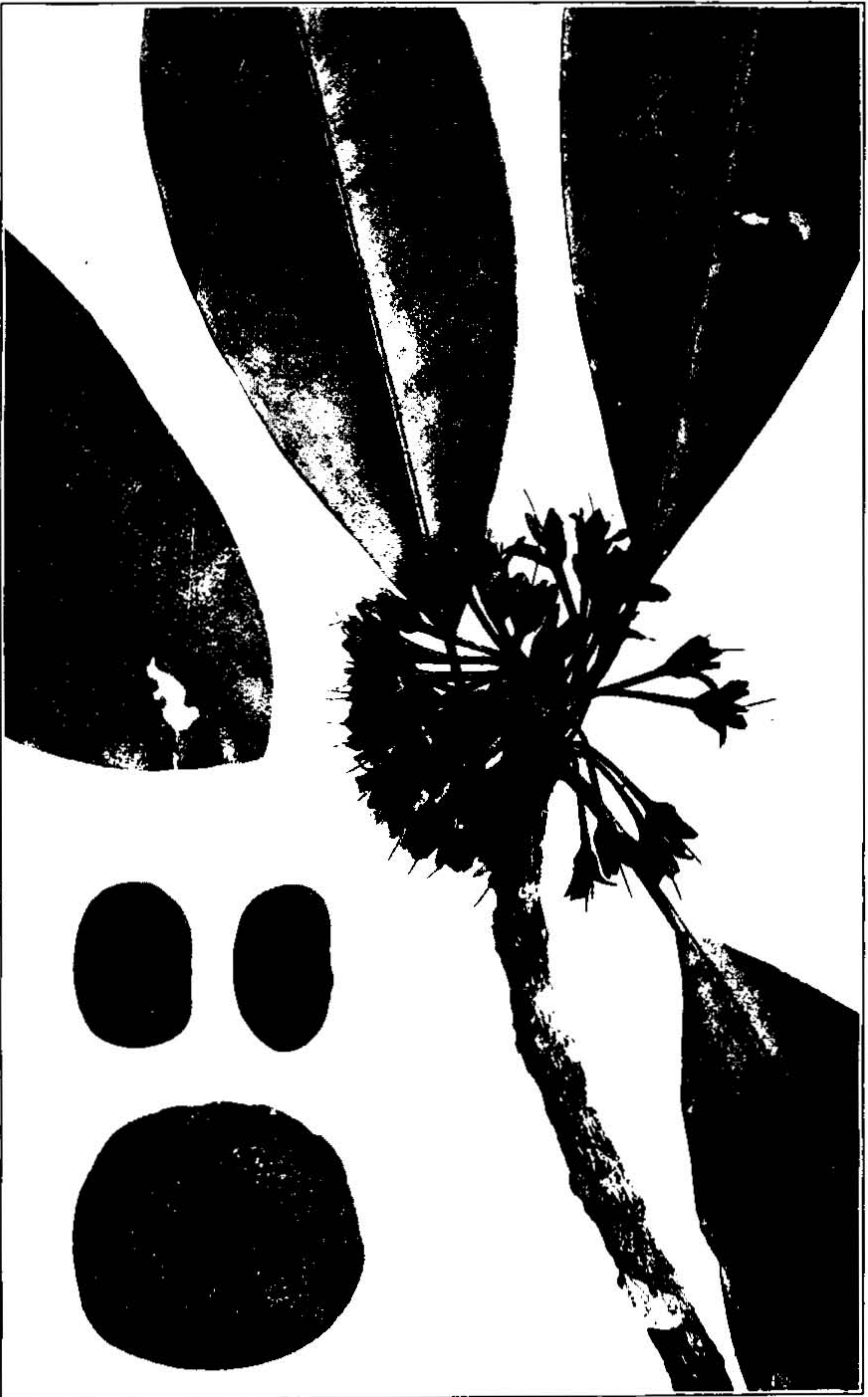
ACHRAS CHICLE PITTIER.