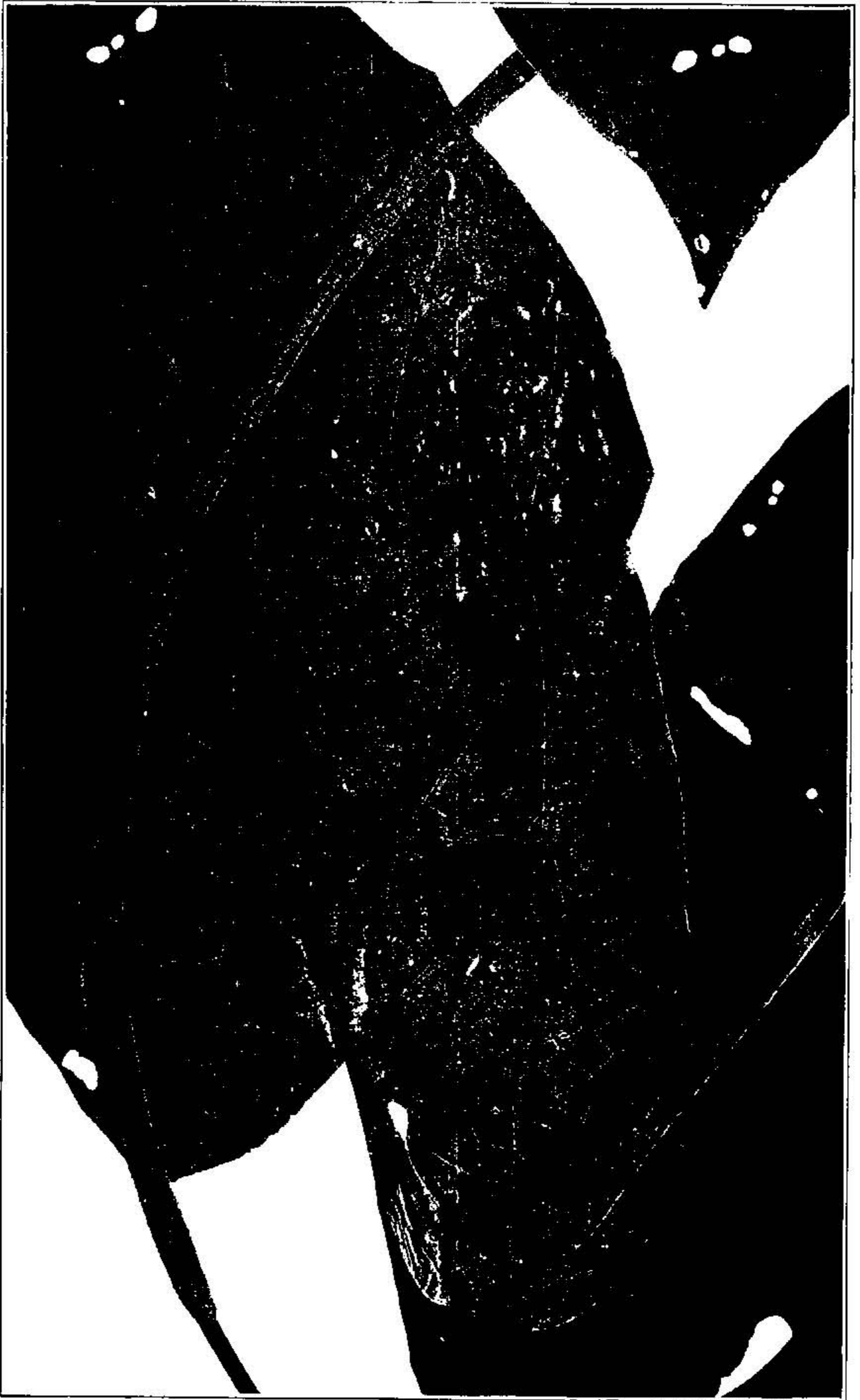
PIPER AURITUM AMPLIFOLIUM C. D C.