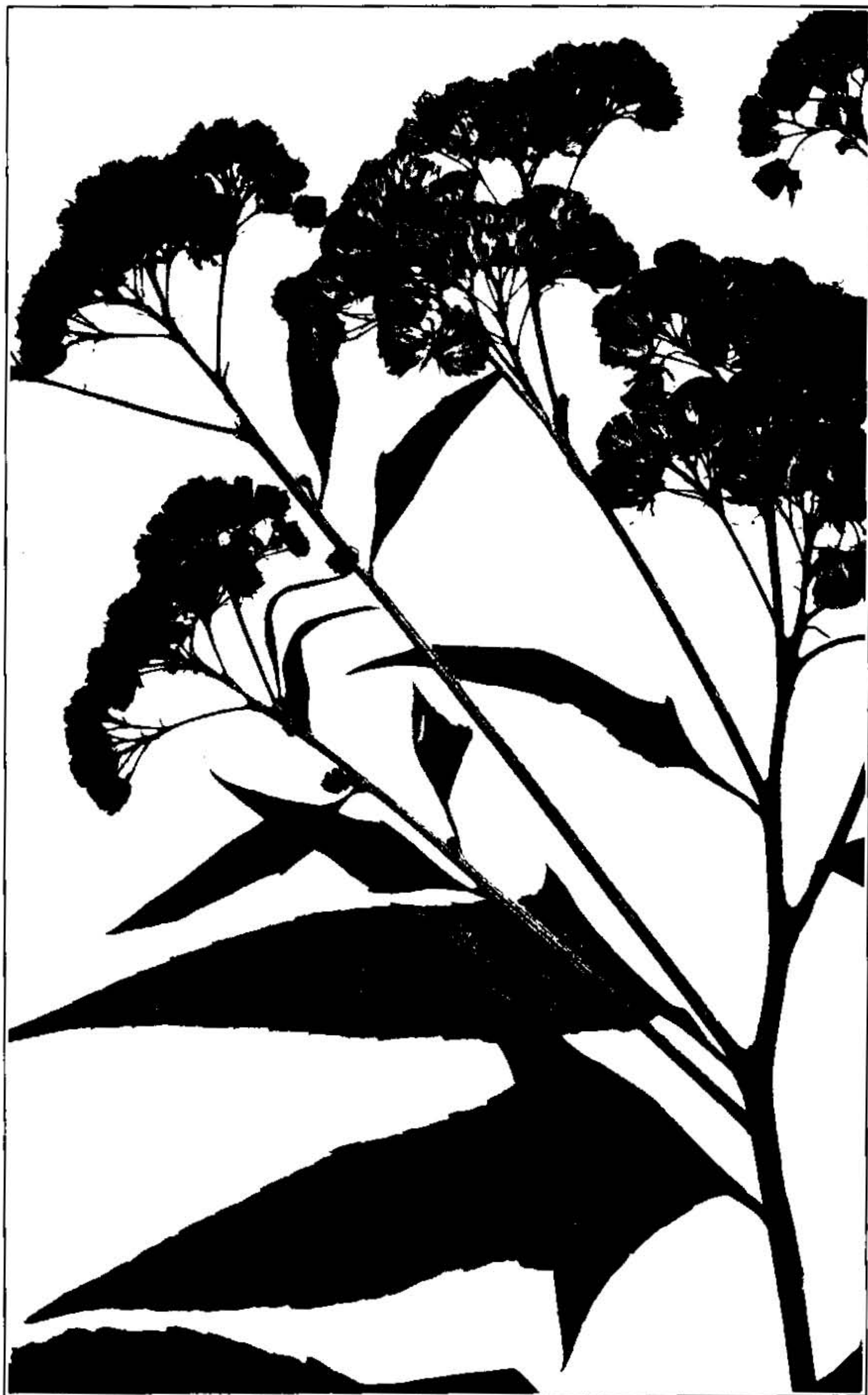
NEUROLAENA LOBATA (L.) R. BR.