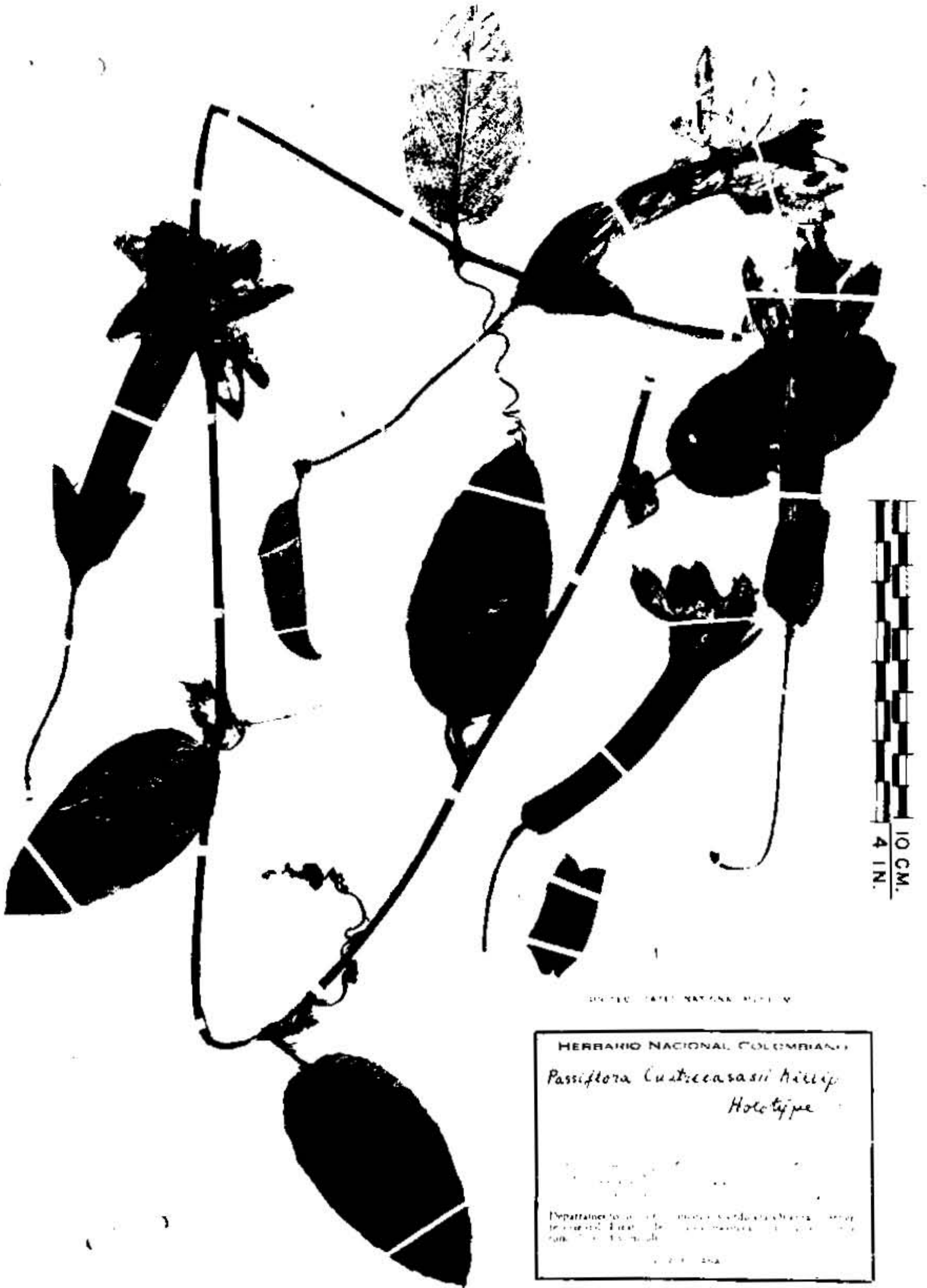
PASSIFLORA CUATRECASASII KILLIP