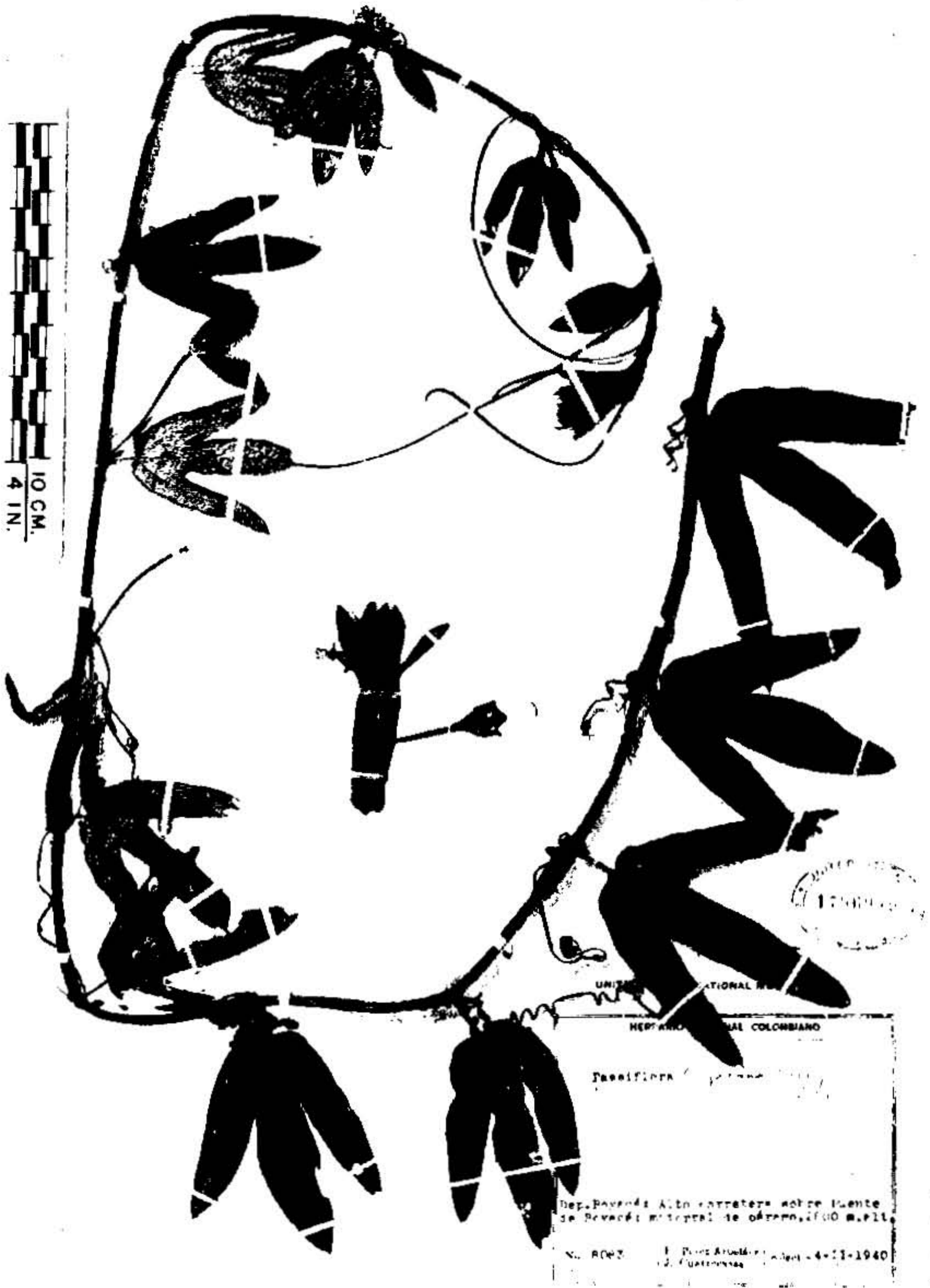
PASSIFLORA BOYACANA KILLIP