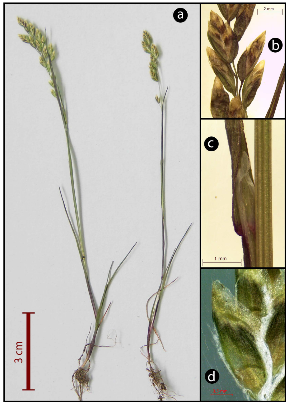
Figure 3. P. jubata: (a) habit, (b) inflorescence, (c) ligule, and (d) lemma.

Hermaphroditic. Annuals; without rhizomes or stooling branches, tufted; tufts tiny, slender, violaceous; unbranched or with branching intravaginal. Culms 12-45 cm tall, erect (or weakly geniculate at base), solitary or few together, slender (to 1 mm diam.), terete, smooth, glabrous, with 1-2 nodes exerted. Leaf sheaths keeled, weakly compressed, smooth or sparsely to moderately retrorsely scabrous, glabrous, bases of basal sheaths glabrous; flag-leaf sheaths 4-8.5 cm long, margins fused