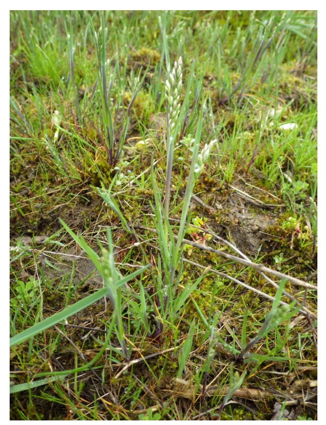
Figure 4. P. jubata photo taken at the Kırklareli locality.

25-35(-50) percent the length, much longer than the blade, not inflated; throats and collars smooth, glabrous; ligules 2-4(-5) mm long, abaxially smooth, glabrous, milkywhite, narrowly decurrent, apices acute, sometimes erose; sterile shoots absent; culm blades 0.3-4 cm long, 0.6-1 mm wide (expanded), folded, moderately thin, withering in age, abaxially smooth, adaxially smooth or sparsely scabrous, margins sparsely to moderately scabrous, apices abruptly prow-tipped, flag-leaf blades sub-erect. Panicles 2-7 cm long, ellipsoid, rhomboid, or pyramidal, erect or slightly lax, open, sparse, with 6-40 spikelets; axis with 1-2(-3) branches per node; primary branches, ascending to spreading, spreading to patent (at and after flowering), weakly angled, sparsely to moderately scabrous mainly over the weak angles, longest branches 1-4 cm, with 3-7 spikelets clustered in 2s and 3s near branch tips; pedicels 0.5-1 mm long, mostly less than 1/4 as long as the spikelet. Spikelets 3.5-4.5 mm long, broadly ovate, laterally compressed, slightly plump; not bulbiferous, green or violaceous, with 3-6(-11) florets; rachilla internodes short (ca 0.4 mm long), terete, smooth or sparsely muriculate; glumes, lanceolate to broadly ovate, subequal to equal, slightly shorter than adjacent lemmas, distinctly veined, distinctly keeled, slightly thinner than lemmas, keel