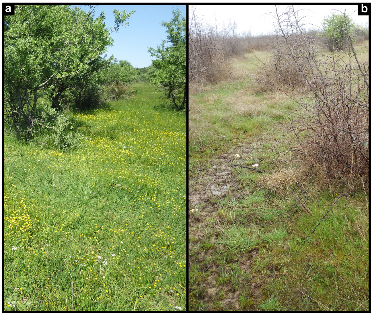
Figure 5. Habitat of P. jubata populations in (a) Enez (Edirne) and (b) Kırklareli locations.

The Kırklareli population was collected in early inflorescence emergence (19 April 2015), ca. 50 km inland from the Black Sea, ca. 100 km N of the Marmara Sea, at ca. 190 m elevation, in a swale, in a Paliurus spina-christi Mill. thicket, in shallow wet depressions on a nearly level, low bedrock rise, in thin gray-brown clay soil, within a somewhat sparse, mossy, herb, and graminoid meadow including Cerastium sp., Muscari sp., Thinopyrum intermedium (Host) Barkworth & D.R.Dewey, Poa annua L., Piptatherum miliaceum (L.) Coss., and Aira caryophyllea L. (Figure 5b). At both of these collection sites the species was locally common, suggesting these are primary habitats. Searches of sandy places near the coast and elsewhere in the Thrace region have not turned up any P. jubata populations, but new searches in the above habitats are likely to yield new localities. Paliurus spina-