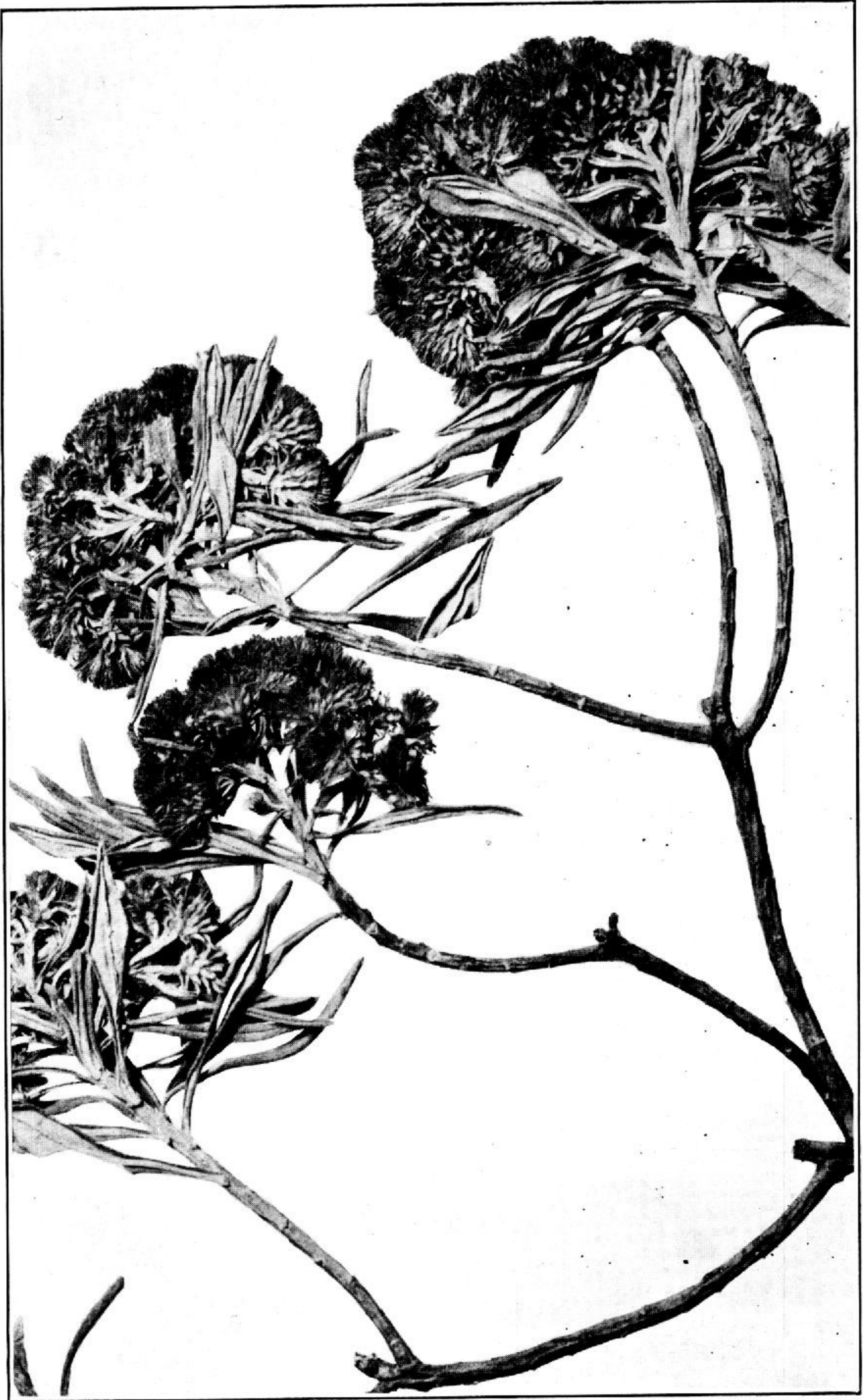
DIPLOSTEPHIUM COSTARICENSE BLAKE.