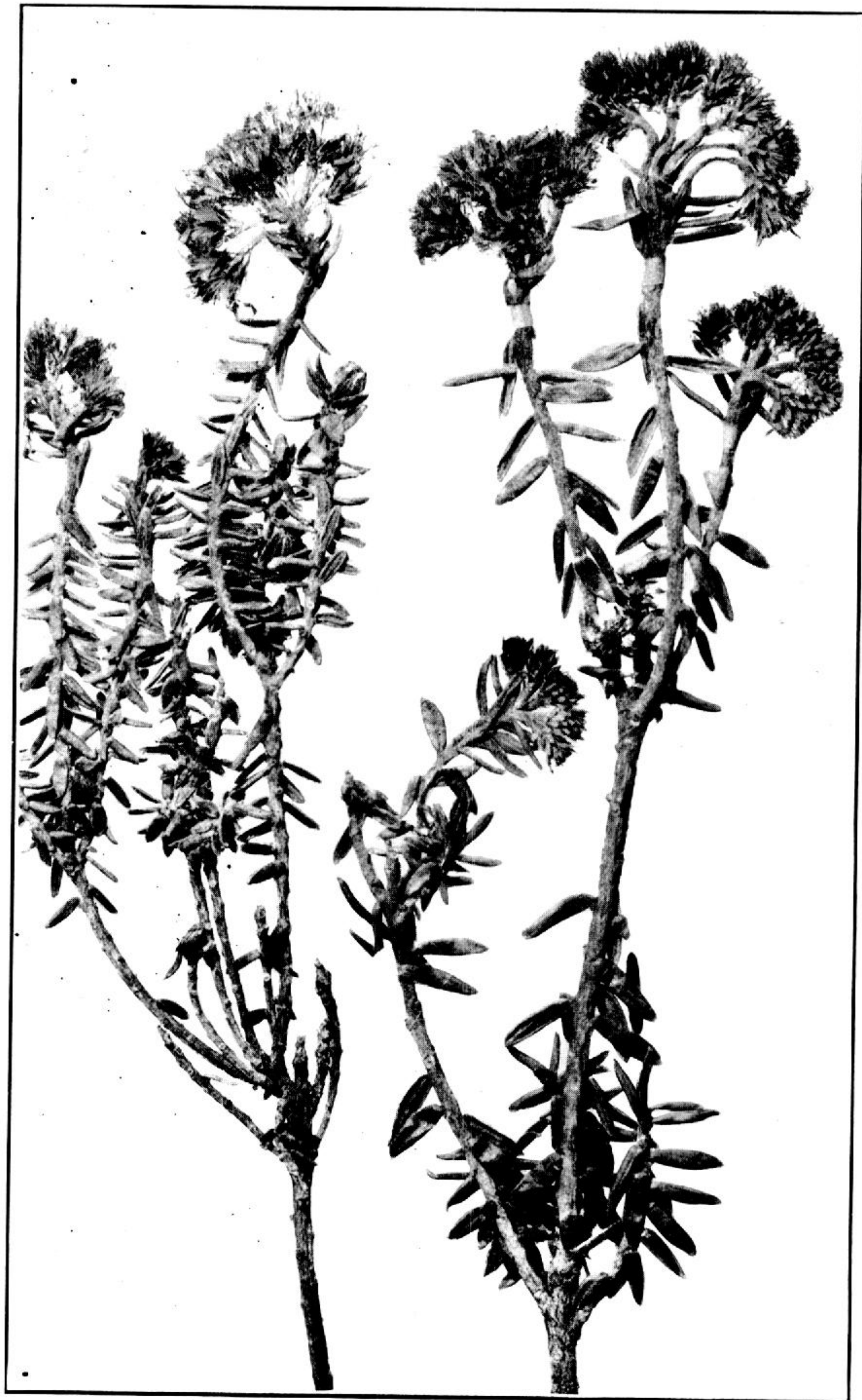
DIPLOSTEPHIUM UMBELLIFERUM BLAKE.