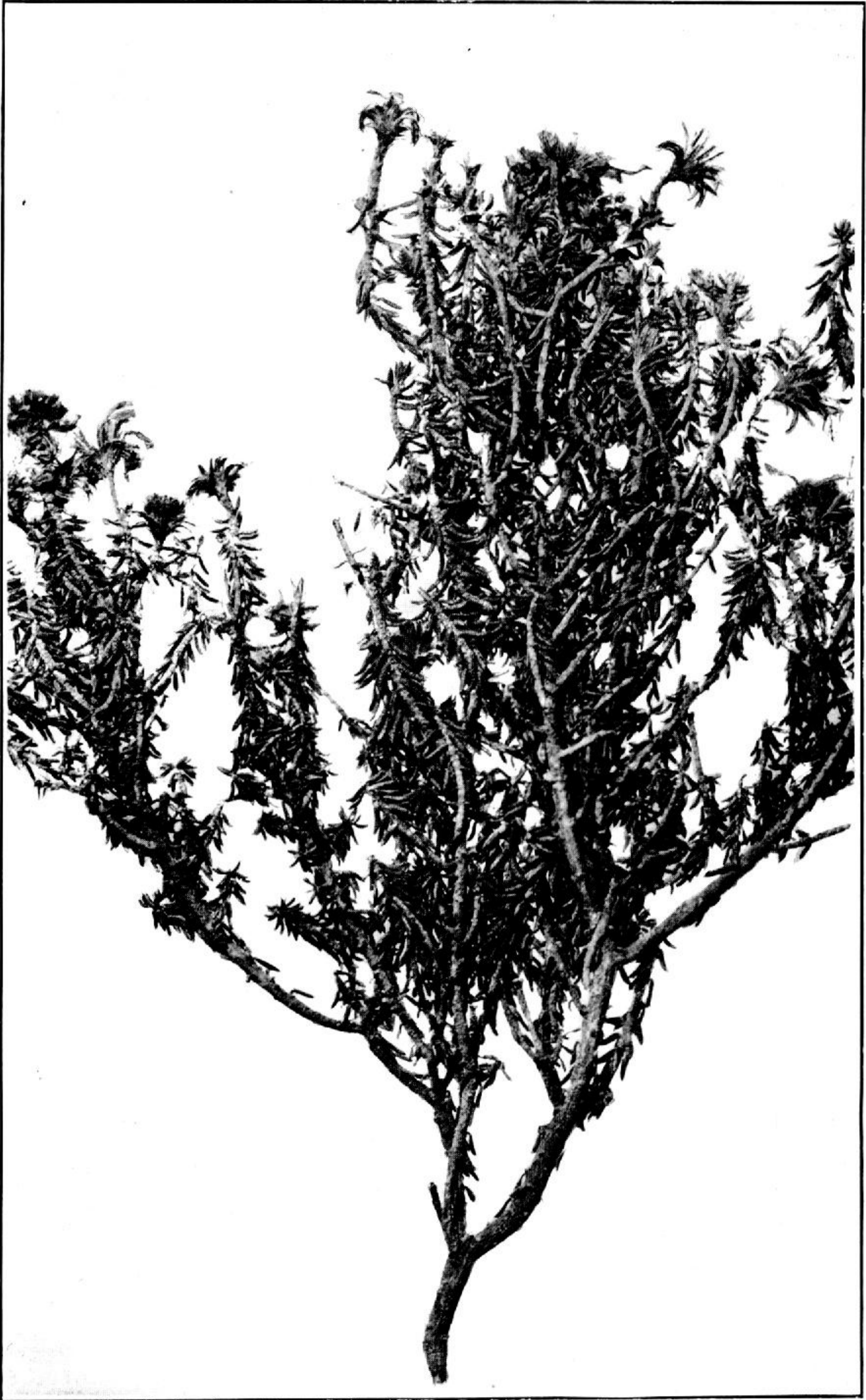
DIPLOSTEPHIUM EMPETRIFOLIUM BLAKE.