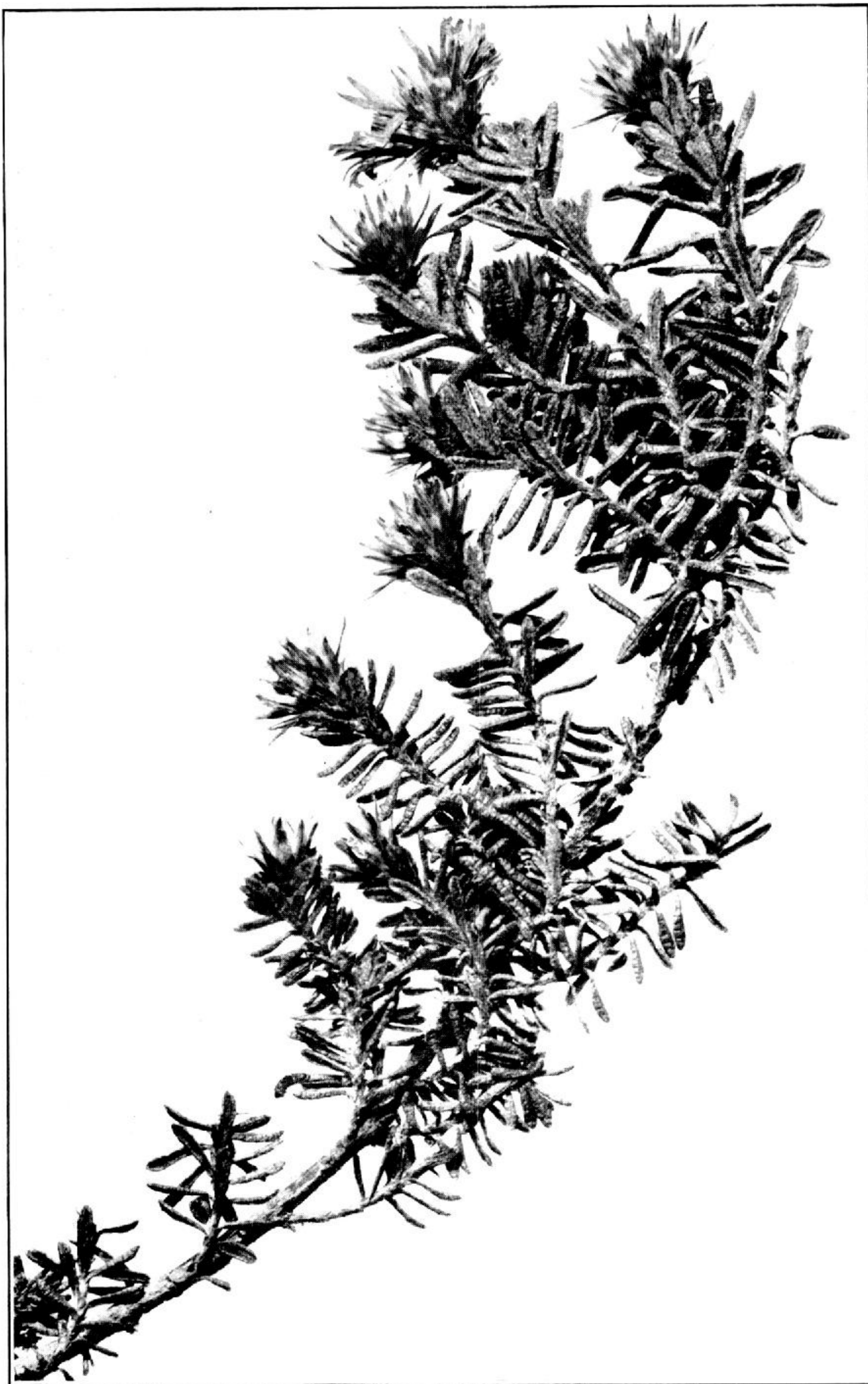
DIPLOSTEPHIUM MACROCEPHALUM BLAKE.