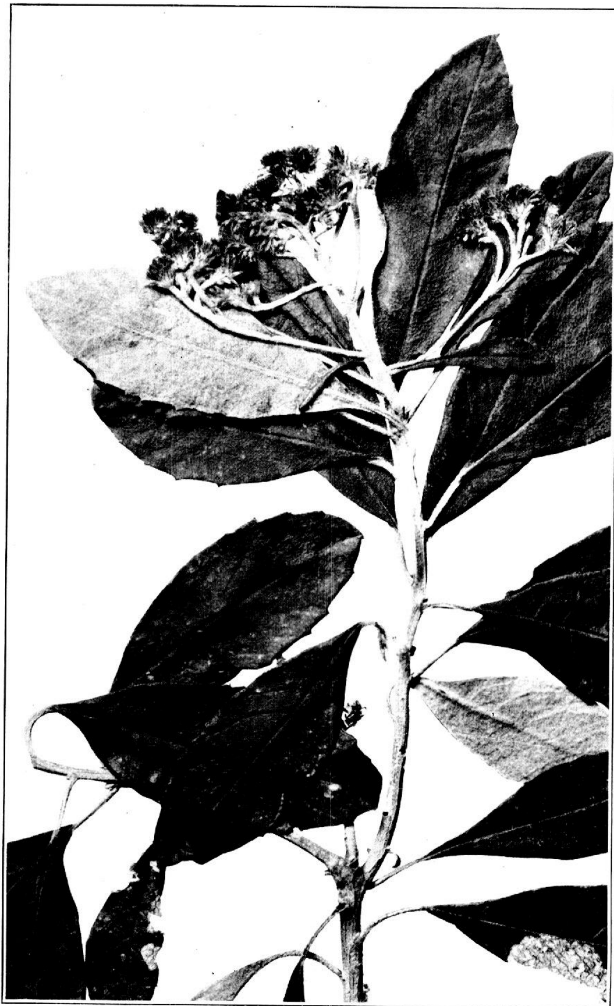
DIPLOSTEPHIUM BICOLOR BLAKE.