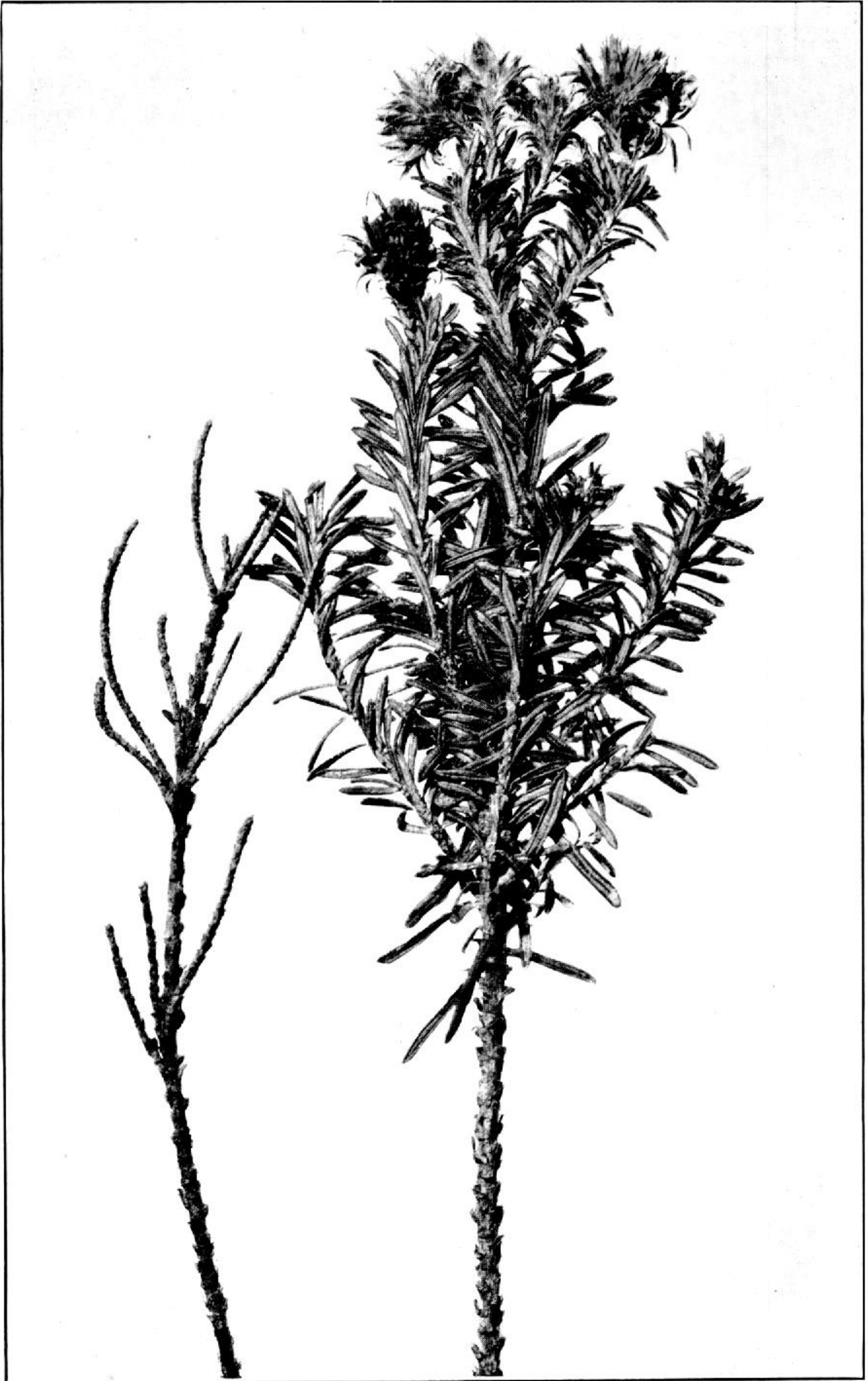
DIPLOSTEPHIUM CICATRICOSUM BLAKE.