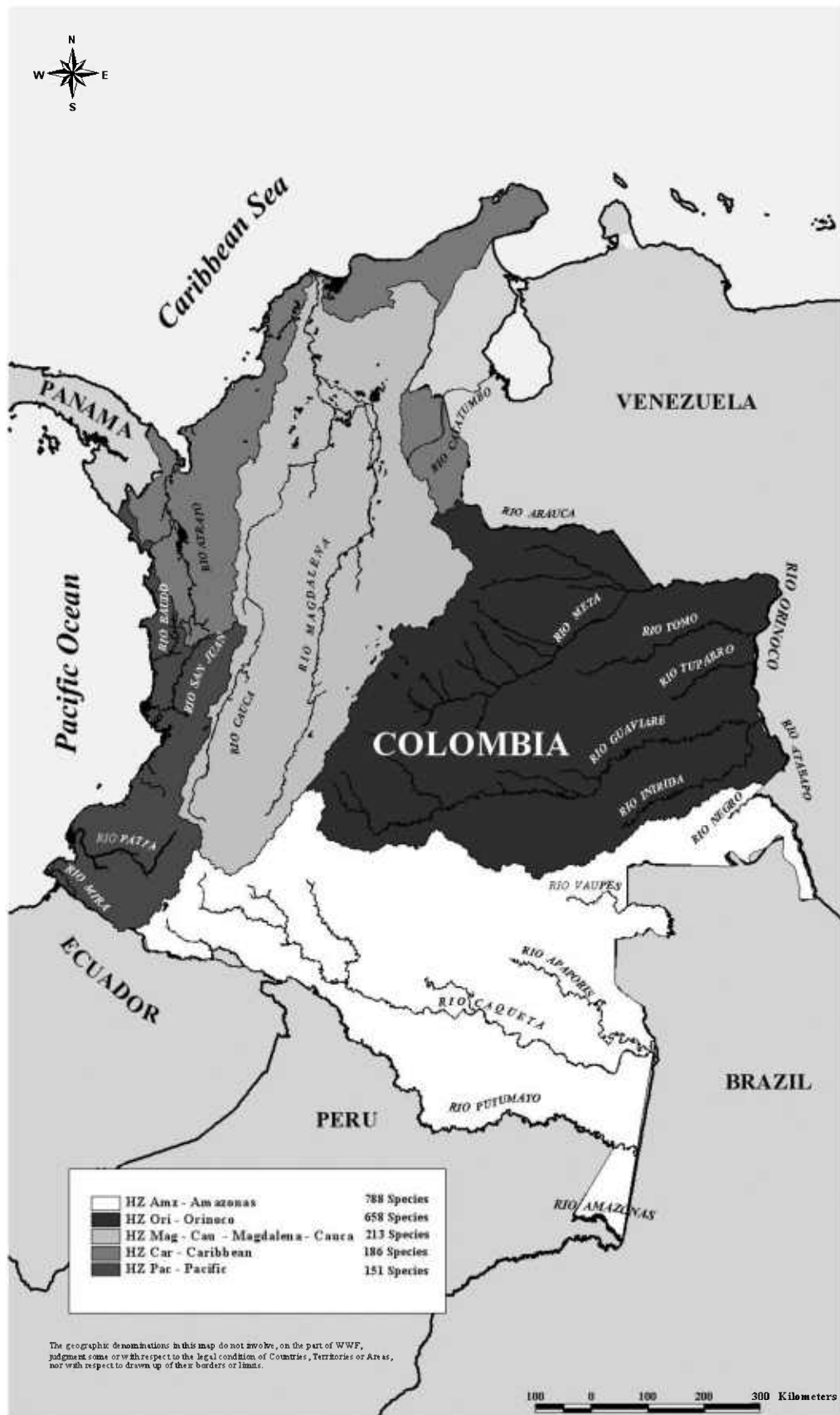
Figure 1. Map of Colombia and adjoining regions showing the hydrographic zones, river systems and species richness by HZ discussed in the Checklist.