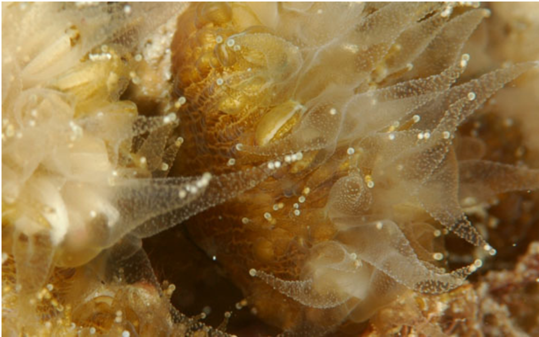
Figure 6. Eusmilia fastigiata with zygotes visible in the tentacles (Thursday 24 August 2008, 22:24).

On the 8 th night after full moon of August we observed synchronous multispecific coral spawning. At 22:15 we noted the release of sperm from only one male colony of the large star coral Montastrea cavernosa (Linnaeus, 1766) at a depth of 12 m. We also observed copious spawning of colonies of the brain coral Diploria strigosa (Dana, 1848) (Fig. 4 and 5) and of the massive star coral Montastrea faveolata in water depths of between 5 to 16 m. Spawning started at 22:00 and ended at 22:35 for Diploria strigosa and started at 22:05 and ended at 22:35 for Montastrea faveolata . Moreover, zygotes were visible at the tip of the transparent tentacles of a single colony of Eusmilia fastigiata (Pallas, 1766) (Fig. 6). The zygotes were first noticed at 22:15 and were still visible at 22:50. According to the observations made by de Graaf et al., (1999), reproductive mode of Eusmilia fastigiata resembles brooding, however, unlike other brooders, E. fastigiata did not release well-developed planulae but zygotes in early developmental stages. Furthermore, the polychaete Hermodice carunculata (Pallas, 1766) was commonly seen preying on corals. The same night we observed the swarming of a large number of polychaetous annelids including syllid polychaetes in the genus Odontosyllis (Claparède, 1863) which were observed at the surface water producing brilliant displays of green bioluminescence during mating swarms between 21:30 and 21:50.