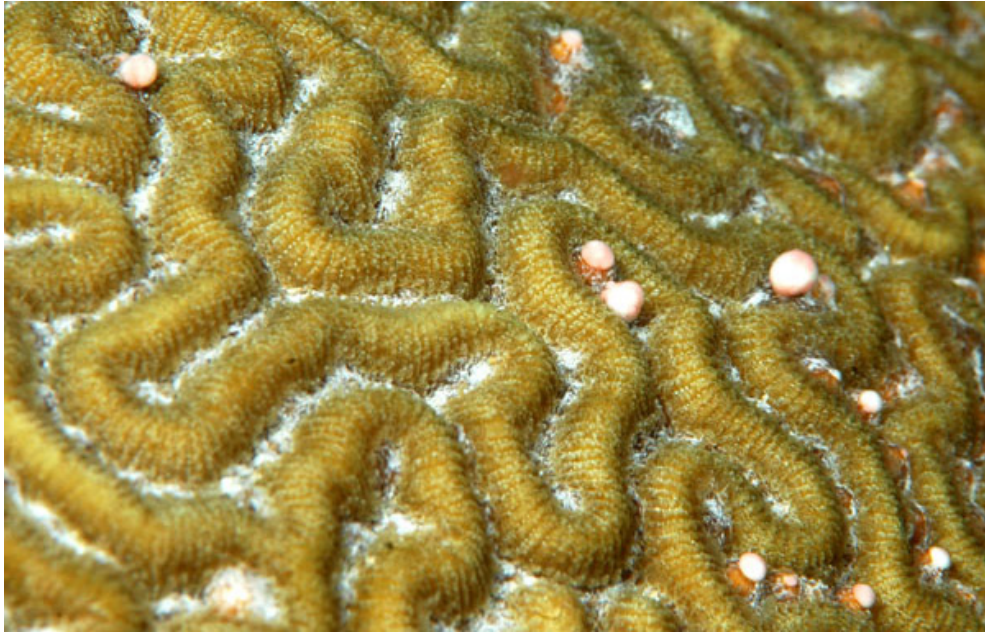
Figure 4. Mass spawning of the scleractinian coral Diploria strigosa (Thursday 24 August 2008, 22:15) (A. Goyeau).