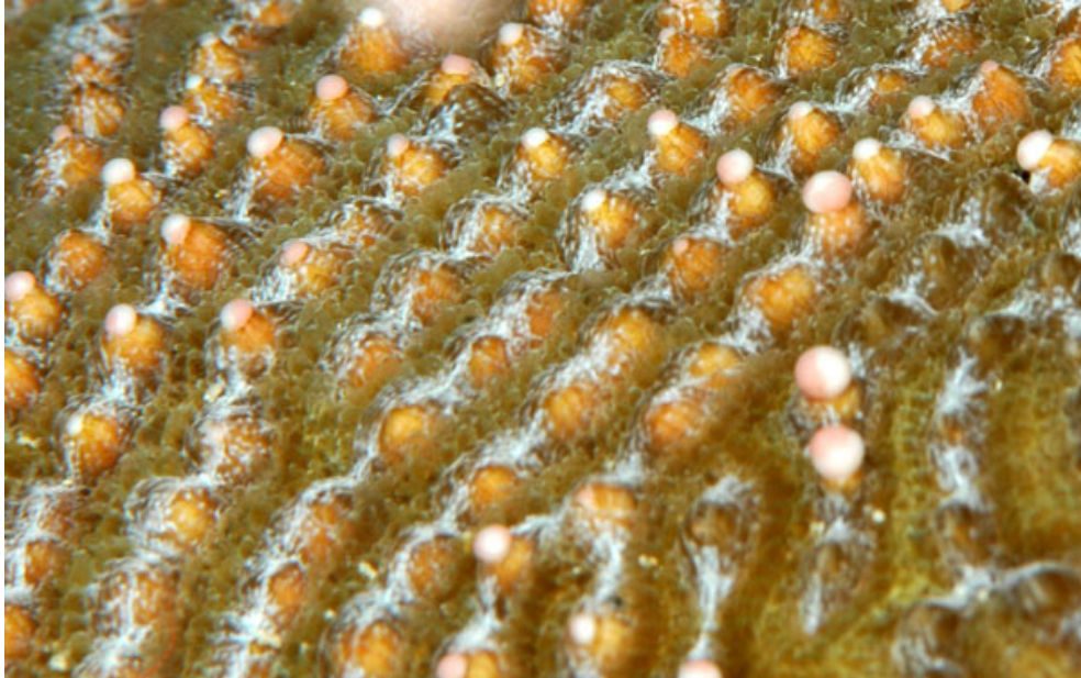
Figure 5. Diploria strigosa colony releasing egg sperm bundles at night (Thursday 24 August 2008, 22:16) (A. Goyeau).