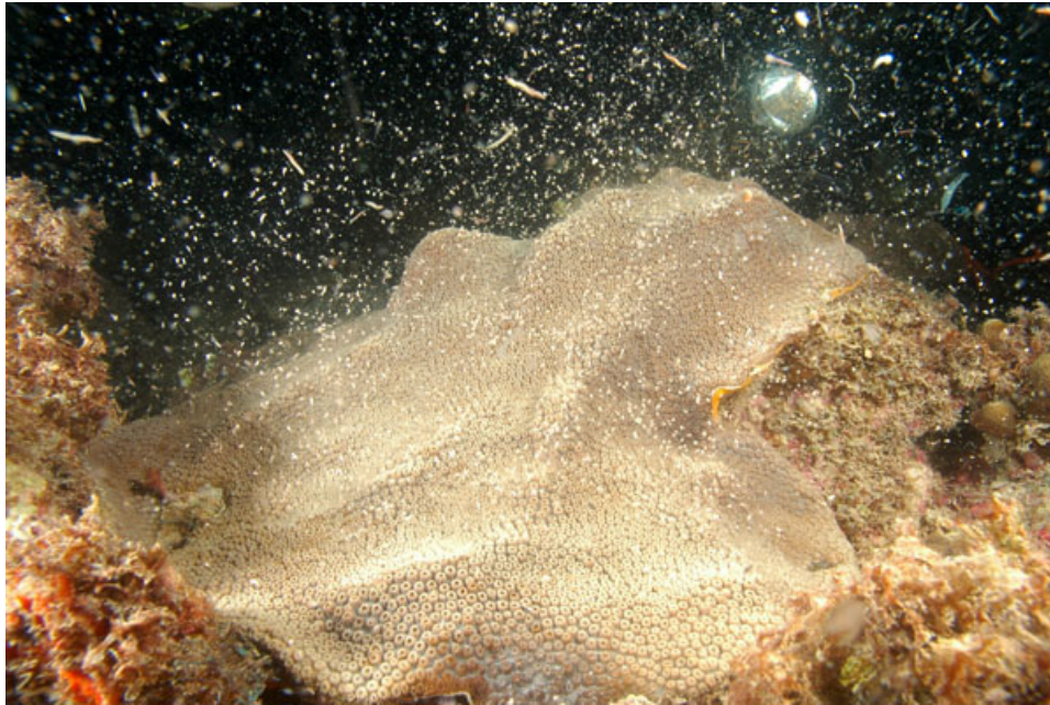
Figure 2. Mass spawning of the scleractinian coral Montastrea faveolata (Wednesday 23 August 2008, 22:28). Remark also the concomitant swarming of polychaetous annelids (A. Goyeau).