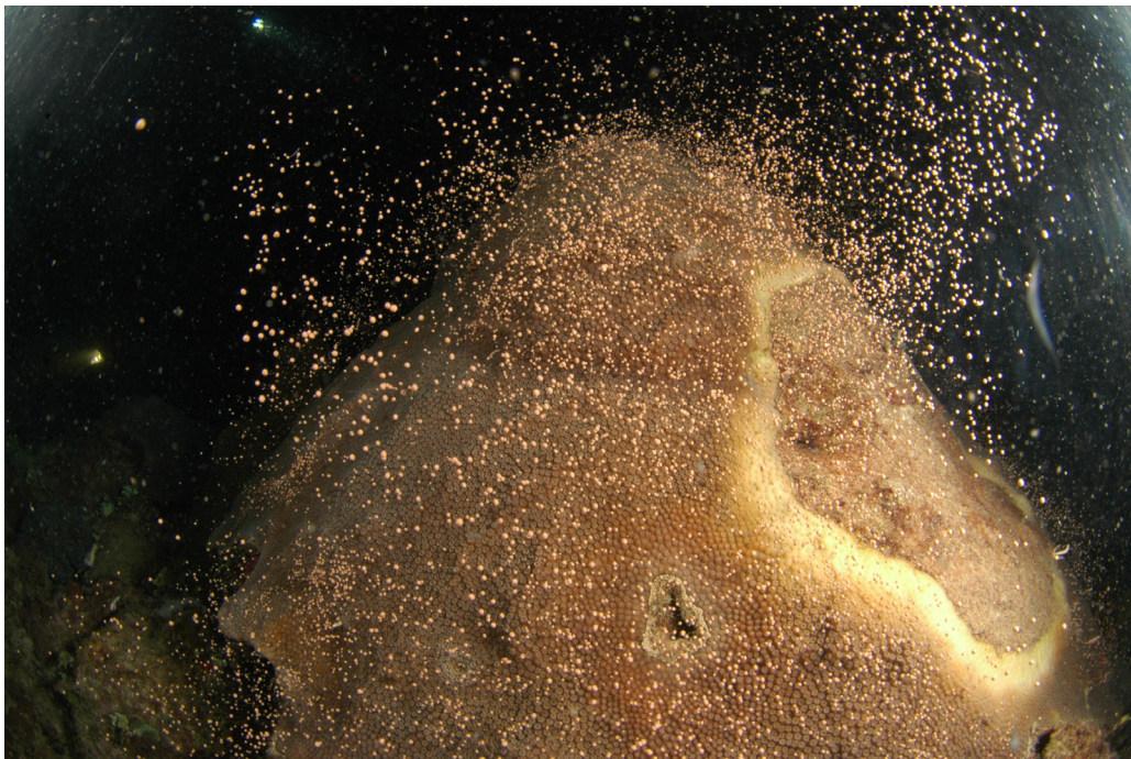
Figure. 7. Spawning of Montastrea faveolata with yellow blotch syndrome (Friday, 11 September 2009, 22.20).

We were unable to observe any reproduction of scleractinian coral 8 days after the full moon of August and 6 and 8 days after the full moon of September. We noticed copious spawning of colonies of Montastrea faveolata 7 days after the full moon of September between 21.50 and 22.25. Even colonies of Montastrea faveolata affected by yellow blotch syndrome were able to spawn in September (Fig. 7). Contrary to 2008, the September spawning event was more important than the spawning event of August.