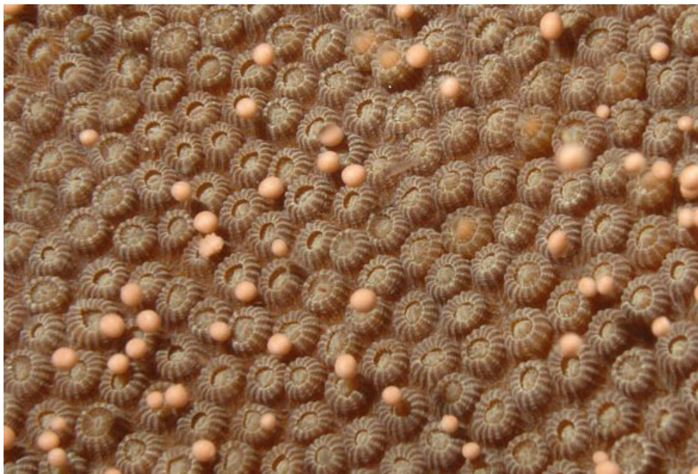
Figure 3. Montastrea faveolata colony releasing egg sperm bundles at night (Wednesday 23 August 2008, 22:08).