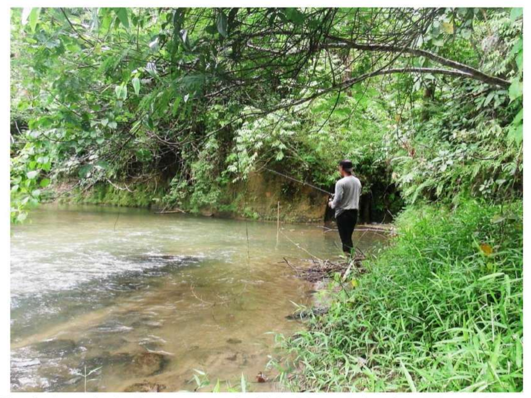
Figure 2. Blungun River, location where R. guttatus found in South Sumatra Province.