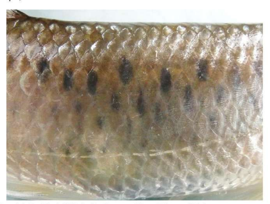
Figure 5. Spots in body of live individual of the R. guttatus (Photo: Muhammad Iqbal).