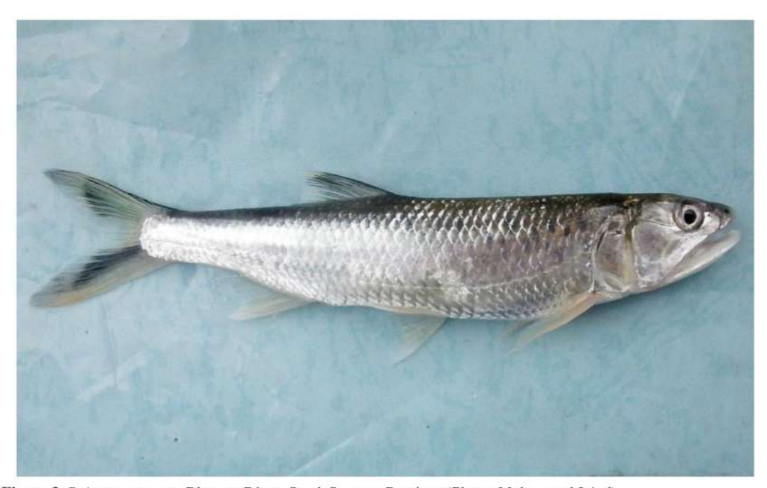
Figure 3. Raiamas guttatus, Blungun River, South Sumatra Province.