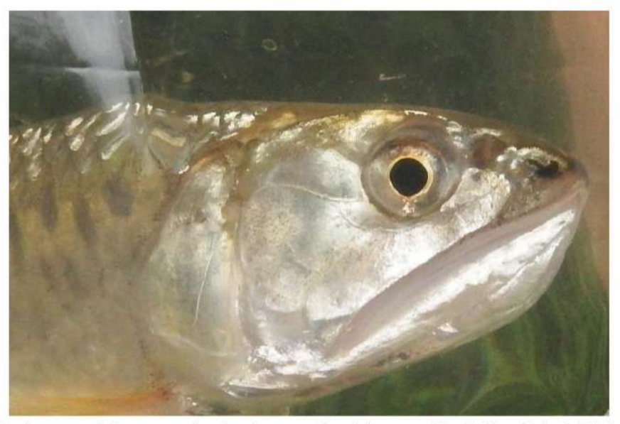
Figure 4. Head pattern of R. guttatus showing large mouth and jaw extending backwards far behind eye (Photo: Muhammad Iqbal).