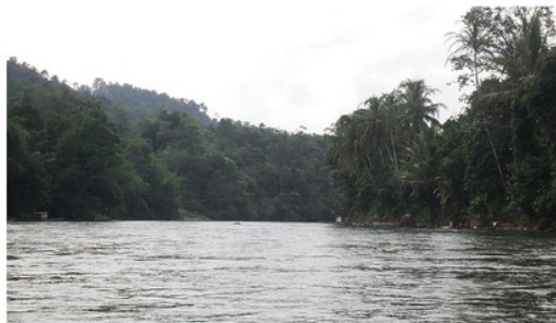
Figure 2. Muara Kulam River (Musi basin, South Sumatra), showing the location where Crossocheilus obscurus was collected.

This river is surrounded by secondary dipterocarp forest. There is little encroachment, except for illegal low intensity selective-logging by local people (Fig. 2). The collection site is at around 500 m elevation, and the surrounding topography is hilly. This area is under management area of Subsection V or SPTN V (SPTN = Seksi Pengelolaan Taman Nasional Wilayah, or Regional Park Management Section) of Kerinci Seblat National Park (Anonymous 2016).