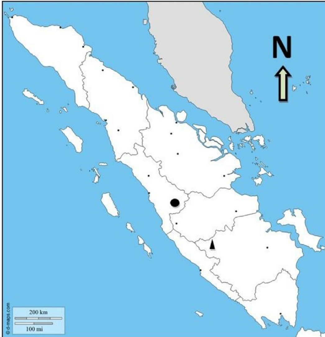
Figure 1. Known distribution of Crossocheilus obscurus . Black circle = type locality in the Batang Hari basin (West Sumatra); black triangle = additional locality at the Musi basin (South Sumatra).

basin, 02°48'10.6" S, 102°21'11.2" E). The fishes were documented and photographed, although the specimens were not retained, as we did not have the requisite permit for collecting specimens in the national park.