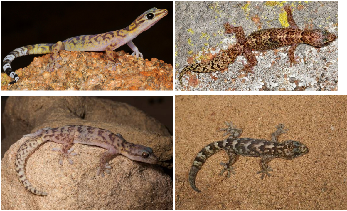
Fig. 4. Regional variation in colouration and habitus of Afroedura bogerti from Angola Top left: Omauha Lodge, Namibe Province. Top Right: 52 km N Caraculo, Namibe Province. Bottom Left: Praia do Meva, Benguela Province. Bottom Right: Candumbo Rocks, Huambo Province.