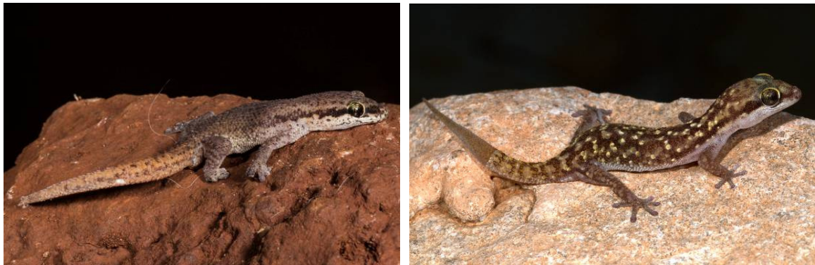
Fig. 6. Regional variation in colouration of Pachydactylus angolensis from Angola.

Left: P. angolensis – inland form (Serra de Tchivira: photo P. Vaz Pinto). Right: P. angolensis – coastal form (Chimalavera National Park: photo WR Branch).