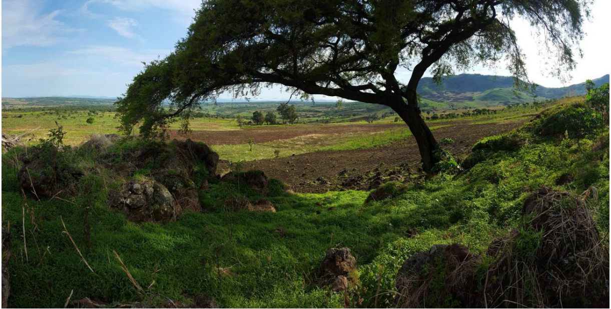
Fig. 2. The ruins of farm Monte Verde, surrounded by Eucalyptus trees (middle distance), overlay those of William Chapman's farm Monte Victoria-Verdun. Viewed from an intrusive rock outcrop on the lower western slopes of Sandula Hill.