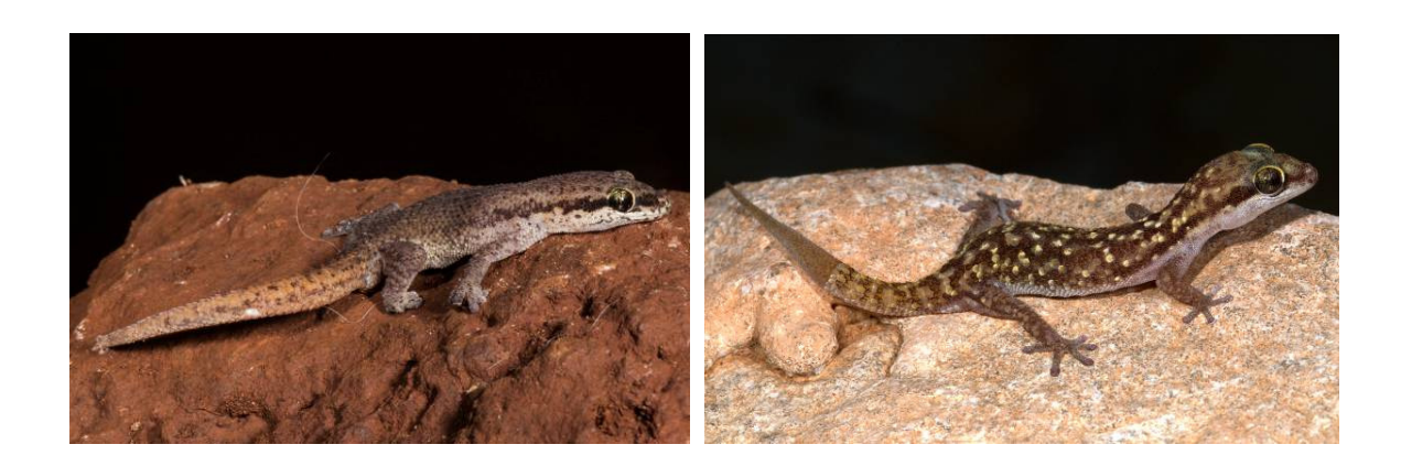
Fig. 6. Regional variation in colouration of Pachydactylus angolensis from Angola. Left: P. angolensis – inland form (Serra de Tchivira). Right: P. angolensis – coastal form (Chimalavera National Park).