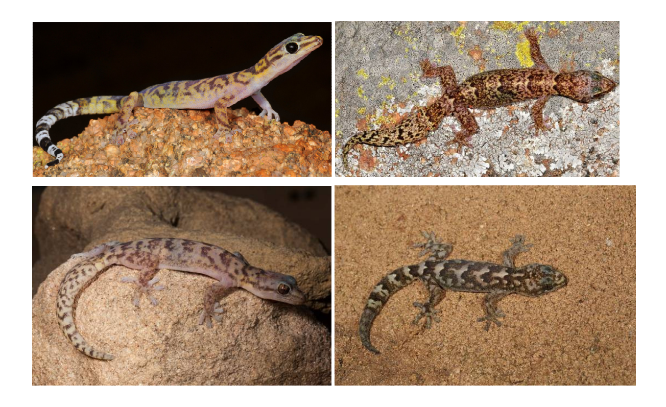
Fig. 4. Regional variation in colouration and habitus of Afroedura bogerti from Angola Top left : Omauha Lodge, Namibe Province. Top Right : 52 km N Caraculo, Namibe Province. Bottom Left : Praia do Meva, Benguela Province. Bottom Right : Candumbo Rocks, Huambo Province.