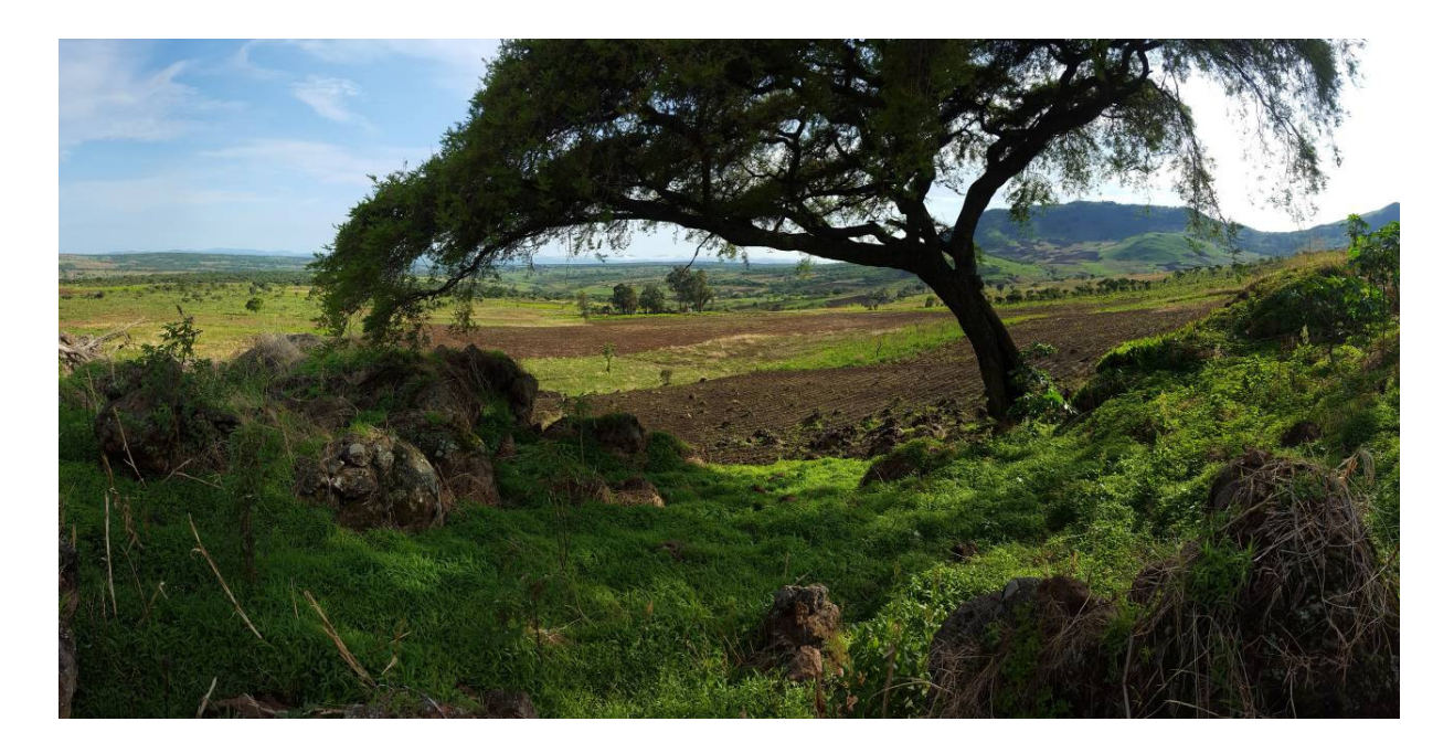
Fig. 2. The ruins of farm Monte Verde, surrounded by Eucalyptus trees (middle distance), overlay those of William Chapman's farm Monte Victoria-Verdun. Viewed from an intrusive rock outcrop on the lower western slopes of Sandula Hill.