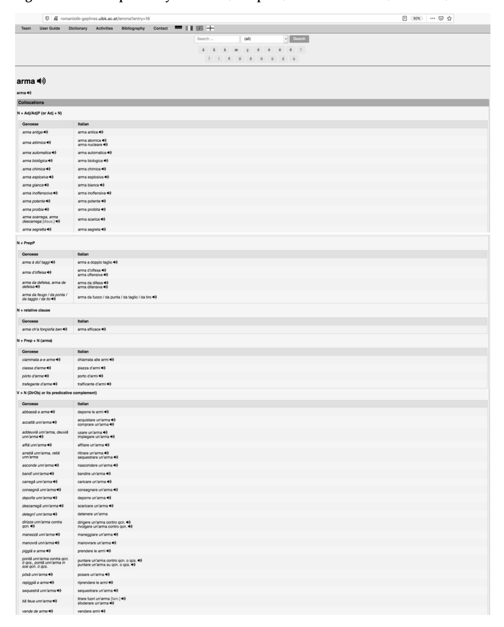
Figure 7. The sample entry of arma ('weapon') in Autelli et al. (2018–2021)

A simplified entry will be given in order to give a concrete example (based the lemma arma , 'weapon'):