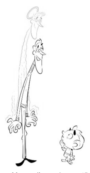
Figure 10. Anima longa (= lit. 'soul long', which actually means 'beanpole')