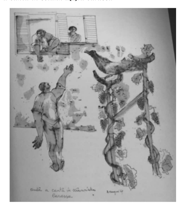
Figure 8. Andâ a cantâ in sciûnn'a[t]ra carassa

Only a few Genoese dictionaries provide images (e.g. Schmucker 1981, mainly for children), and these often show the meaning of only one word. If word combinations accompany images, usually only the figurative or the literal meaning is given. Drawings of phrasemes are more often found in booklets or collections of sayings, such as in Ferrando / Ferrando 1979, where both literal and figurative meaning is given, which is quite rare: