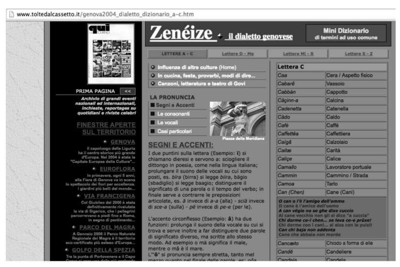
Figure 1. Entries in the small online Genoese-Italian dictionary Tolte dal Cassetto 2004