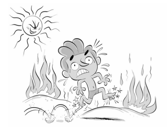
Figure 9. \tilde{E} na affogâ (= lit. 'sand on fire', which actually means 'hot sand')