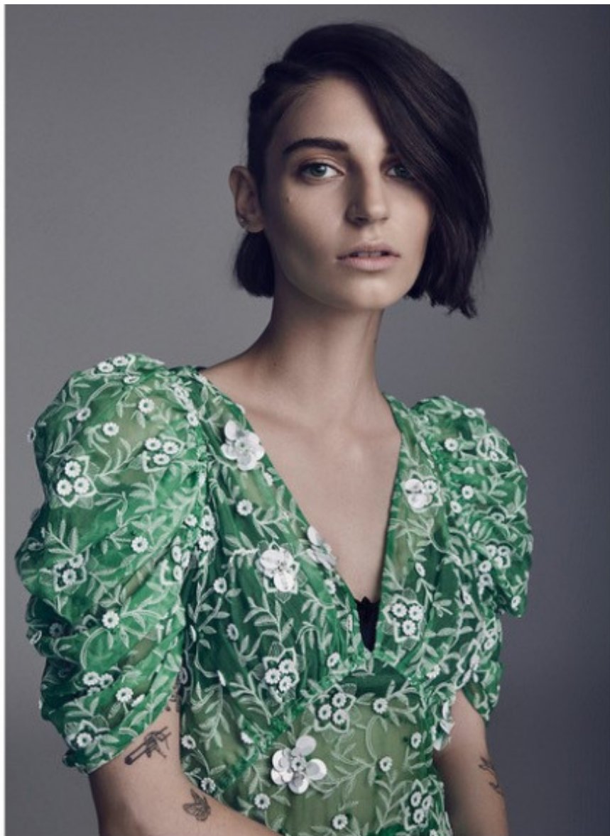
Платье, Prada; брас, Dolce&Gabbana; серьги, собственность модели