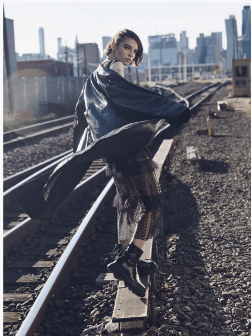
Кружевная юбка, кружевной топ – все Viberry; пальто, Loewe; ботинки, DKNY