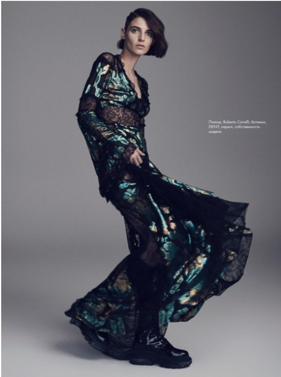
Платье, Roberto Cavalli; ботинки, DKNY; серьги, собственность модели