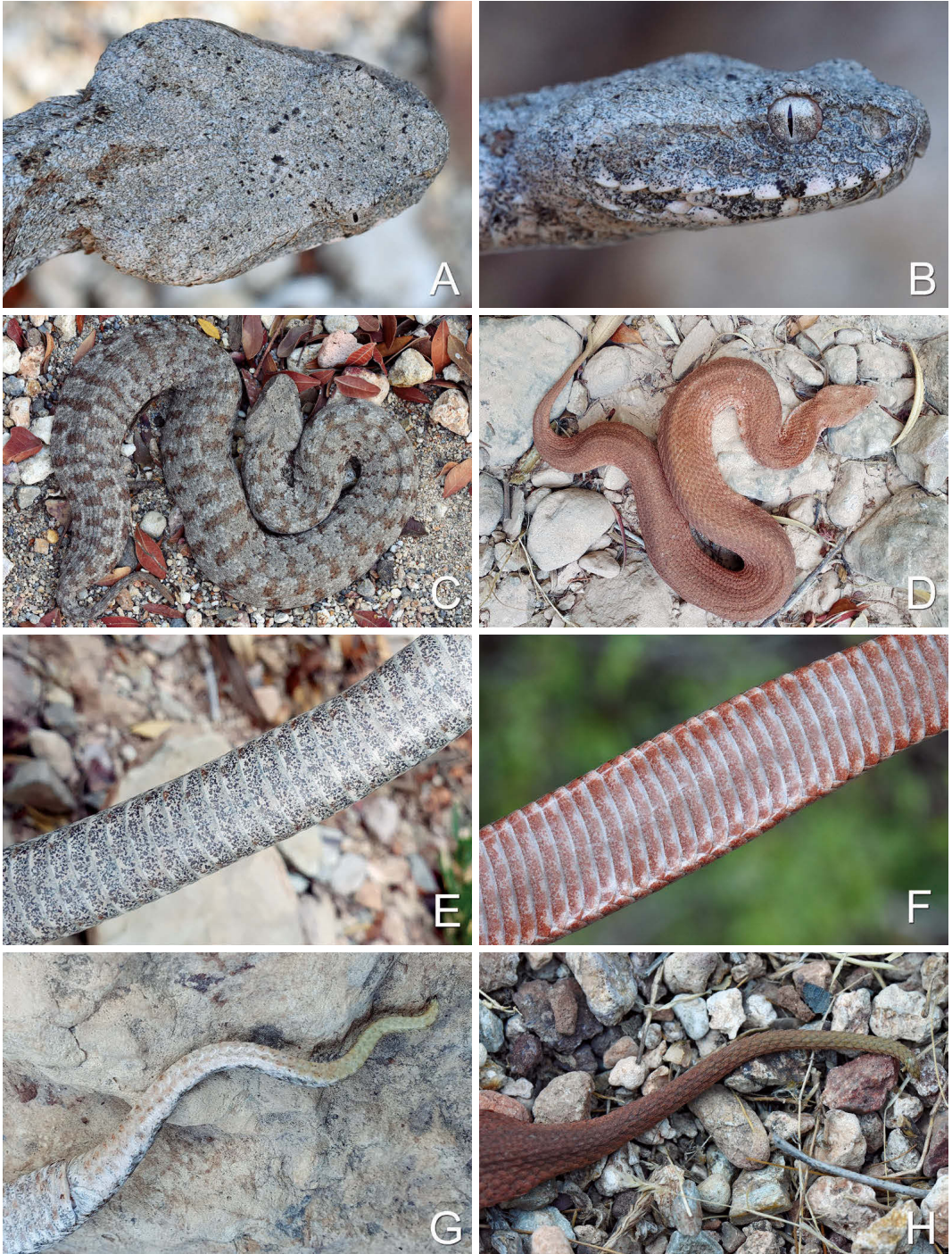
Fig. 2. Macrovipera schweizeri details: A. Head in dorsal view; B. head profile; C. dorsal colouration in a standard individual; D. dorsal colouration in a reddish individual; E. ventral colouration in a standard individual; F. ventral colouration in a reddish individual; G. tail colouration (ventral) in a standard individual; H. tail colouration (dorsal) in a reddish individual.