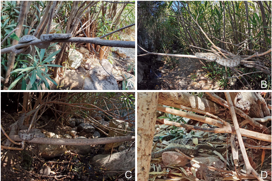
Fig. 4. Macrovipera schweizeri individuals observed “in situ” near the residual pool during the day.

The first record is from the 24 th of September, at 8:58 h (sunny weather, T=19^{\circ}\text{C} , wind = 17 km/h). An individual with uniform, reddish colouration, likely a female (TL = ~50 cm), was observed moving among the stones of a completely dry seasonal stream bed (approx. coordinates: 36.66, 24.40; elev. 67 m a. s. l.) (Fig. 2D). In the stretch of stream visited there was no residual water, and the only other vertebrates encountered in activity were Kotschy’s geckos ( Mediodactylus kotschyi , n=2 ) and Milos wall lizards ( Podarcis milensis , n=5 ).