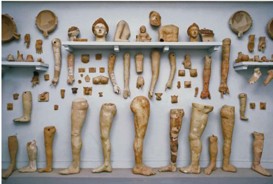
Clay votive offerings of parts of the body

Body parts made out of clay were given as gifts to the gods by Greek people. We think that they were given to ask for help with healing. For example if you had earache you might offer a clay ear. They were given particularly to Asclepius who was the god of healing and medicine. Some of these offerings might also have been given as thanks for getting better.