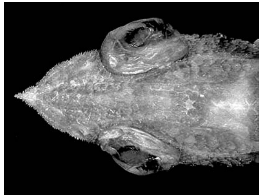
FIGURE 2. Caelorinchus vityazae sp. nov. Dorsal view of head of paratype (CAS 66494, 54.8 mm HL), showing shape of snout and details of terminal scute.