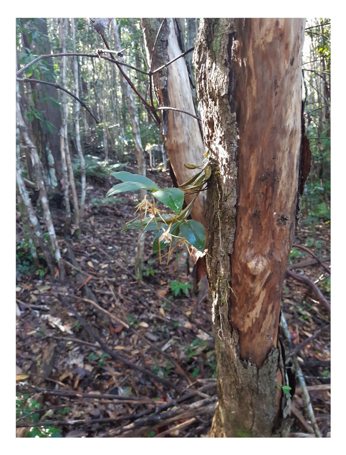
Fig. 2. Thelychiton melaleucaphilus attached to tree (likely Gossia hillii) killed by repeated myrtle rust infection.

by 100–500 m, highlighting the potential impact of fragmentation on pollinator effectiveness, even over hundreds of metres. Epiphytic orchid species with hosts including both myrtaceous and non-myrtaceous species are theoretically at an advantage, as they can escape the myrtle rust threat by shifting to non-myrtaceous hosts. However, the potential impact of competition for the habitat on non-myrtaceous host trees, especially from epiphytic species already occupying these habitats, may be limiting. Moreover, surrounding environment, including habitat fragmentation, cohesion and edge length can influence the composition of orchid communities, through impacts on resource availability, including for pollinators, fungal symbionts, as well as for light and water (Martín-Forés et al. 2022). The impact of global change is also hypothesised to be severe for orchids, both directly, impacting their growth, flowering, and survival, and indirectly, through impacts on fungal symbionts, pollinators, and habitat (Gale et al. 2018) which includes impacts on host tree ranges, phenology and/or survival (Thuiller et al. 2008).