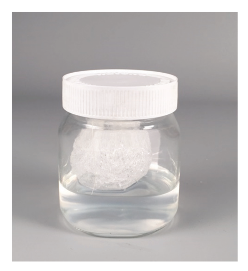
Fig. 2. Bag just touching acetone

Leave the jar alone until the resin is totally dissolved (usually six to eight hours), preferably overnight. Once it is completely dissolved, remove the cheesecloth bag, stir with a glass stirring rod to homogenize the mixture, and pour into aluminum adhesive tubes. No further evaporation is necessary (fig. 3).