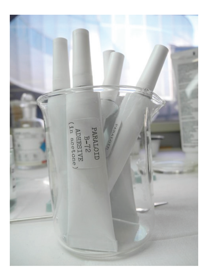
Fig. 6. Finished tubes