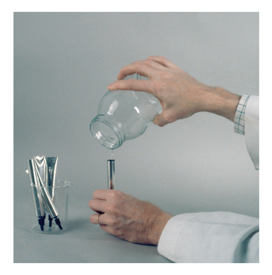
Fig. 4. Pouring into tubes