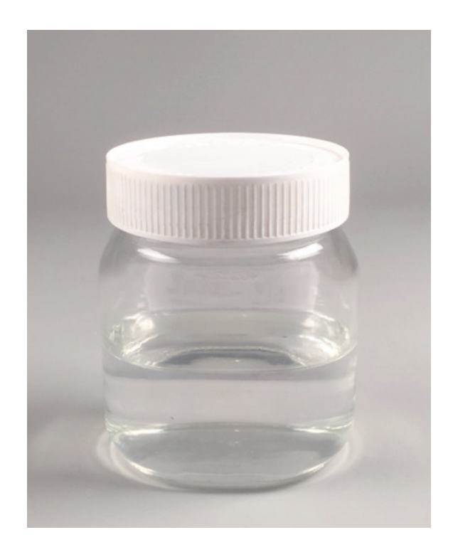
Fig. 3. All dissolved