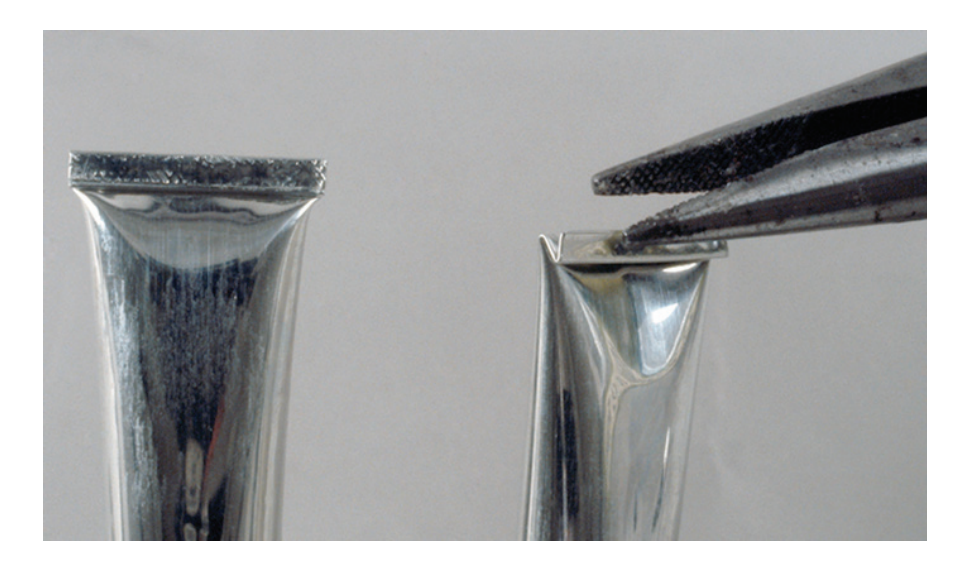
Fig. 5. Crimping ends of tubes with pliers