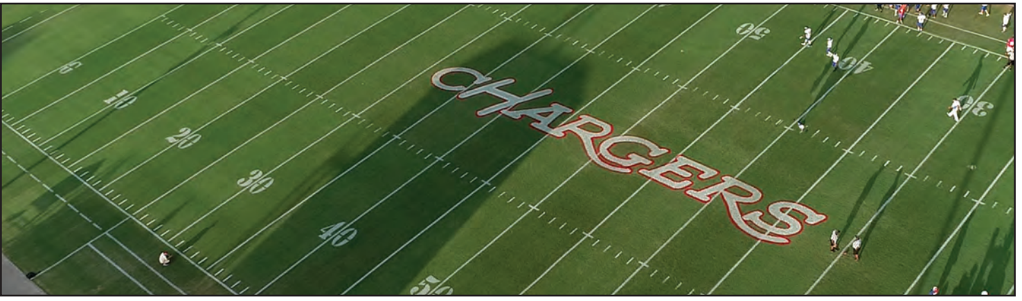
By Jamie Kornegay GSD Reporter

Summer football practice looked a lot different this year. Instead of a hundred-plus kids suiting up to play, small groups of 20-30 kids met to train and run drills. No more huddles of sideline players. Anyone not playing stood six feet apart, wearing facial coverings. No more congregations around the water cooler. Athletes drank from individual bottles. The water cooler was replaced by a sanitation station.