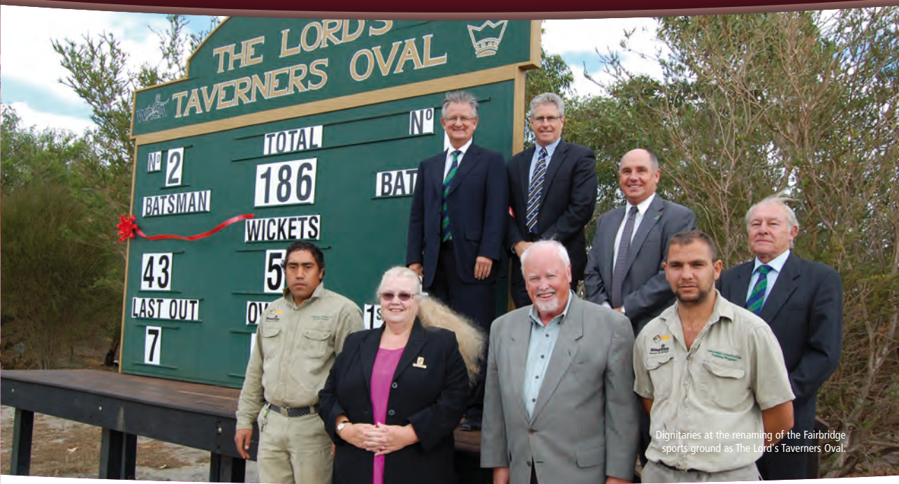
Dignitaries at the renaming of the Fairbridge sports ground as The Lord's Taverners Oval.