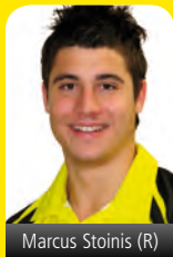
Marcus Stoinis (R)