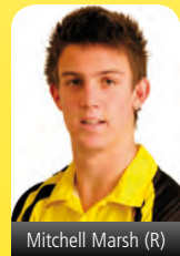
Mitchell Marsh (R)