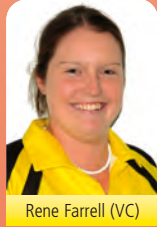
Rene Farrell (VC)