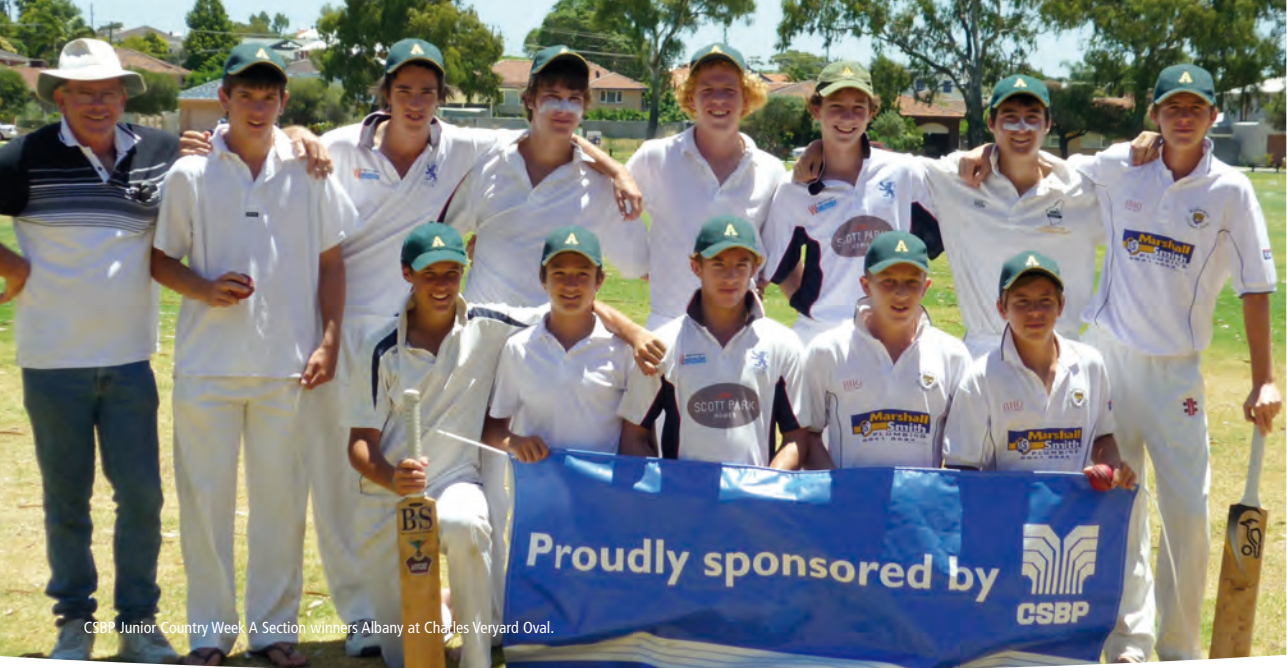
CSBP Junior Country Week A Section winners Albany at Charles Verrard Oval.