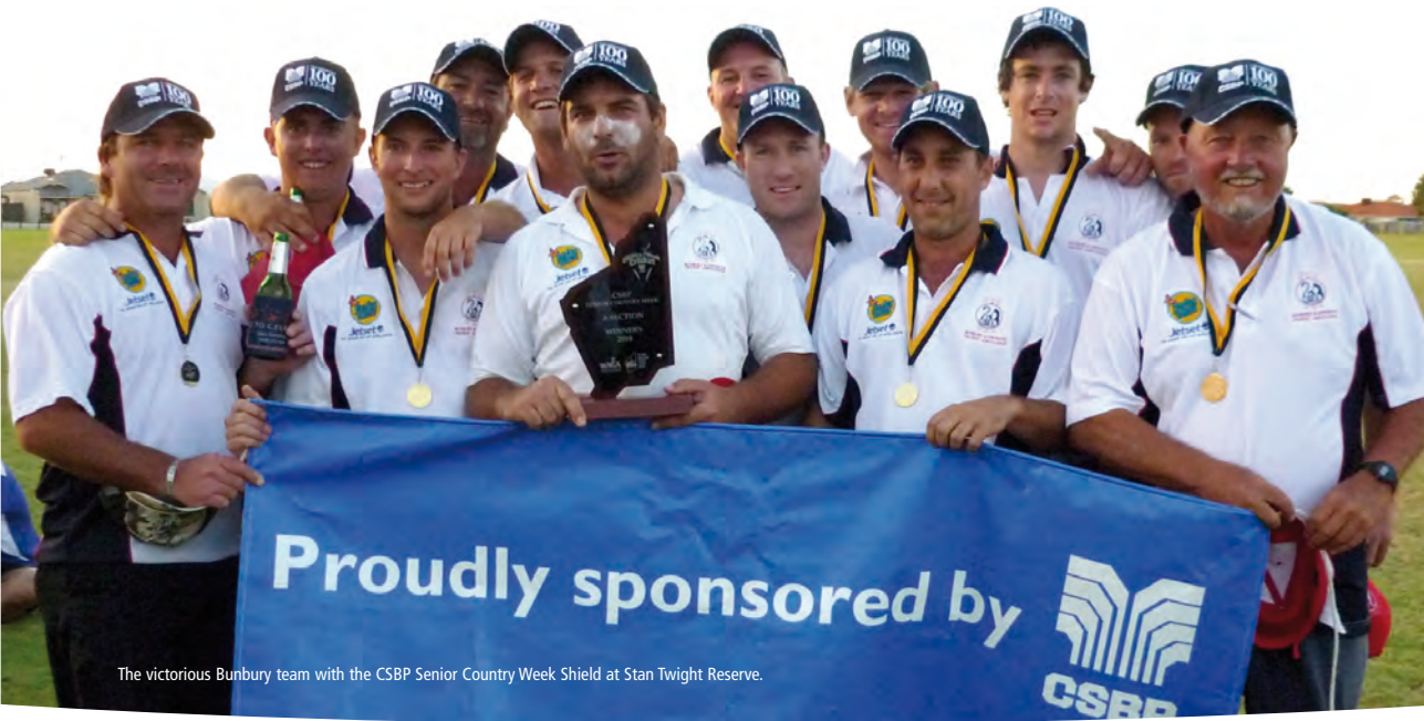
The victorious Bunbury team with the CSBP Senior Country Week Shield at Stan Twight Reserve.