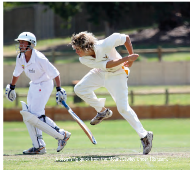
A promising quick from the Mount Lawley Under 16s team.