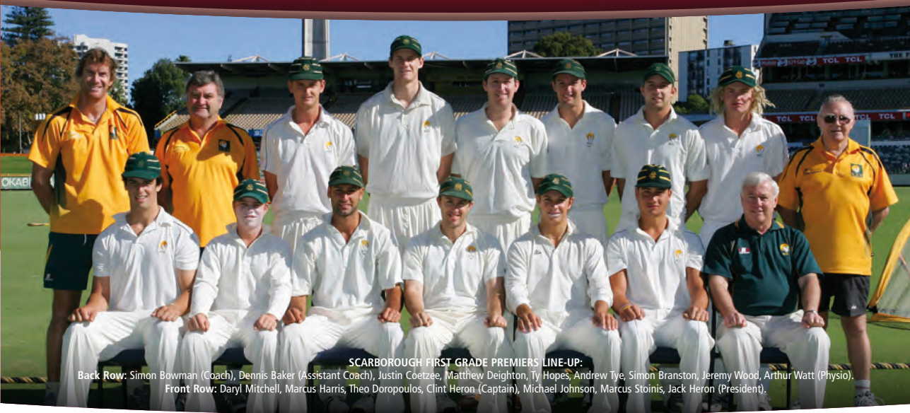
SCARBOROUGH FIRST GRADE PREMIERS LINE-UP: