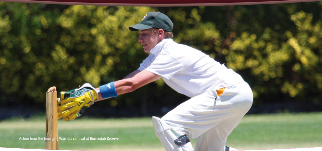
Action from the Emerging Warriors carnival at Burrendah Reserve.