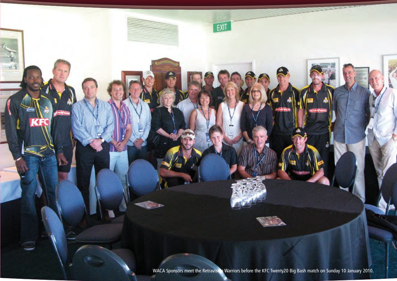
WACA Sponsors meet the Retravision Warriors before the KFC Twenty20 Big Bash match on Sunday 10 January 2010.

W e believe that our product, Western Australian cricket, offers a unique investment opportunity for companies. We view all of our sponsors as partners of the game, with the 'team behind the team' mentality. With plenty of on-field action in season 2009-10, sponsor activities off-field also increased.