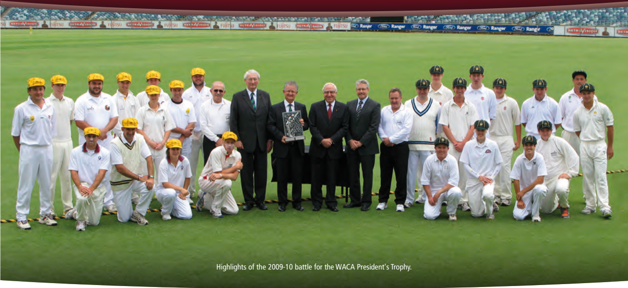
Highlights of the 2009-10 battle for the WACA President's Trophy.