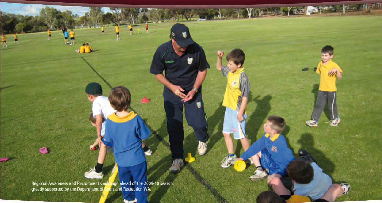
Regional Awareness and Recruitment Campaign ahead of the 2009-10 season, greatly supported by the Department of Sport and Recreation WA.

M any individual volunteers, institutions, Government Departments or Agencies, and commercial entities assist WACA operations and the development of cricket in Western Australia. The following pages, along with references in Sponsorship and District Cricket reporting in The Western Cricketer , acknowledge a wide range of outstanding and valued contributions to the WACA during the past year.