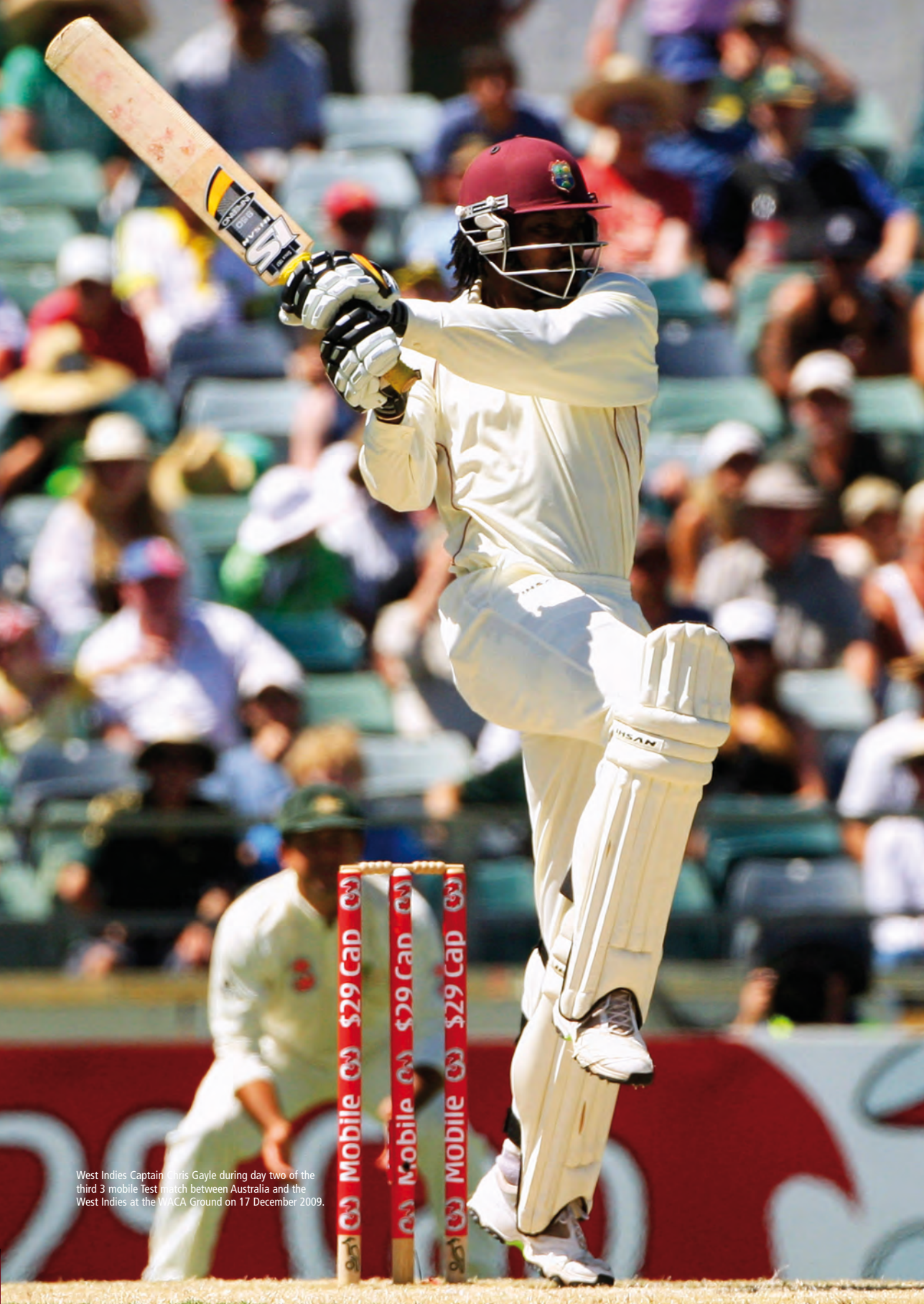
West Indies Captain Chris Gayle during day two of the third 3 mobile Test match between Australia and the West Indies at the WACA Ground on 17 December 2009.