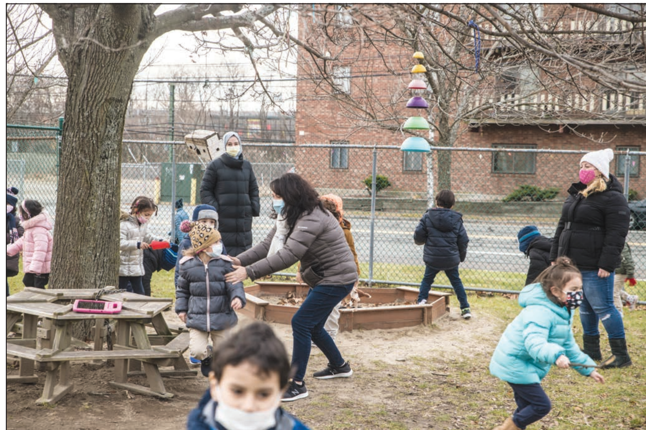
Students at the Beachmont School play before the dedication of the board.