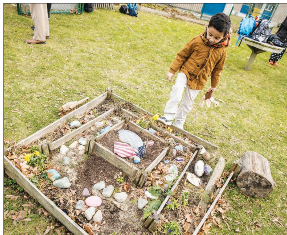
A Beachmont School student surveys the playground's rock garden.