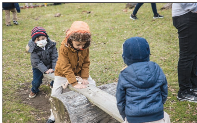
Students at the Beachmont School play.