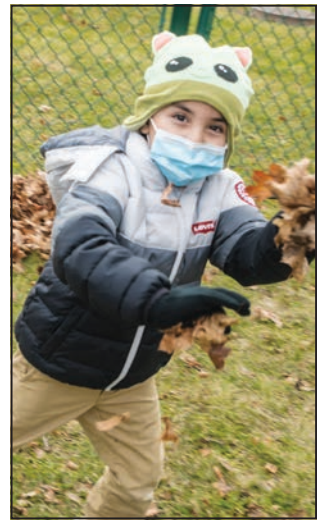
Students at the Beachmont School play before the dedication of the board.

On Wednesday, Dec. 15, students and parents joined teachers and staff at the Beachmont School as well as elected officials for the dedication of the new Playground Communication Board outside of the Beachmont School.