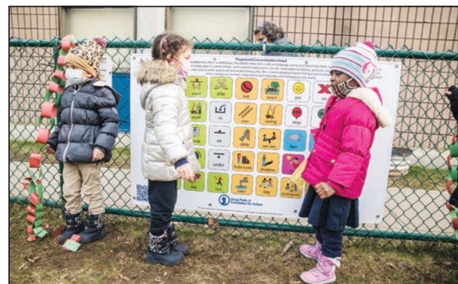
Beachmont School students examine the Playground Communication Board.