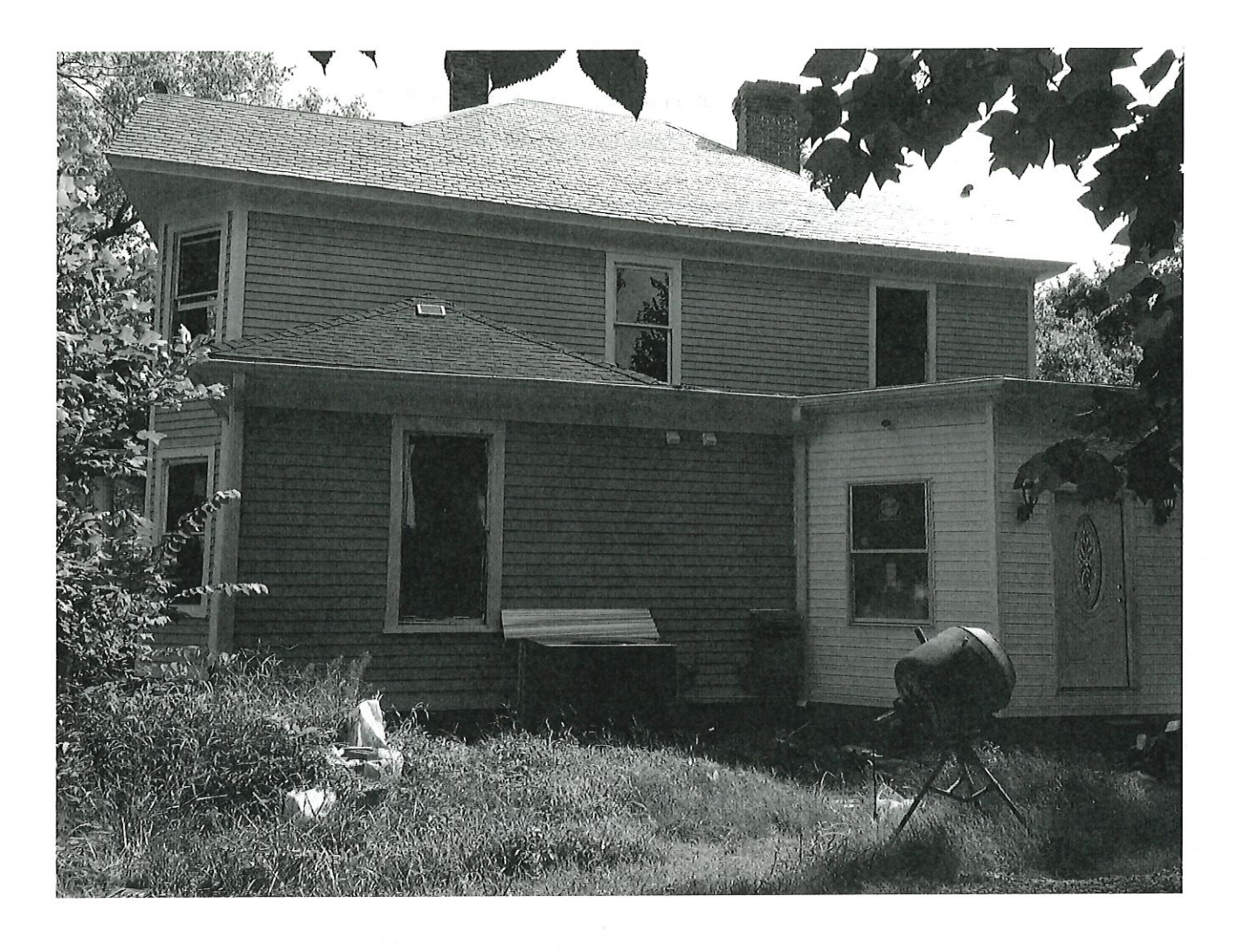
Figure 4: Rear elevation of William A Curtis House (Other Name: Villa Florenza). 1415 Poole Rd, Raleigh, NC 27610. in July 2017.