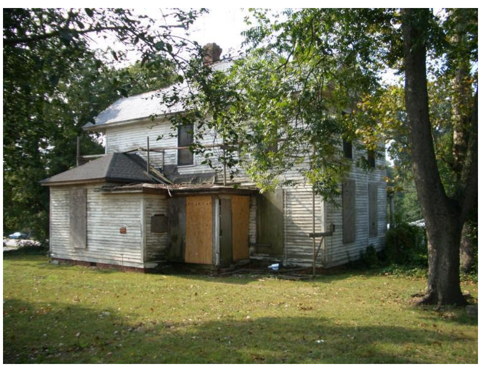
Overall rear view