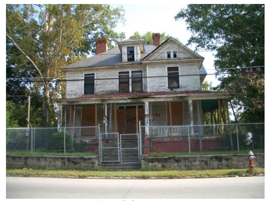
Overall front view