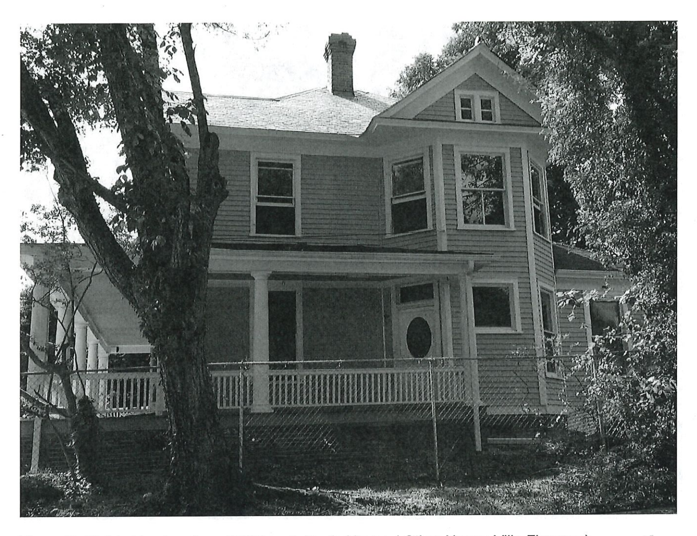
Figure 2: Right side elevation of William A Curtis House (Other Name: Villa Florenza). 1415 Poole Rd, Raleigh, NC 27610. Photo by Xin Rui Xia in July 2017.