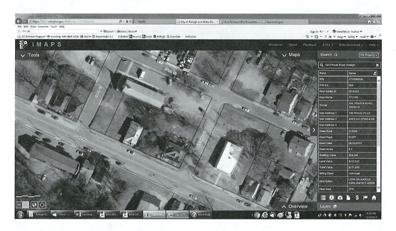
Figure 5. Boundary Map of William A Curtis House (Other Name: Villa Florenza). 1415 Poole Rd, Raleigh, NC 27610.