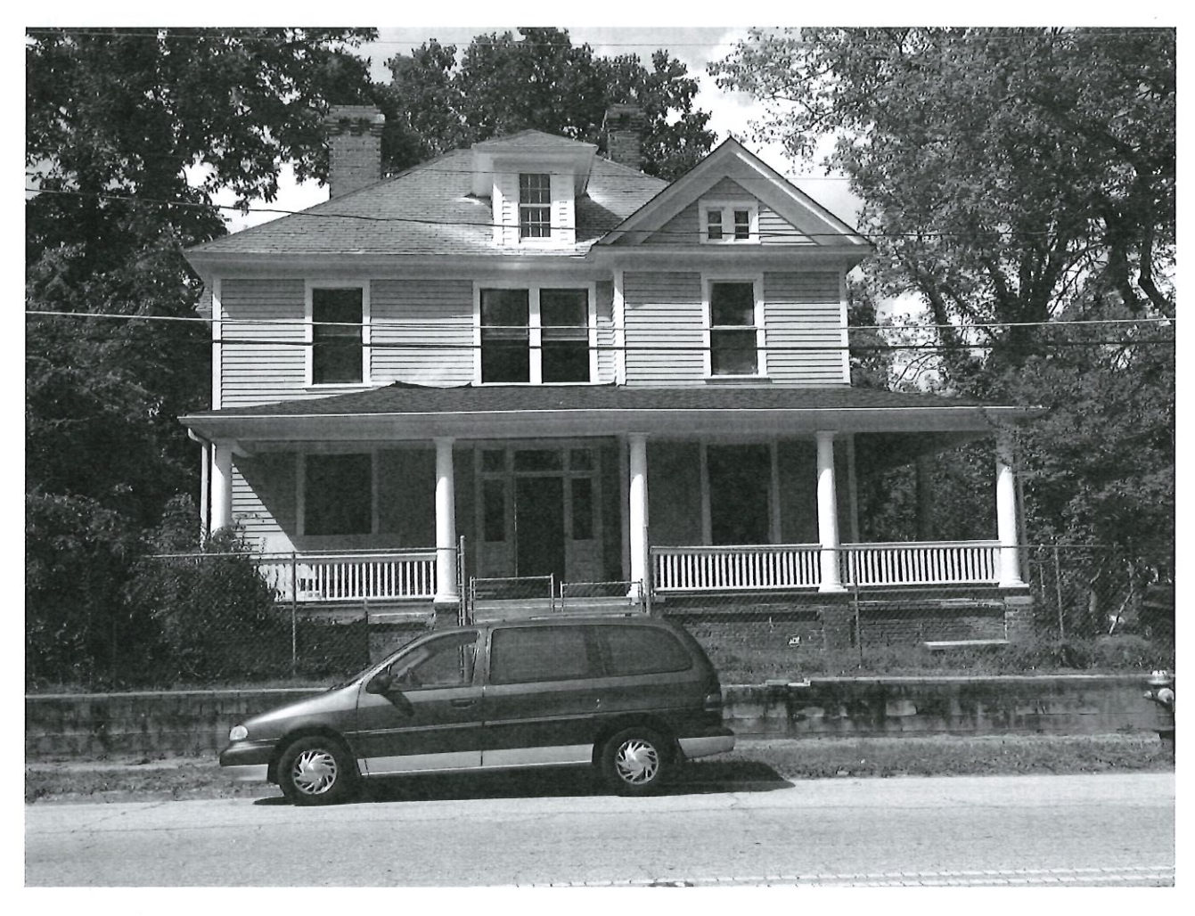
Figure 1: Façade elevation of William A Curtis House (Other Name: Villa Florenza). 1415 Poole Rd, Raleigh, NC 27610. Photo by Xin Rui Xia in July 2017.