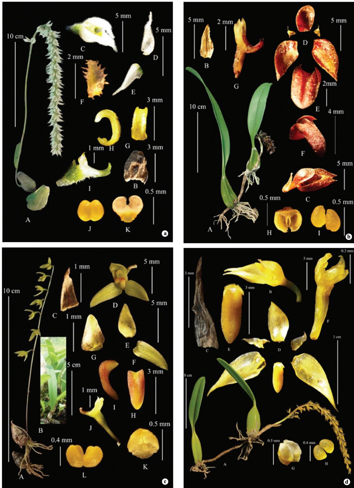
Fig. 2. a. Bulbophyllum hirtum (J.E. Smith) Lindl.: A. Plant; B. Floral bract; C. Flower; D. Dorsal sepal; E. Lateral sepal; F. Petal; G. Lip front view; H. Lip side view; I. Column; J. Anther cap; K. Pollinia; b. B. manipurens Sathish & Suresh: A. Plant; B. Bract; C. Flower; D. Dissected parts; E. Lip front view; F. Lip side view; G. Column; H. Anther cap; I. Pollinia; c. B. polyrhizum Lindl.: A. Plant without leaf; B. Plant with leaf; C. Bract; D. Flower; E. Dorsal sepal; F. Lateral sepal; G. Petal; H. Lip front view; I. Lip side view; J. Column; K. Anther cap; I. Pollinia; d. B. rufinum Rchb.f.: A. Plant; B. Flower; C. Floral bract; D. Dissected parts; E. Lip; F. Column; G. Anther cap; H. Pollinia.