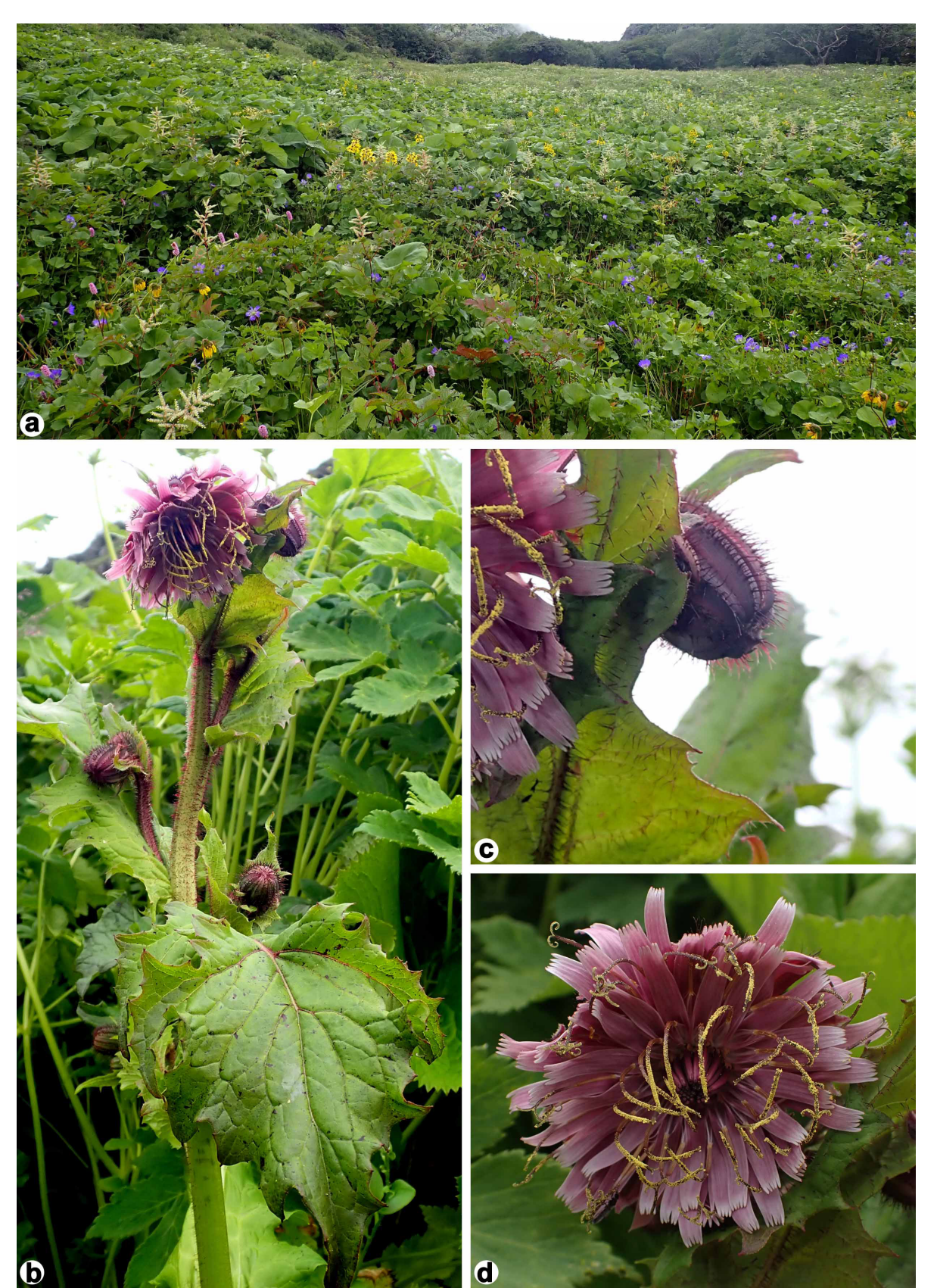
Fig. 1. Dubyaea atropurpurea Stebbins: a. Natural habitat; b. Habit; c. Portion of ventral surface of leaf and young capitulum; d. Top view of an open capitulum (from S. Dey s.n.).