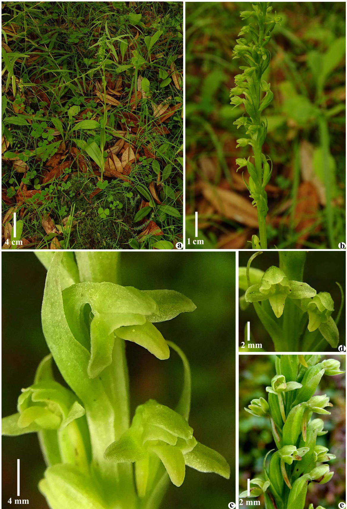
Fig. 1. Platanthera dambungensis K. Prasad sp. nov.: a. Habit; b. Raceme; c-e. Flowers in different view.