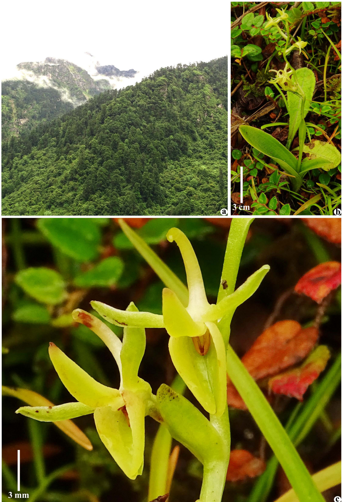
Fig. 3. Platanthera lachungensis K.Prasad sp. nov.: a. Habitat; b. Habit; c. Flowers.