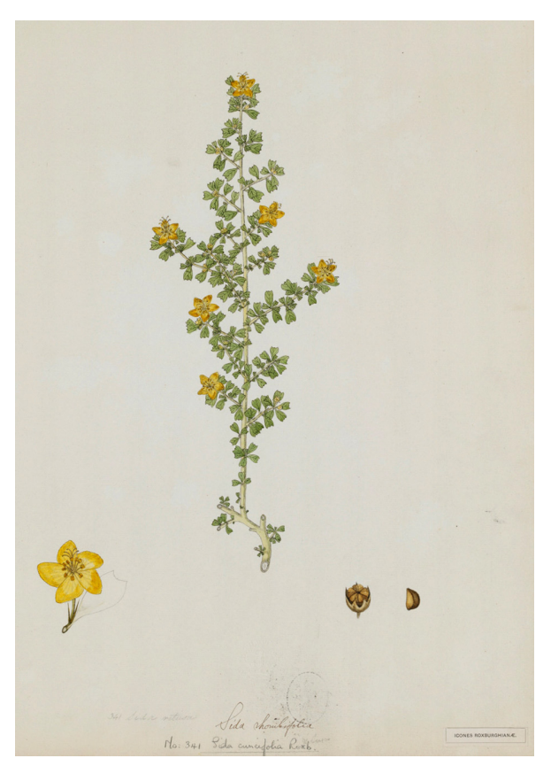
Fig.1. Lectotype of Sida cuneifolia Roxb. drawing in Icones Roxburghianae no. 341 (K) (http://apps.kew.org/floraindica/img/ illustration/large/23372.jpg) © Copyright of the Board of Trustees of the Royal Botanic Gardens, Kew. Reproduced with permission.

digital image!]; isolecto K [K000659371 digital image!]). Fig. 2