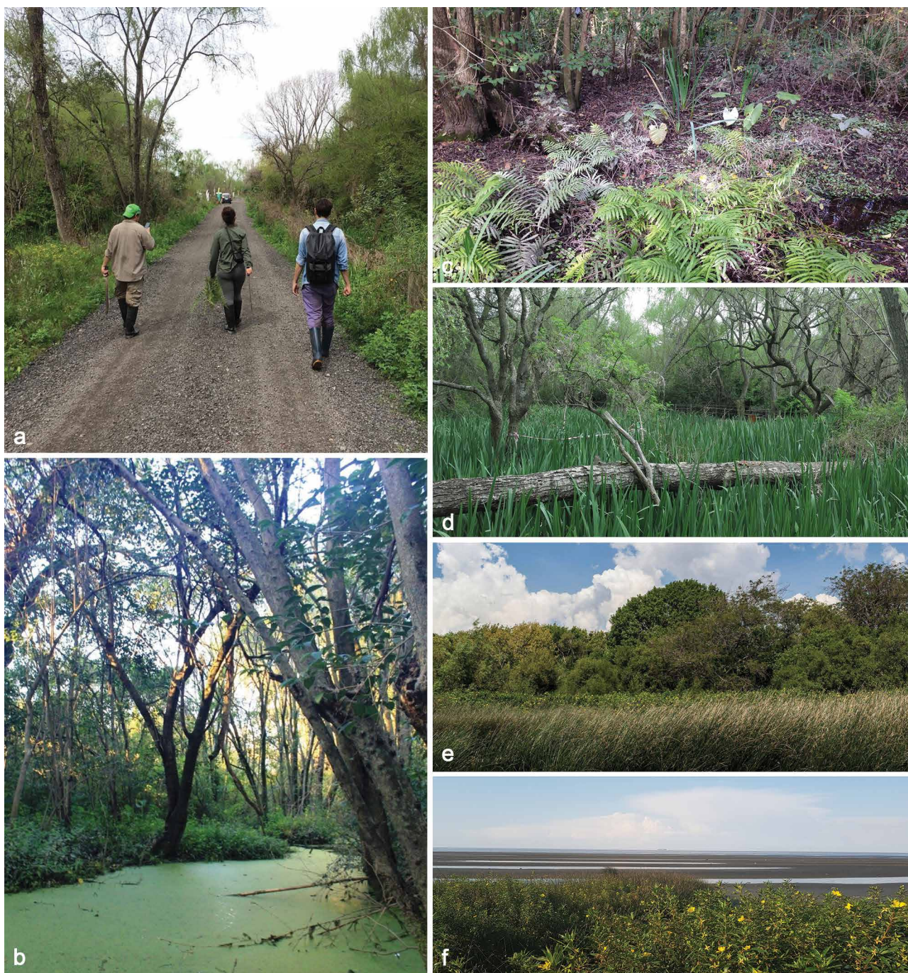
Fig 2 Plant communities and habitats of Municipal Ecological Reserve of Avellaneda. a. Main access trail; b. low flow stream; c–d. flooded understory: c. Cyclosorus interruptus . d. Iris pseudacorus ; e. mixed forest; f. scrubs, reed beds and grasslands of La Plata River margin.

plastic containers and kept in the greenhouse of the Faculty of Ciencias Naturales y Museo from National University of La Plata, until they reached sufficient maturity to observe the diagnostic characters that allowed their identification.