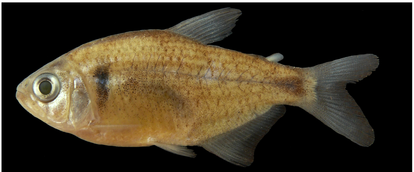
FIGURE 1. Ectrepopterus uruguayensis , ILPLA 1817, female, 44.6 mm SL, El Molino Creek, Entre Ríos Province, Argentina.

Fowler (1943) described Megalamphodus ( Ectrepopterus ) uruguayensis (= E. uruguayensis ) from Uruguay, providing no further locality data. Ever since, few specimens or records for species has been cited in the literature (Géry 1972; Géry 1977; Weitzman and Palmer 1997; Thomaz et al. 2010), until to redescription and