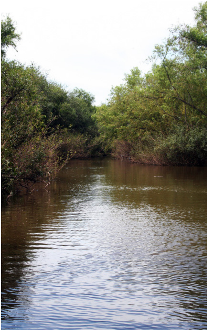
FIGURE 3. Arroyo del Molino in Entre Ríos Province, Argentina: locality of record of Ectrepopterus uruguayensis .

57°12'47"W, 10 Sep 2005, L. R. Malabarba and party. UFRGS 7945, 36.9 mm SL, cañada on road 4, tributary of Río Queguay Chico, Paysandu, Paysandu, 32°01'57"S 57°19'30"W, 10 Sep 2005, L. R. Malabarba and party.