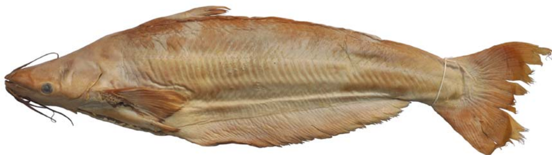
Fig. 1. Holotype of Hypophthalmus oremaculatus , MACN 3496, 335 mm SL.

Prior to the finding and Kottelat’s study of several type specimens of Spix and Agassiz’s Brazilian fishes in MHNN there is no indication that any ichthyologist working on Hypophthalmus examined the syntypes of H. edentatus . Also, Whitehead and Myers (1971) and Terofal (1983) reported that, along with other specimens tracing to Spix, the syntypes of H. edentatus were presumed destroyed in Munich during World War 2. Without type specimens in hand, and armed only with Agassiz’s description based on Spix’s inaccurate depiction (1829, Plate IX), ichthyologists were left with a vague and incorrect picture of the appearance of the species named H. edentatus . Plate IX of H. edentatus in Agassiz and Spix (1829; reprinted in Pethiyagoda et al., 1998, p. 382) illustrates a fish in dorsolateral view that has a relatively short head and distinctly forked caudal fin with pointed lobes. This portrayal conflicts with our and other’s