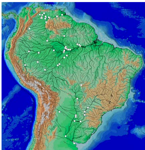
Fig. 5. Distribution map of Hypophthalmus oremaculatus based on specimens documented with appropriately detailed collection locality data.

No doubt the most curious characterization of the holotype of H. oremaculatus made by Nani and Fuster refers to two large and irregular black spots on the palate on which there appear brilliant reflections of microscopic denticles although these are imperceptible when touched. We suspect that Nani and Fuster were describing not palatal teeth but reflections of moist preservative on small epithelial papillae. We observe that the holotype has numerous papillae on the palate but there is no trace of pigmentation or chromatophores on the palate. Oliveira (1981) also