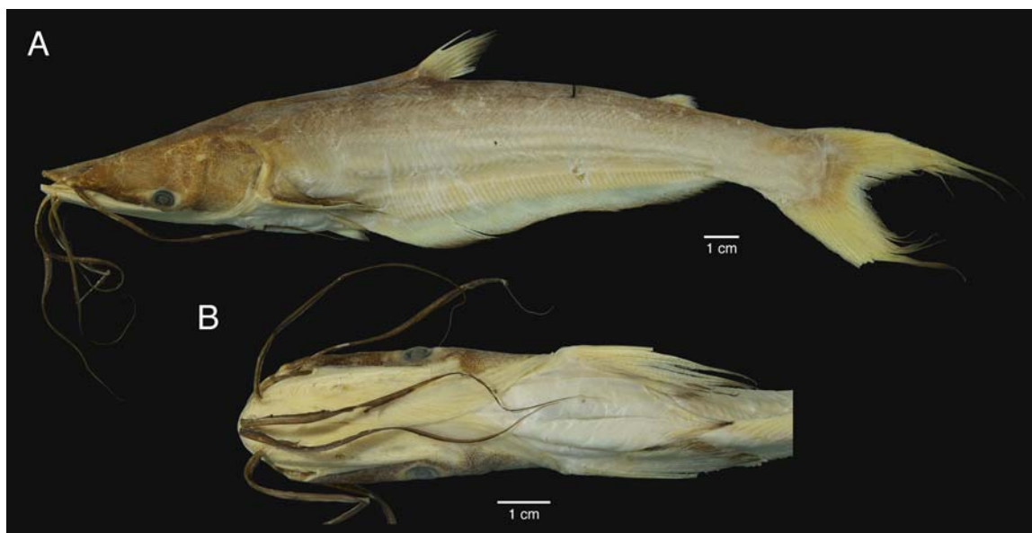
Fig. 4. A representative specimen of Hypophthalmus edentatus ANSP 179219, 227 mm SL, from the Brazilian Amazon showing the elongate, narrow head and deeply forked caudal fin that is characteristic of Hypophthalmus species not included in the Hypophthalmus oremaculatus species group.

zonas, Salgada, Lago Janauacá, 03°25'S, 61°17'W, 7-25 Jan 1977, Alpha Helix Amazon Expedition; MBUCV 2073 (2, 236-253 mm SL), Manaus, 24 Feb 1964, local fishermen; MZUSP 57142 (1 of 2, 110 mm SL), just above Vila de Careiro, 03°14'08"S, 59°56'W, 20 July 1996, Zanata et al.; SIUC 12638 (2, 202-205 mm SL), Est. Amazonas, slough ca. 10 km E of Manaus, 9 Oct 1985, T.E. Shepard and M.T. Barton; USNM 52560 (252 mm SL); between Para and Manaus, 1901, J.B. Steere. Colombia: ANSP 120650 (245 mm SL), Amazonas Dept., Río Amazonas, Leticia market, 04°13'03"S, 069°56'57"W, 27 Jun 1968, Huggins. Peru: ANSP 182743 (1 of 2, 168 mm SL), río Amazonas, Loreto, Maynas, near Iquitos, reportedly from lower río Itaya, 03°44'14"S, 073°13'40"W, 5 Aug 2005, M.H. Sabaj et al.; FMNH 92889 (1), Iquitos market, 03°44'42"S, 073°14'06"W, Jul 1975, local fisherman and D.W. Greenfield et al. Ucayali River Basin. Peru: USNM 284887 (120 mm SL), Dept. Loreto, Coronel Portillo, side caño, 08°22'59"S, 074°33'W, 26 Aug 1986, R.P. Vari; MZUSP 14942 (166 mm SL, ♂), Pucallpa, 08°22'59"S, 074°33'W, 9 Mar 1980, I. Samanez; MZUSP 15129 (89 mm SL), Pucallpa, 08°22'59"S, 074°33'W, 29 Oct 1979, H. Ortega; USNM 273616 (2, 143-153 mm SL), Dept. Loreto, Pucallpa, Puerto Ucayali, 08°22'59"S, 074°33'W, 15 Feb 1983 H. Ortega. Jurura River Basin. Brazil: USNM 196711 (1 of 2, 262 mm SL), Est. Amazonas, Rio Envira, trib of Rio Tarauacá, 07°26'S, 70°1'W, no date. Tefé River and Lake Basin: Brazil: MZUSP