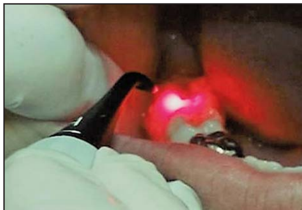
Fig. 2: Mineral Density determinations using laser induced fluorescence.