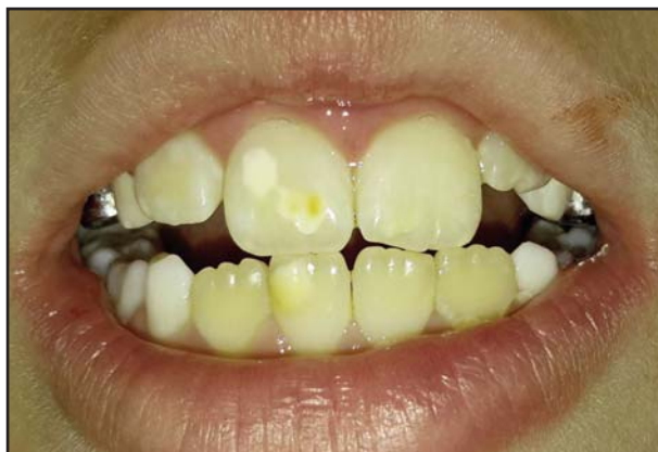
Fig. 1: Upper right incisor showing both mild and moderate MIH lesions simultaneously.