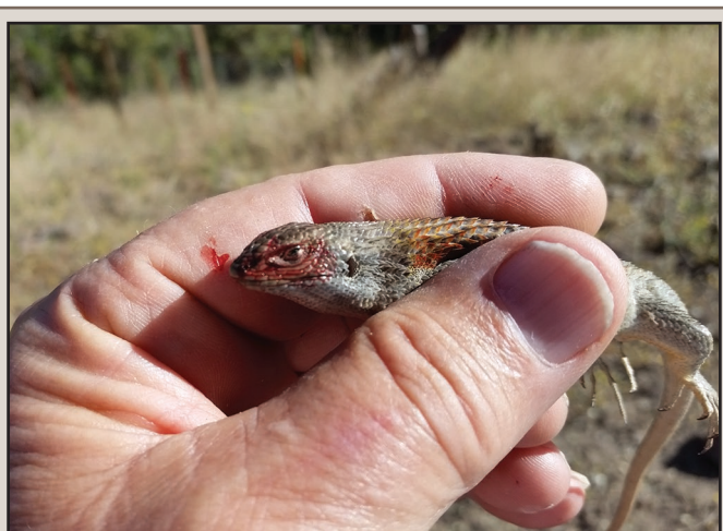
FIG. 1. View of dried blood on the eyes and face of Liolaemus nitidus shortly after pooled blood was swabbed after the captured lizard displayed ocular sinus bleeding in the field.

In the course of a larger study, at 1015 h on 25 February 2016, one of us (SFF) noosed an adult male Liolaemus nitidus from a site in the Andes of central Chile (Curva 31 along road to Farelones; 33.3559°S, 70.3229°W, WGS 84; 2160 m elev.) and upon taking it from the noose, noticed that it had expelled copious blood from both eyes (Fig. 1). This had never before been observed in the capture of hundreds of L. nitidus from this and previous studies at and near this site. The estimated amount of expelled blood was 0.05 ml. The blood pooled around both eyes and drained along the sides of the face and onto SFF's hands. Unfortunately, some of the blood was blotted and dried before photographs were taken. No blood was seen to be squirted. The male subject (74 mm SVL, 131.5 mm tail length, 13 g), was basking on a rock in the open when it was noosed. Weather was sunny with no wind. Air temperature was 32°C; lizard cloacal body temperature was 27.6°C. The subject was noosed no differently than any other lizard. After photographing and measuring the subject, it was released at the point of capture. In less than an hour later,