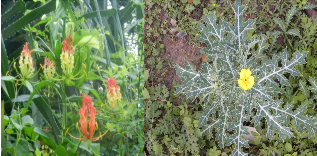
Fig.-3: Gloriosa superba L. Fig.-4: Argemone mexicana L.