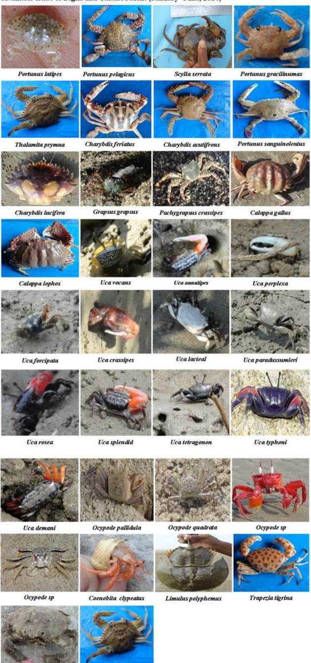
Dromia dromia Portunus argenta

Available crabs of Digha and Talsari beach: (January- June, 2014)