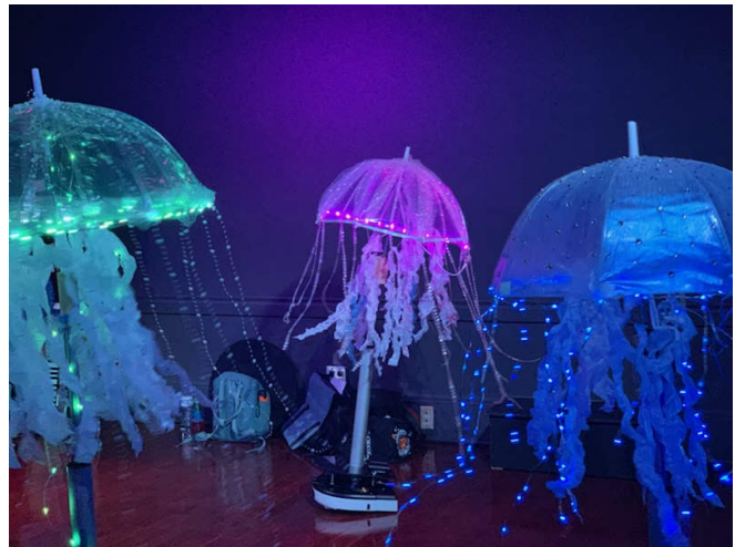
Fig. 1. Robot jellyfish performing in robot comedy show Singu-Hilarity

The study will take place as a special exhibit, ideally in a museum setting. Within the exhibit area, there will be two main areas: the observation area and the interaction area, as seen in Fig. 2-3. In the first iteration of the jellyfish behavior,