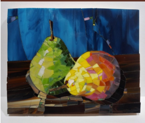
© Dana Helton, A Pair of Pears , Stained glass mosaic on fir wood cradled board