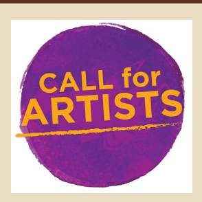
Check our Call to Artist webpage with links to applications and more Information at www.rockmart-ga.gov/ CalltoArtists.aspx or get an application at the RCAC office.

March 13 – April 27, 2024 Rockmart High School Art Exhibit & RHS Gala Reception & Gala - April 27, 2024 - 6-8 pm