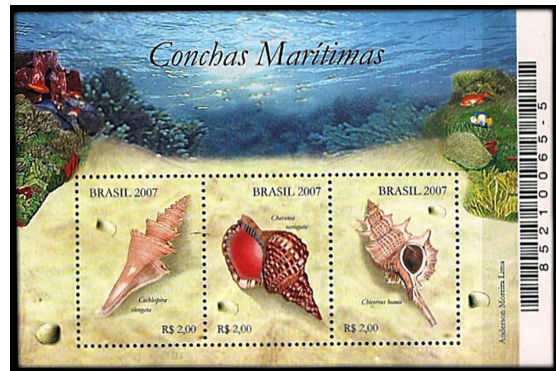
Figure 6. “Marine Shells” series, of 2007; souvenir sheet. From left to right: Cochlespira elongata , Charonia variegata and Chicoreus beauii (now Siratus beauii ).

Chicoreus beauii (Fischer & Bernardi, 1857) is a medium-sized (reaching up to 12 cm in shell length) species of murex snail (Fig. 3I), with a rather disjunctive distribution. It ranges from North and Central America, reaching Venezuela and Pará state in Brazil. After a relatively large distributional gap, it can be found again in southern Brazil, from Santa Catarina to Rio Grande do Sul, having Uruguay as its southernmost occurrence (ROSENBERG 2009). This species is now classified as Siratus beauii (PONDER & VOKES 1988; HOUART 2014) and is also featured in stamps from the Caribbean countries of Grenada/Grenadines and Montserrat (MOSCATELLI 1992).