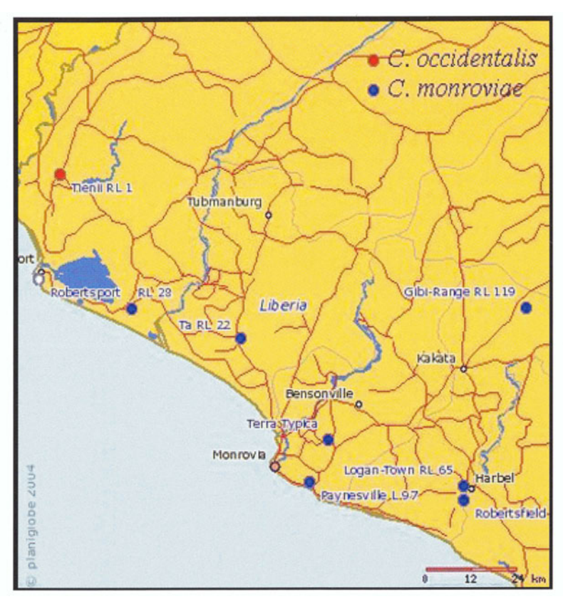
Distribution map of Callopanchax species in Liberia.

returned to Germany in early December, 1971. The following year Roloff and Ladiges (1972) described this as a new species.