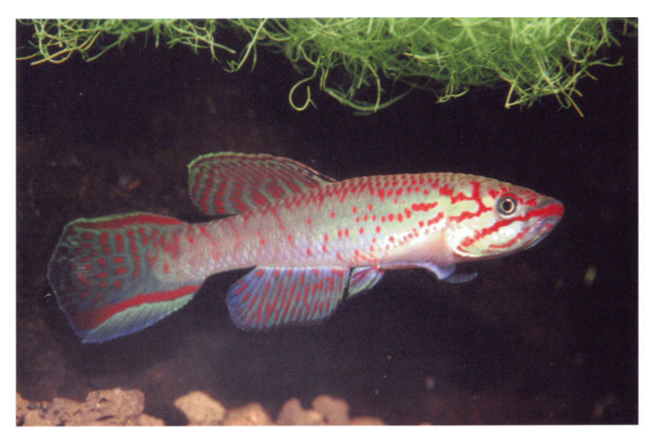
A blue male Callopanchax monroviae derived from a Robertsport population.

A close-up view of the habitat at Logan-Town RL65, where Callopanchax monroviae with a beautiful red color hid beneath the submerged leaves when the collectors approached.