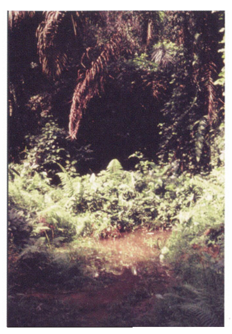
Habitat of Callopanchax monroviae RL 22 near Ta south of Klee.

quite a while along narrow jungle roads. I won't be able to find this location again without the aid from Charles Steiner." This meant that the only person who knew the exact location was Charles Steiner. So, contacting him was crucial to solving this mystery.