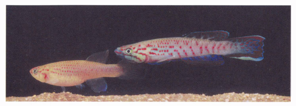
A pair of Callopanchax monroviae "blue" from the type locality.

overhanging grass. There were no other fish present, and the locality contained only a small volume of water, which dried completely during the dry season, which occurred in January. The temperature of the water in this pool during the afternoon was 75°F (24°C), the pH was 6.7 and the total hardness measured 2DH (Roloff, 1973). There were many small creeks in the close vicinity containing Scriptaphyosemion liberiense and Epiplatys species.