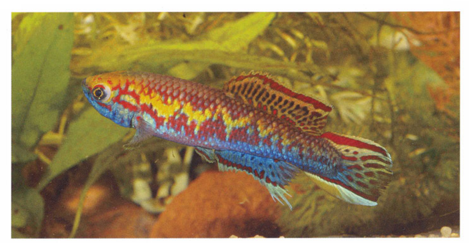
Callopanchax occidentalis Mangata lacks the distinct black marks on the first few dorsal fin rays that are found on Cal. monroviae (below).

One particular feature that distinguishes the male Cal. monroviae