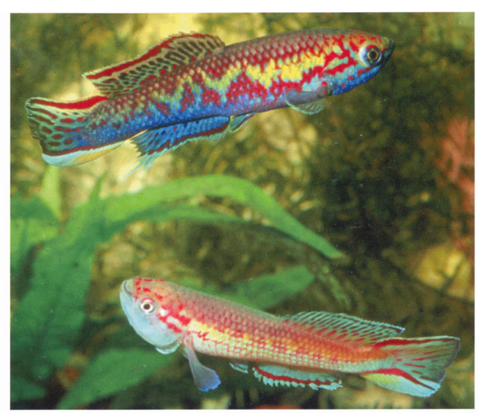
A male Callopanchax occidentalis Mangata (top) and a male Cal. occidentalis Teme Yellah displaying agonistic behavior when placed in the same aquarium. Many Callopanchax species are fairly aggressive in the aquarium.

from males of other Callopanchax species is the dark marking located at the first two rays of the dorsal fin. This marking becomes jet-black during courting and agonistic behavior. The Paynesville and type locality populations have narrow red vertical bars on the posterior parts of the flanks. These are most obvious in iuveniles but also visible in adult males and females. These markings are not present in the Logan-Town and Robertsfield populations. The male has a unique red throat coloration unlike other Callopanchax species, in which the throat is normally white or blue, but can turn black when the male is excited.