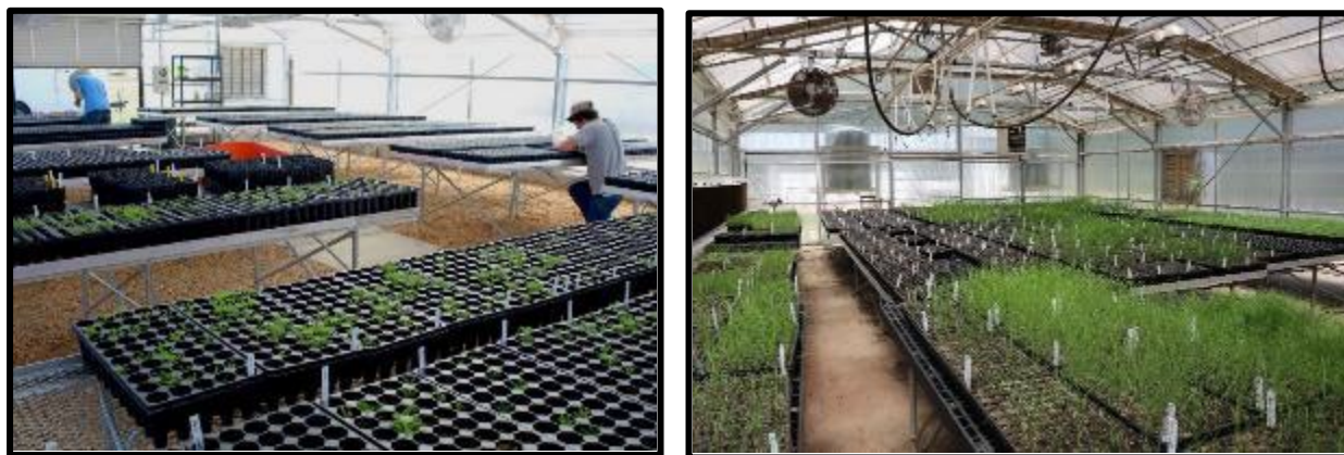
Figure 4-1 Seeds being planting in the greenhouse at the South Texas Natives Farm in Kingsville, TX (left). Greenhouse production at the NRCS East Texas Plant Materials Center in Nacogdoches, Texas (right).

The evaluation portion of the seed source development process begins once a suitable number of collections representative of the geographic distribution of a species of interest are obtained. Common garden studies replicated across project regions, and the state, are established in order to evaluate the seed quality and production potential of each species. In order to maximize efficient use of collected seed, all plant propagation begins in a greenhouse setting (Figure 4-1).