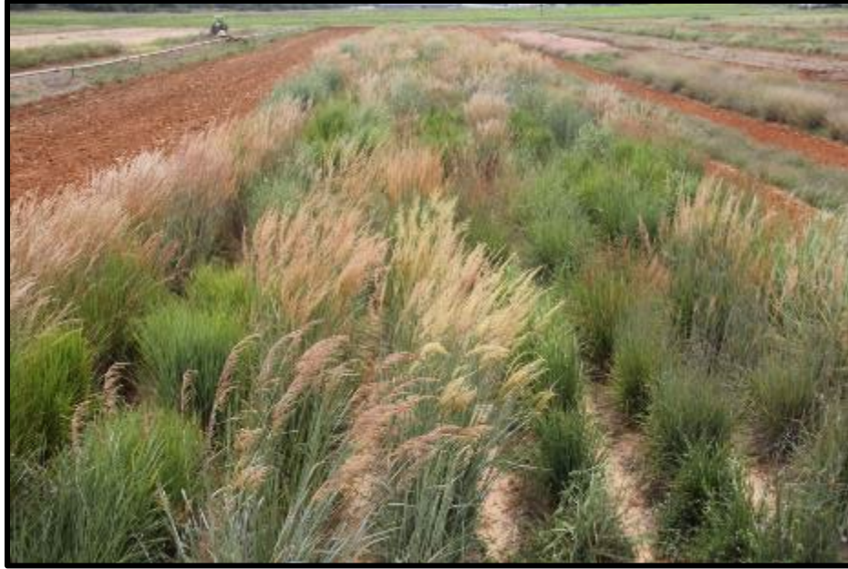
Figure 5-3. Indiangrass accession variability visible in the evaluation plot located in Stephenville, Texas. The multi-region evaluation of Indiangrass included prior releases currently available on the commercial market alongside regionally collected local ecotypes.