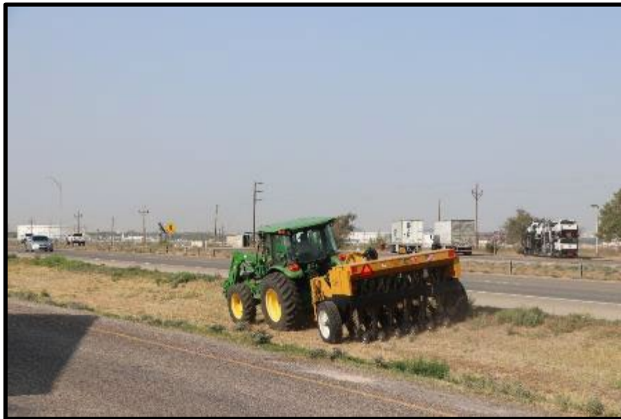
Figure 6-3. A safety rest area demonstration planting in Midland, Texas.

In the fall of 2020, five of the six sites were seeded. The remaining site, Ward County, was seeded in the spring of 2021 due to an abundance of Lehmann lovegrass on the planting site. All sites were sprayed with glyphosphate to suppress or remove exisiting vegetation, and then seeded using a no-till seed drill Figure 6-3. Emergence data were taken bi-monthly, if possible, and are summarized in Table 6-3. A breakdown of the 5 different seed mixes chosen for each site can be found in Appendix B.