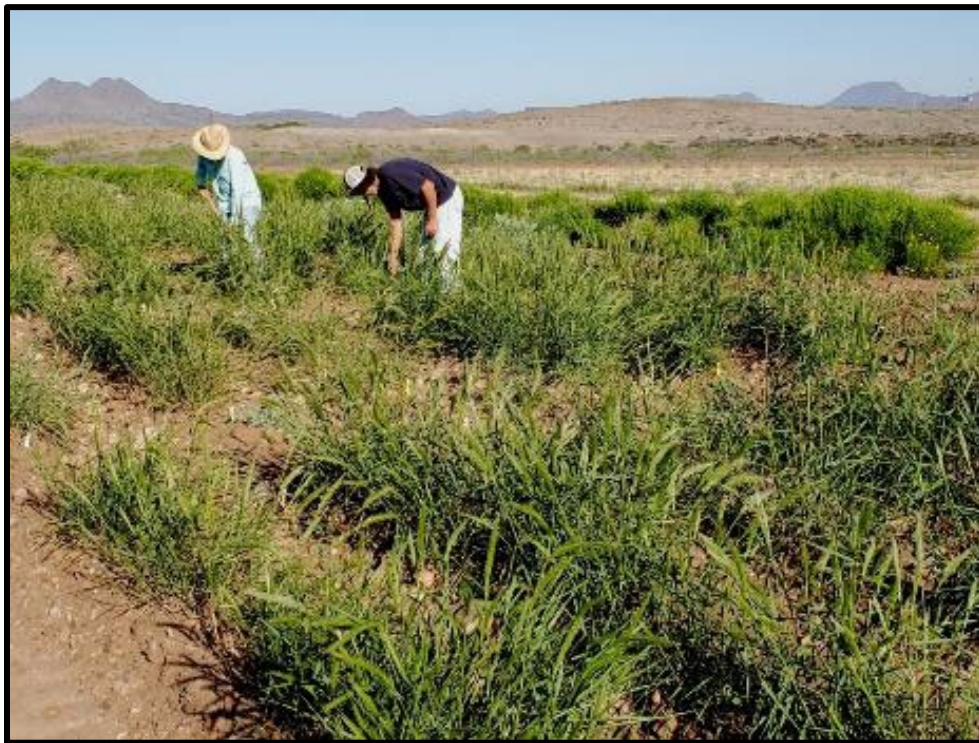
Figure 4-6. Native plant evaluations of Canada wildrye being cleaned and maintained at the Sierra la Rana site in Alpine, Texas.