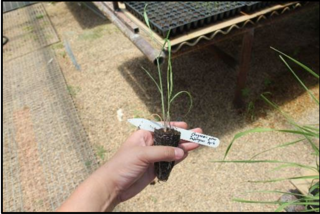
Figure 4-2. Greenhouse grown plant plug of Indiangrass prior to installation at an evaluation site.