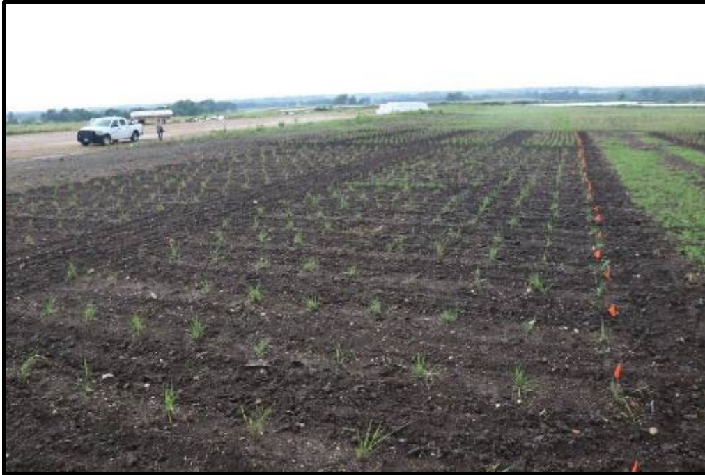
Figure 4-3. Initial evaluations of Indiangrass (front) and silver bluestem (back) located at the Daisy Farms Dairy in Paris, Texas.

Over the 3 year project period, plantings were undertaken in greenhouses at the South Texas Natives Farm (Kingsville, TX), Sul Ross State University (Alpine, TX), Texas A&M Agrilife Research- Stephenville (Stephenville, TX), and the USDA NRCS East Texas Plant Materials Center (Nacogdoches, TX). Greenhouse production numbers for FY 2019, 2020, and 2021 are illustrated in Table 4-1.