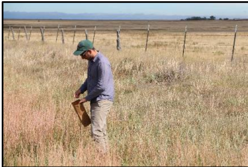
Figure 3-2 Native seeds are hand collected when ripe.

Collection sites were targeted based on rainfall analysis and historical distribution maps. The goal has been to obtain 2 collections of each species from each county where that species occurs. Seeds were hand collected when ripe (Figure 3-2). GPS coordinates, elevation, soil series and texture, specific locality, and county of collection were all recorded and logged through the USDA NRCS accession number identification process.