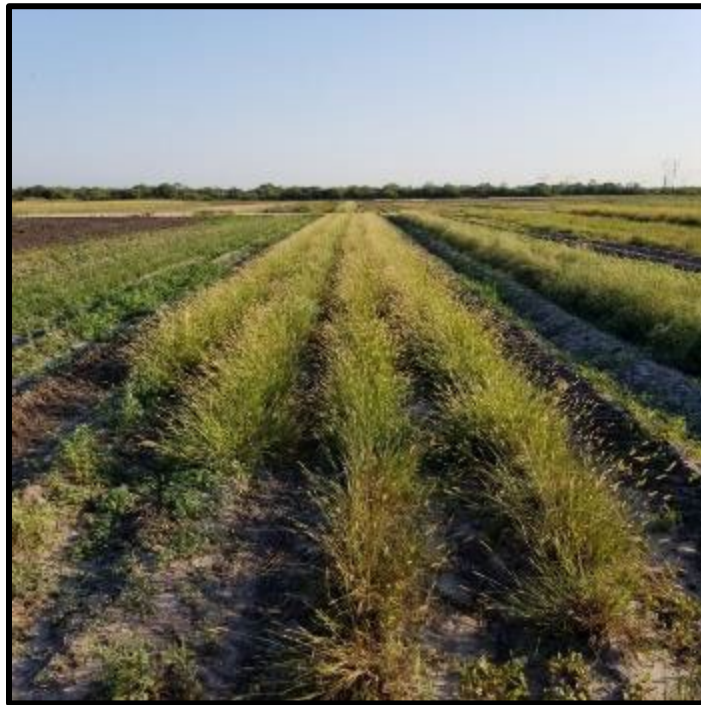
Figure 5-1. Seed increase plot of the Coastal Prairies selection of Knotroot bristlegrass being grown at the South Texas Natives Farm in Kingsville, Texas.

Following the evaluation portion of the seed development process, top performing accessions of each species are selected for seed increase. Seed increase plots are transplanted from greenhouse propagated plant plugs to ensure genetic purity to the original collections selected. Plots are irrigated and intensely managed in an effort to maximize seed production (Figure 5-1). All seed increase plots are monitored for pest damage and any other issues that might hinder commercial production. In addition, each selected accession is farmed in isolation from other selected accessions of the species to ensure genetic integrity. Seeds harvested (Figure 5-2) from each accession are then blended together and given to commercial producers to use in the establishment of commercial production fields of each release. Seed increase information for each project region is reported by task and fiscal year in Tables 5-1, 5-2, and 5-3.