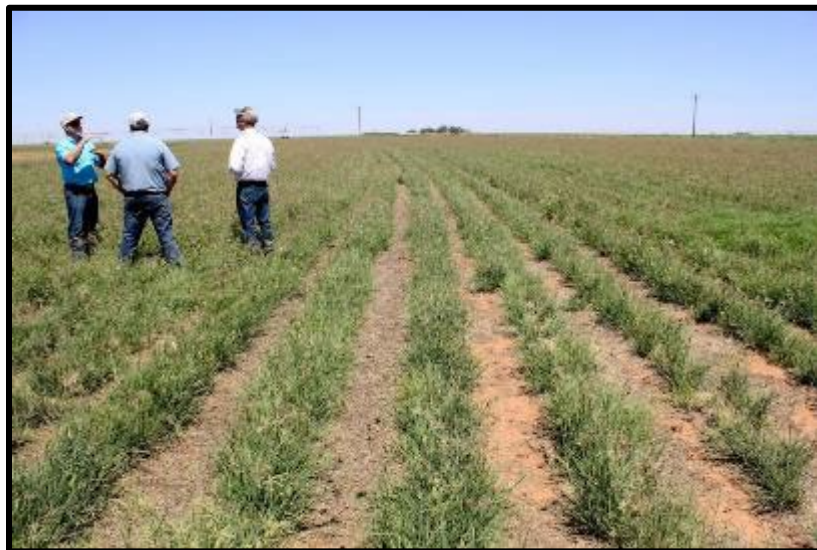
Figure 6-2. A Bamert Native Seed commercial production field of Burnett Germplasm hooded windmillgrass located in Muleshoe, Texas.

In 2019, a new bid proposal system was initiated in an effort to ensure commercial production of released species was offered to commercial seed producers by a fair process. In addition to a fair process, licensing of new releases allows for minimum production acres to be required which helps to ensure commercial availability. The non-exclusive license to produce species upcoming for release was put out for bid proposals to any company interested in producing the releases. Proposals were reviewed