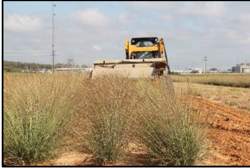
Figure 5-2. Seed increase fields of sideoats grama in Stephenville, Texas, being harvested by a flail-vac seed harvester.