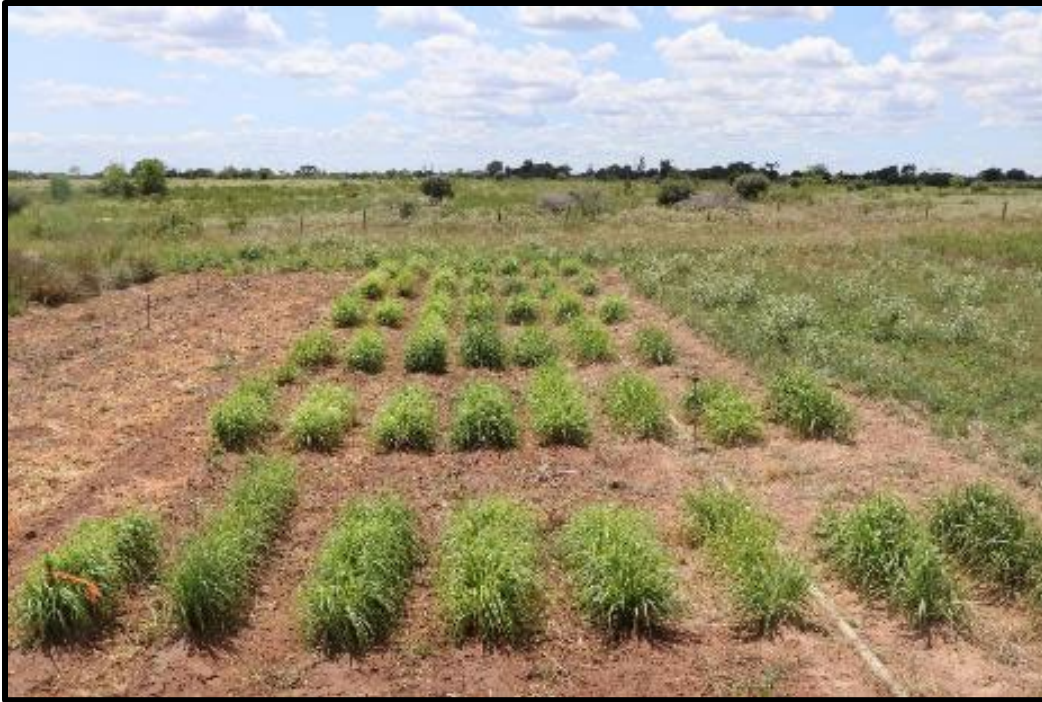
Figure 4-5. Native plant evaluations of purpletop tridens accessions in Cat Spring, Texas.