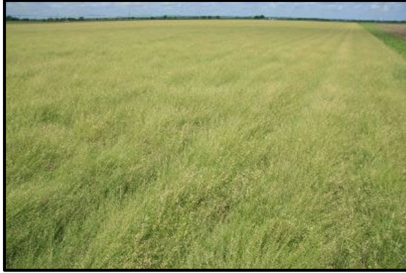
Figure 6-1. A Douglass King Seed Company commercial production field of Dilley Germplasm slender grama located in San Antonio, Texas.